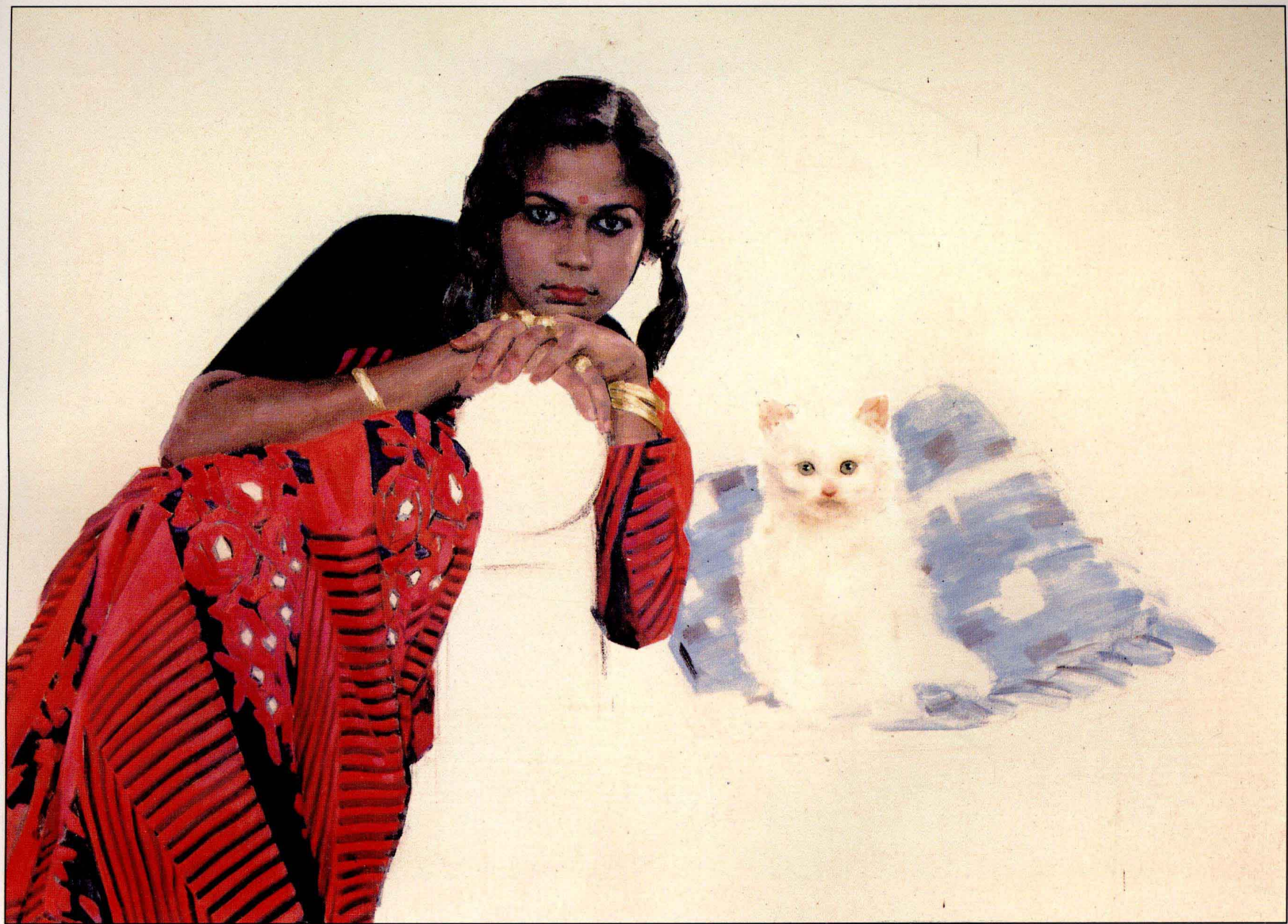
9 波斯猫(局部) 油画 150×115cm 于牧