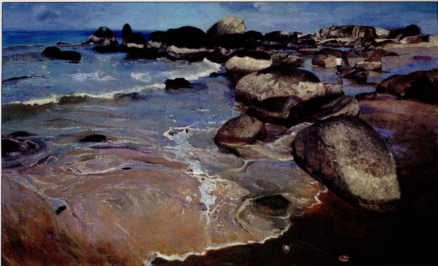
1 大海的记忆 油画 130×81cm 艾民有