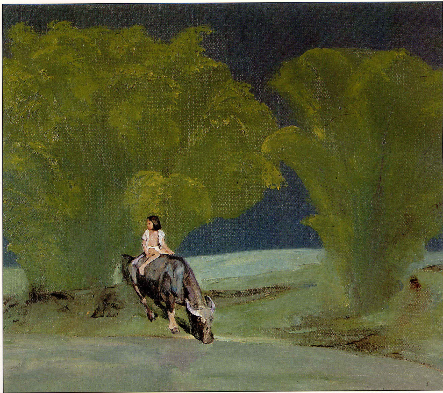
6 童年的梦 油画 75×61cm 艾民有