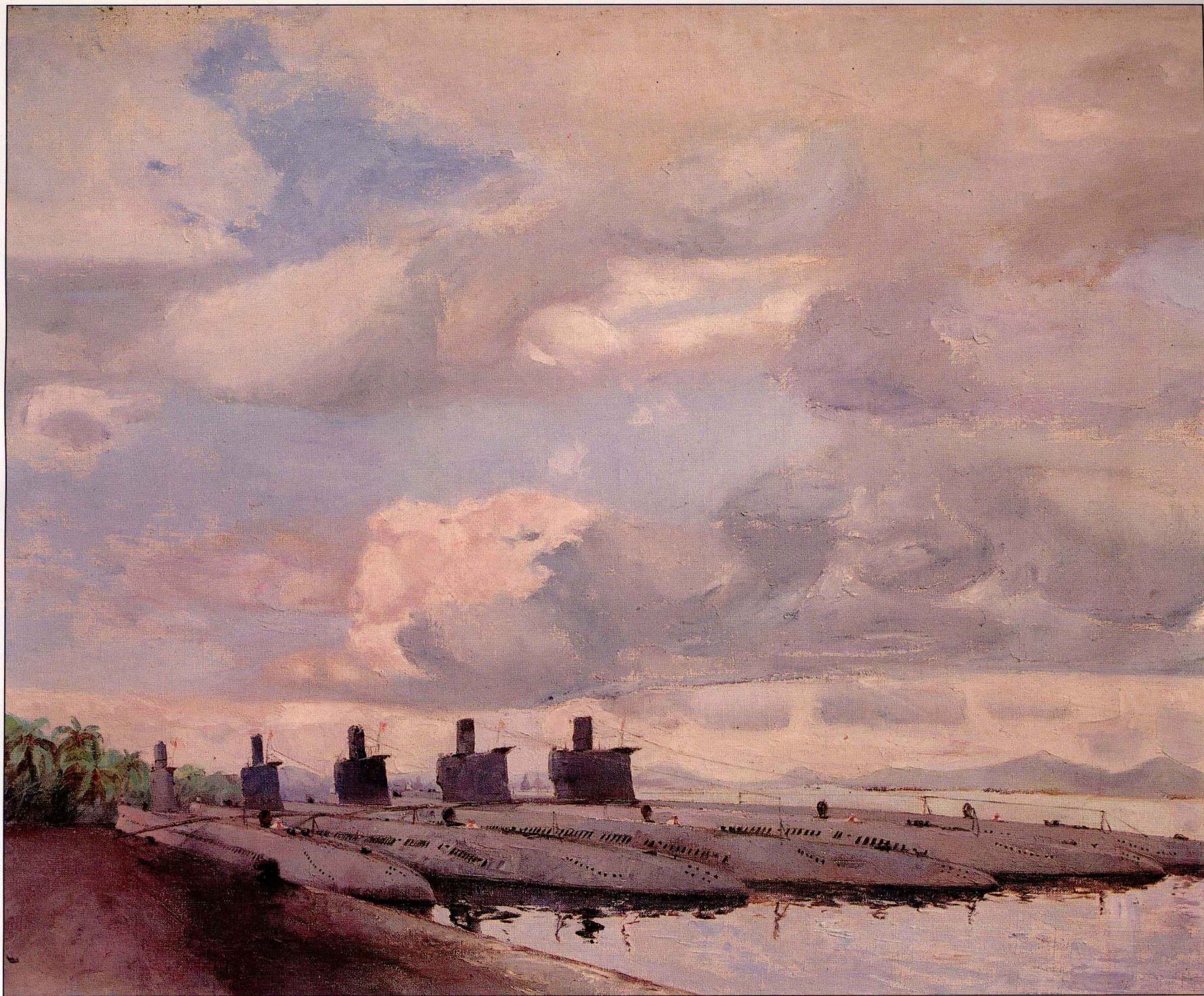
7 南海蓝鲸 油画 130×100cm 艾民有