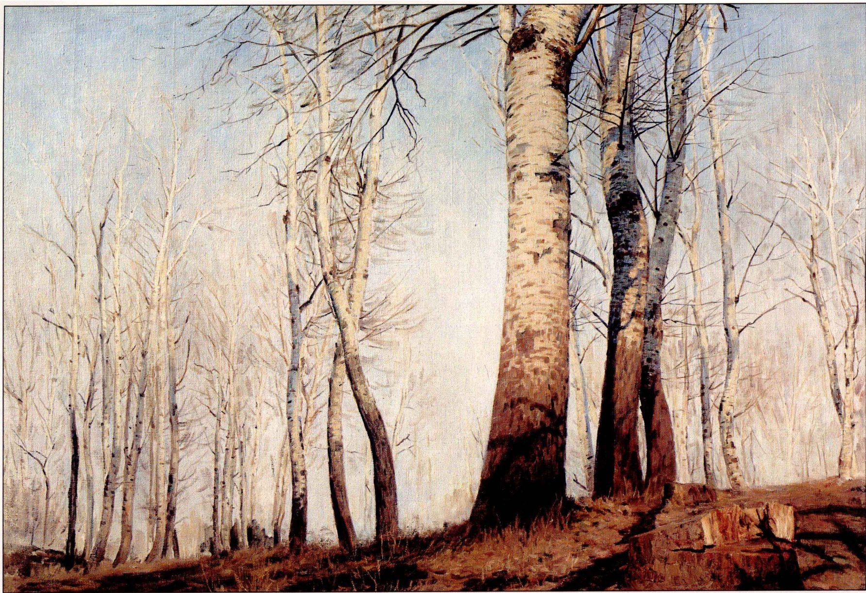
10 白杨 油画 130×90cm 于牧