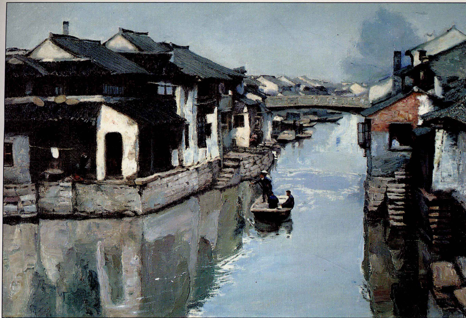
5 水乡 油画 90×60cm 艾民有