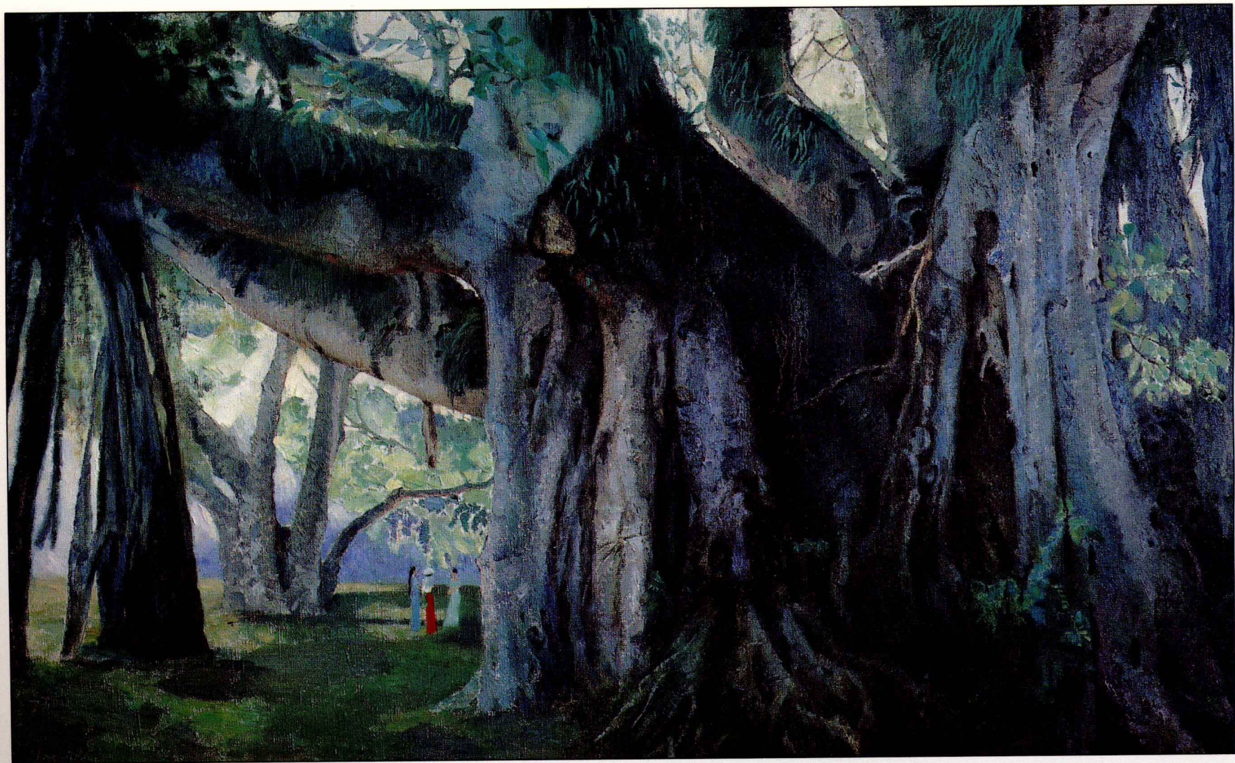
4 大地深情 油画 130×81cm 艾民有