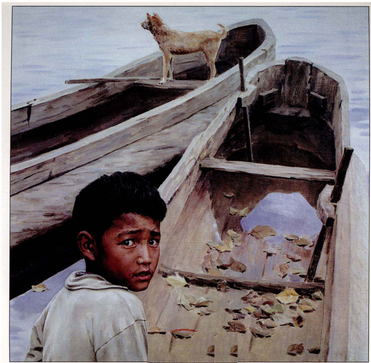
11 秋水 油画 70×70cm 于牧