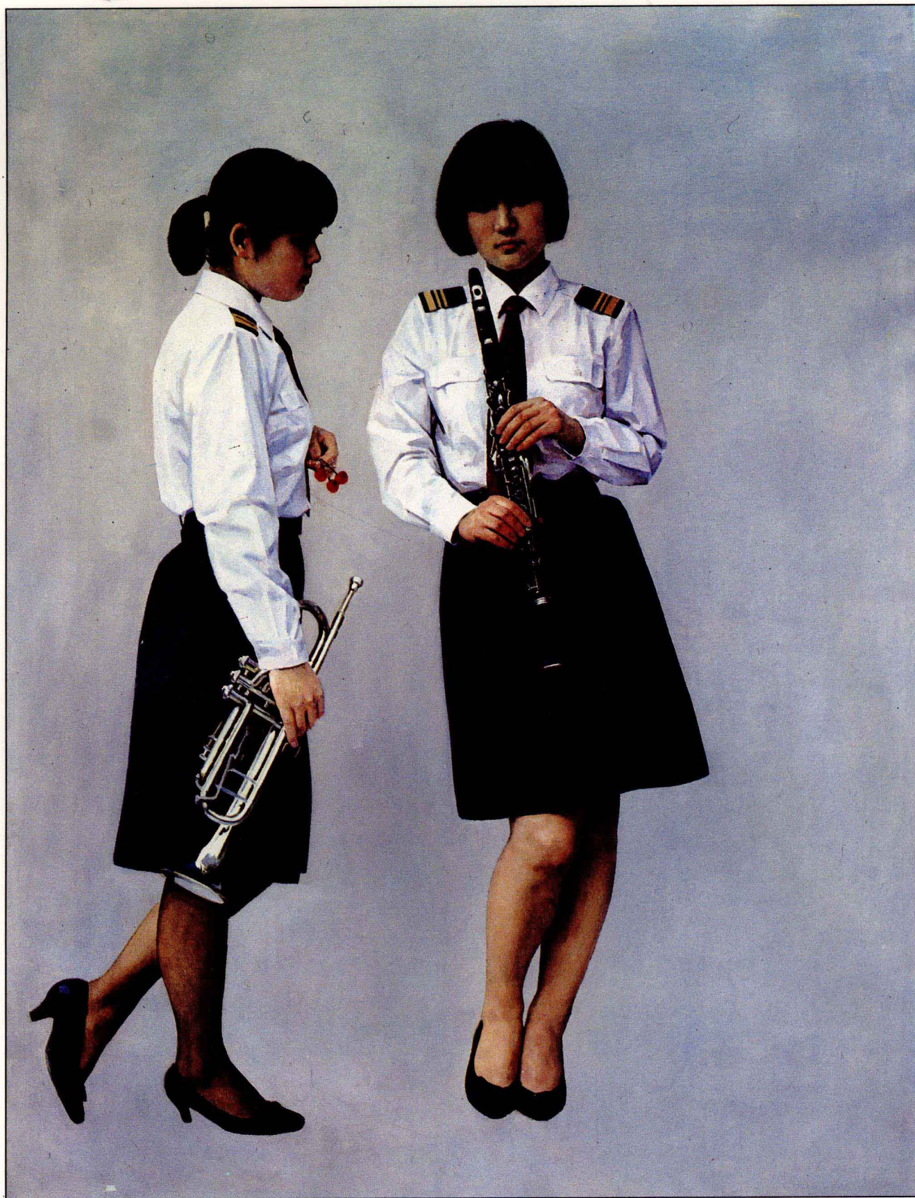
8 多梦时节 油画 115×150cm 于牧