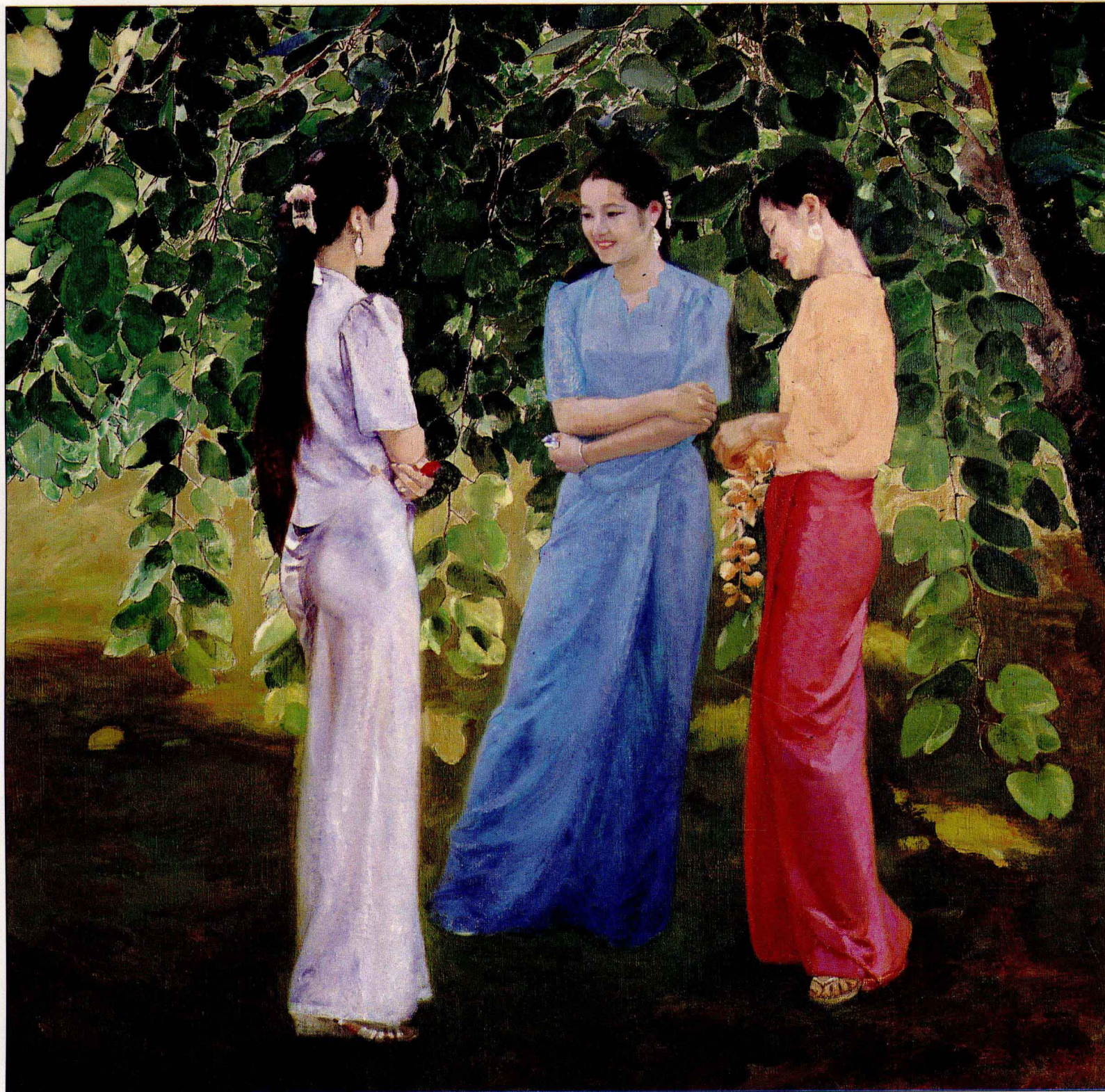
3 绿荫 油画 120×120cm 艾民有