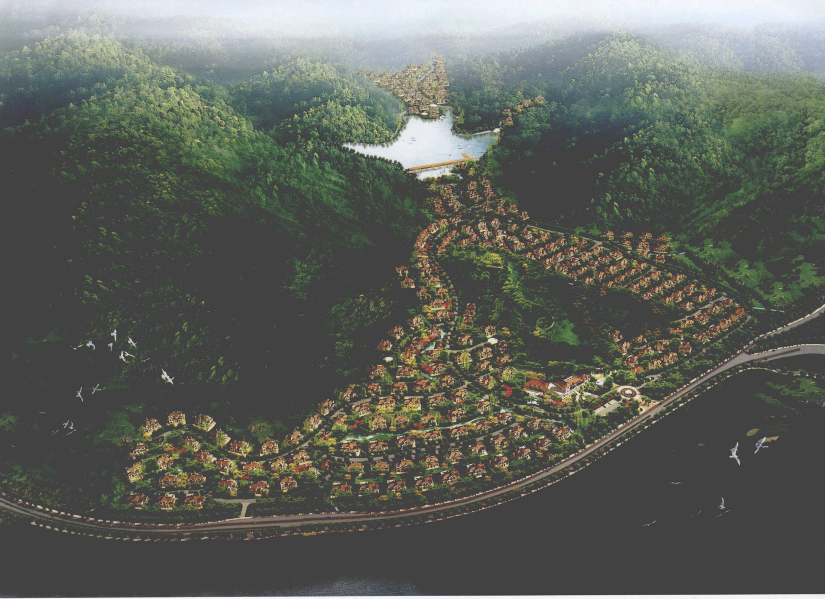
Aerial View of Planning 规划鸟瞰图

华润置地卡纳湖谷项目位于宁波市东钱湖旅游度假区内，三面环山，面朝东钱湖，拥有一线湖景，为宁波景观资源最好的别墅区。项目总占地面积为30多万平方米，内拥稀缺至极的6万平方米内湖和4万多平方米天然山林，整体项目规划约480户，也是目前宁波最大的纯别墅社区。