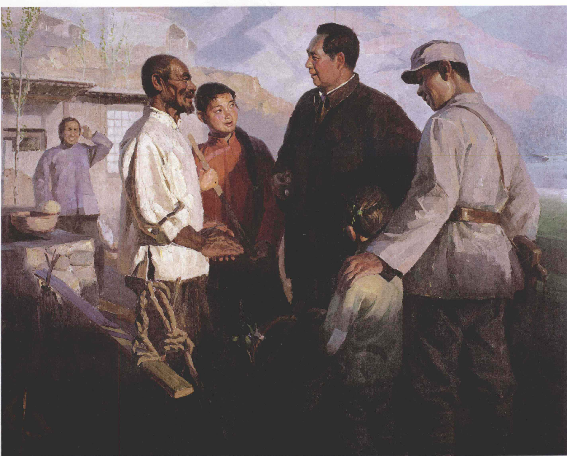
3. 毛泽东与农民谈话 油画 MAO ZEDONG CHATTING WITH PEASANTS Oil on canvas 173cm × 216cm (68" × 85") 1978