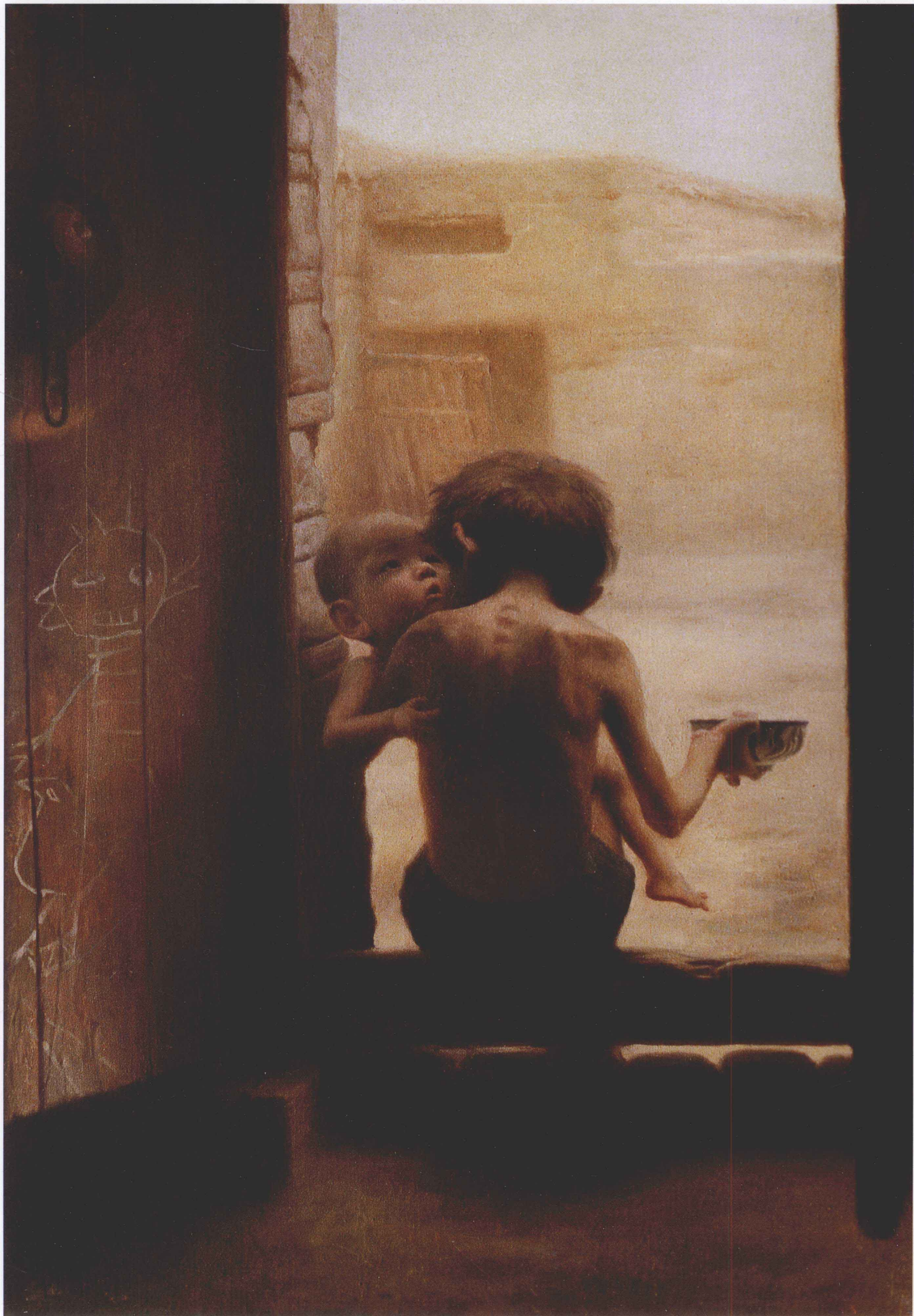
7. 门槛 油画 THRESHOLD Oil on canvas 64cm × 48cm (25 \frac{1}{8} " × 18 \frac{7}{8} " ) 1983