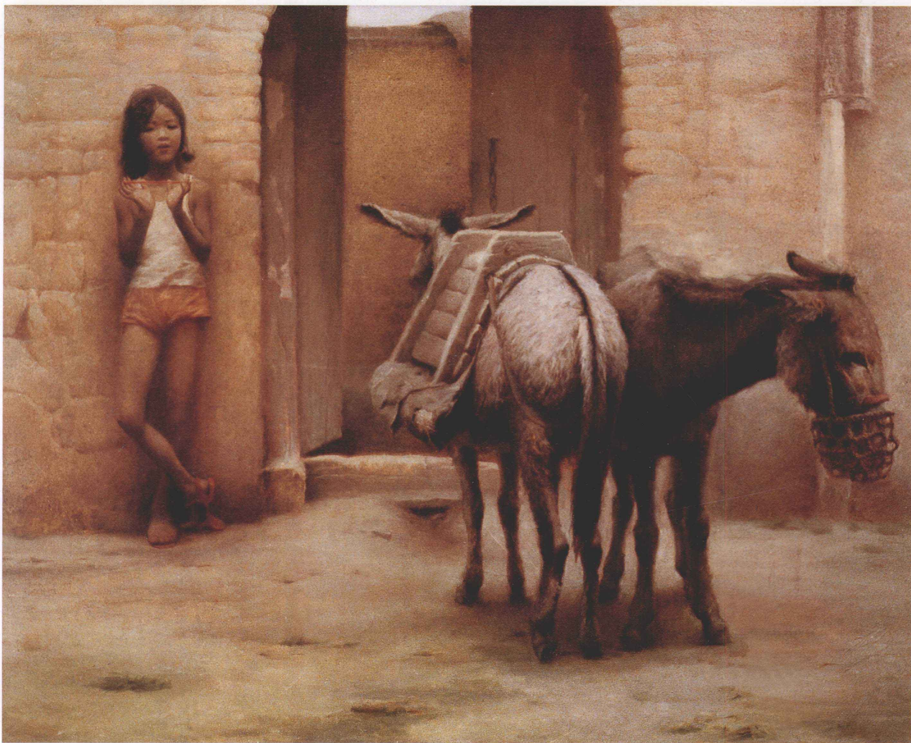
5. 小村 油画 SMALL VILLAGE Oil on canvas 60cm × 68cm (23 \frac{5}{8} " × 26 \frac{3}{4} ") 1983