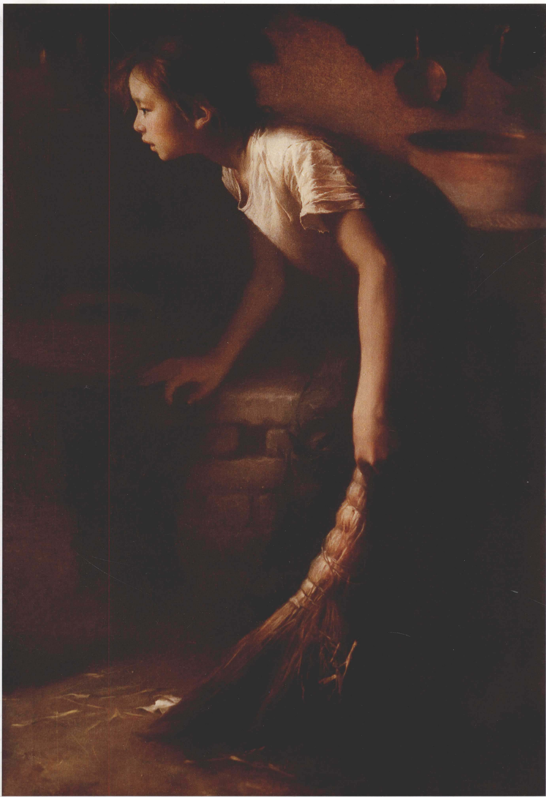
6. 看顾 油画 WATCHING Oil on canvas 64cm × 48cm (25 \frac{1}{8} " × 18 \frac{7}{8} " ) 1983