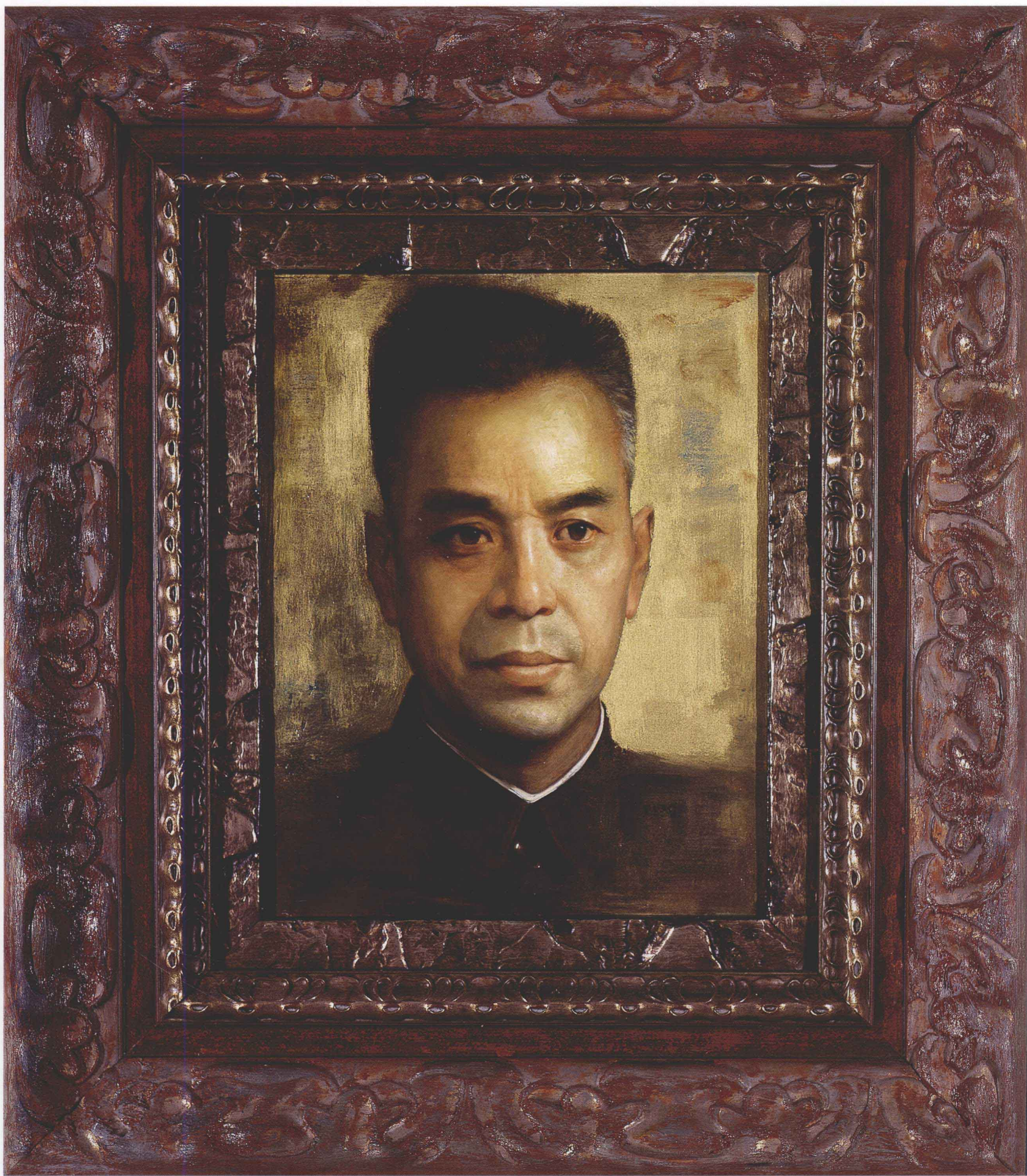
1. 父亲 木板油画 MY FATHER Oil on panel 41cm × 31cm (16 \frac{1}{8} " × 12 \frac{1}{4} ") 2002