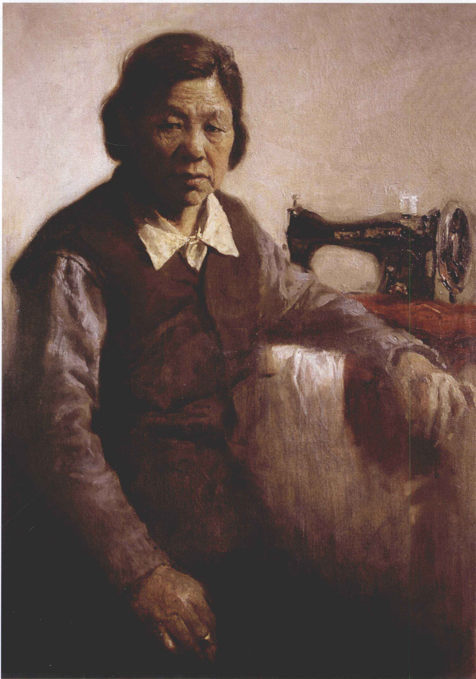
2. 母亲 油画 MY MOTHER Oil on canvas 66cm × 45cm (26" × 17 3 / 4 ") 1982