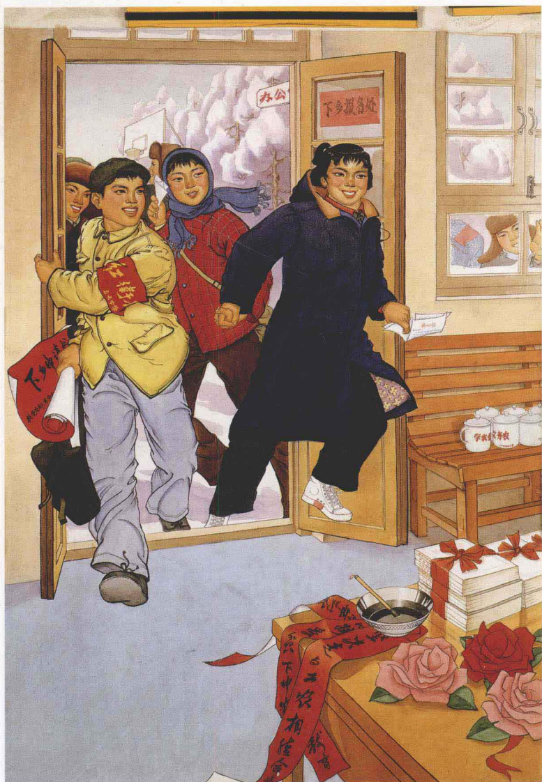
4. 报名 工笔重彩 THE SIGN Fine brushwork 80cm × 54.5cm (31 × 21 \frac{3}{4} ") 1974 画家时为16岁 The artist was 16 years old then.