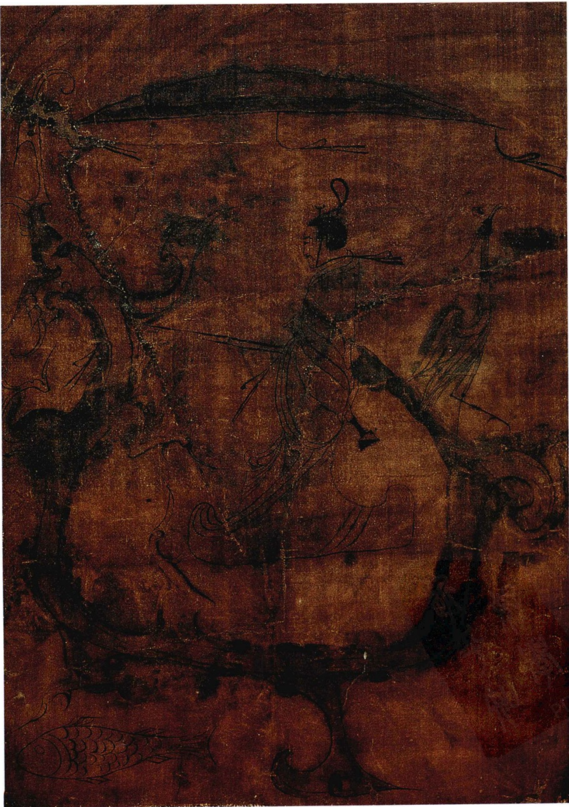
戰國 人物禦龍圖（帛畫） Warring States: Riding on a Dragon (Silk Painting) 37.5×28 cm