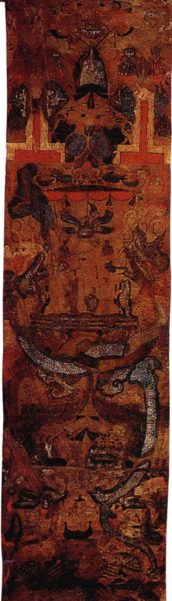
Western Han: Ascending to Heaven (Silk Painting) (Detail of Painting on Following Page)

Vertical: 233 cm. Upper horizontal: 141 cm. Lower horizontal: 50 cm