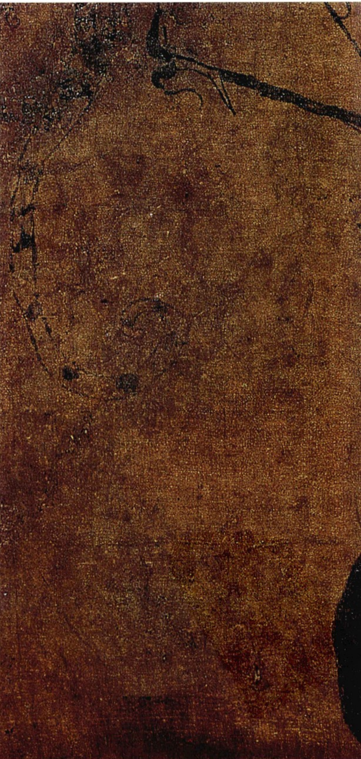
Warring States: A Person with a Dragon and a Phoenix (Silk Painting) (Partial) 戰國 人物龍鳳圖 (帛畫) (局部)