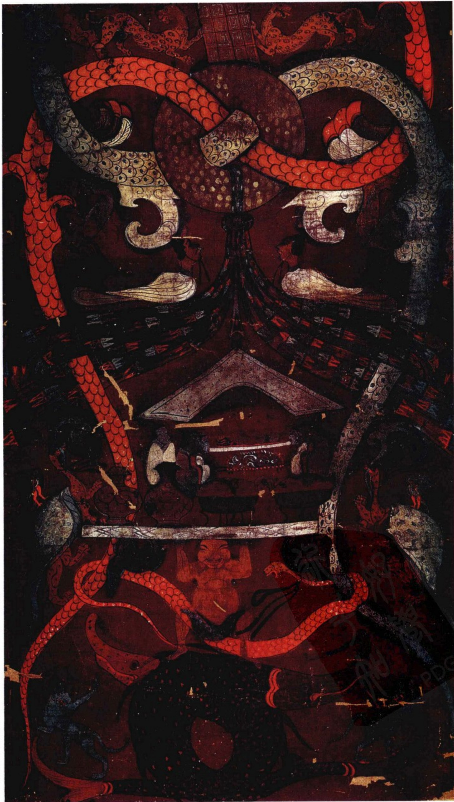
Western Han: Ascending to Heaven (Silk Painting) (Partial)