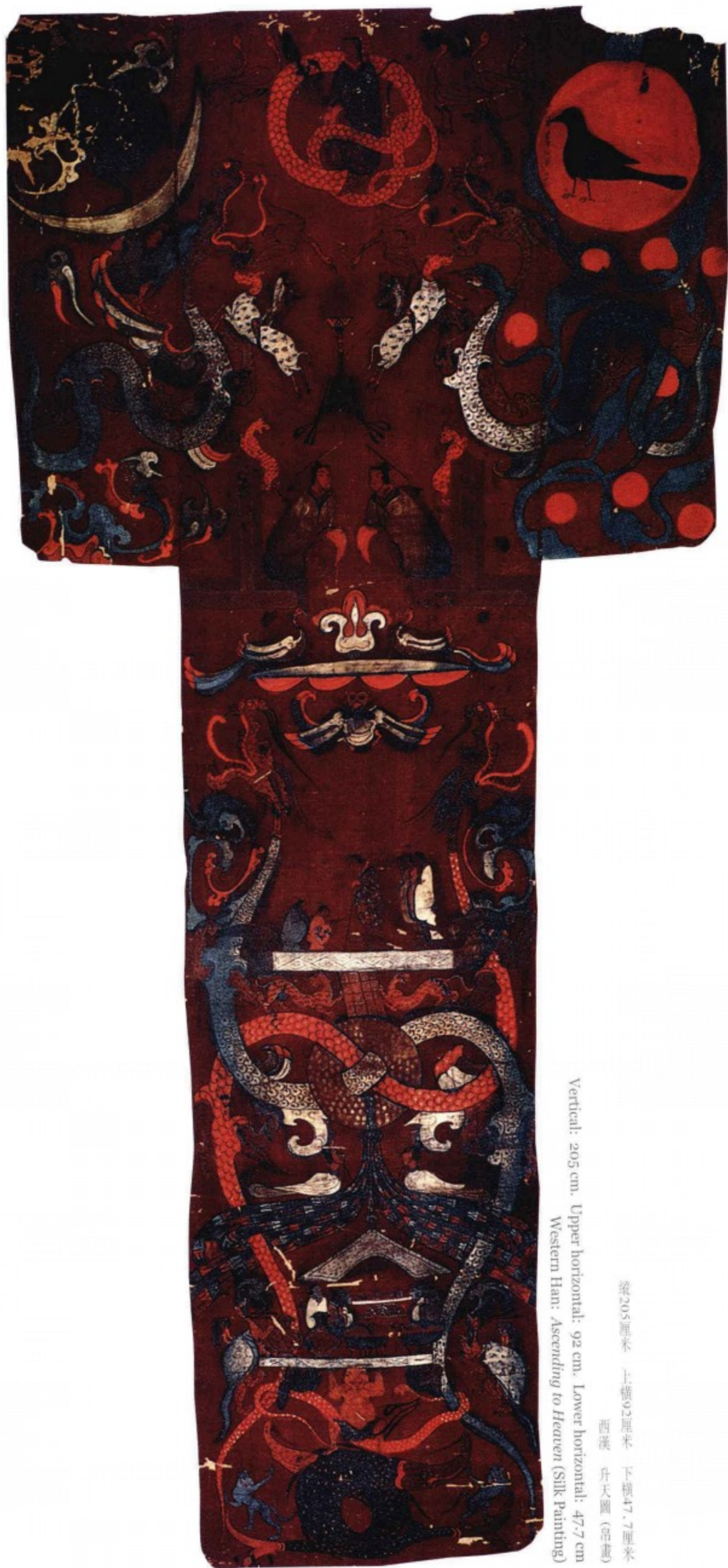
縱205厘米 上橫92厘米 下橫47.7厘米 西漢 升天圖（帛畫） Vertical: 205 cm. Upper horizontal: 92 cm. Lower horizontal: 47.7 cm Western Han: Ascending to Heaven (Silk Painting)