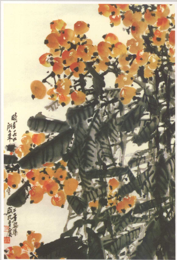
10. 枇杷 Loquat