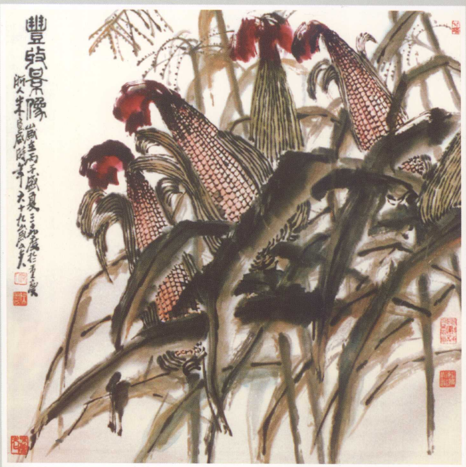
4. 丰收景象 Coming Harvest