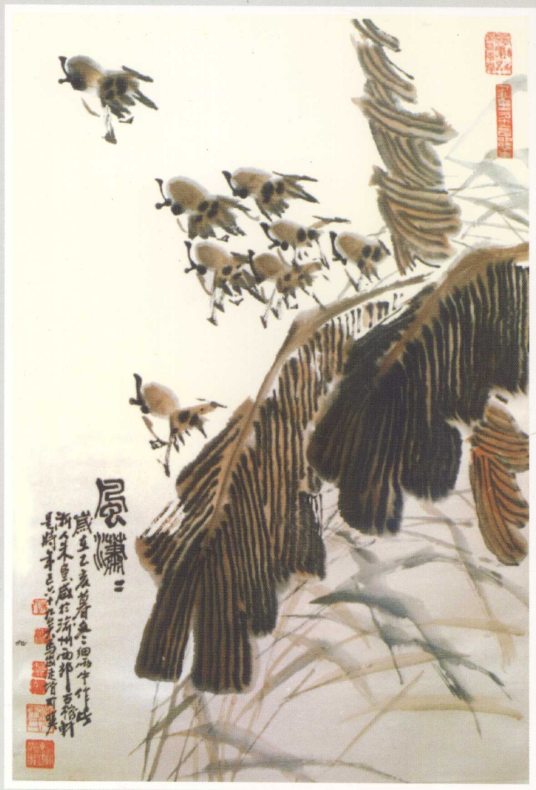
11. 风潇潇 Soughing Wind