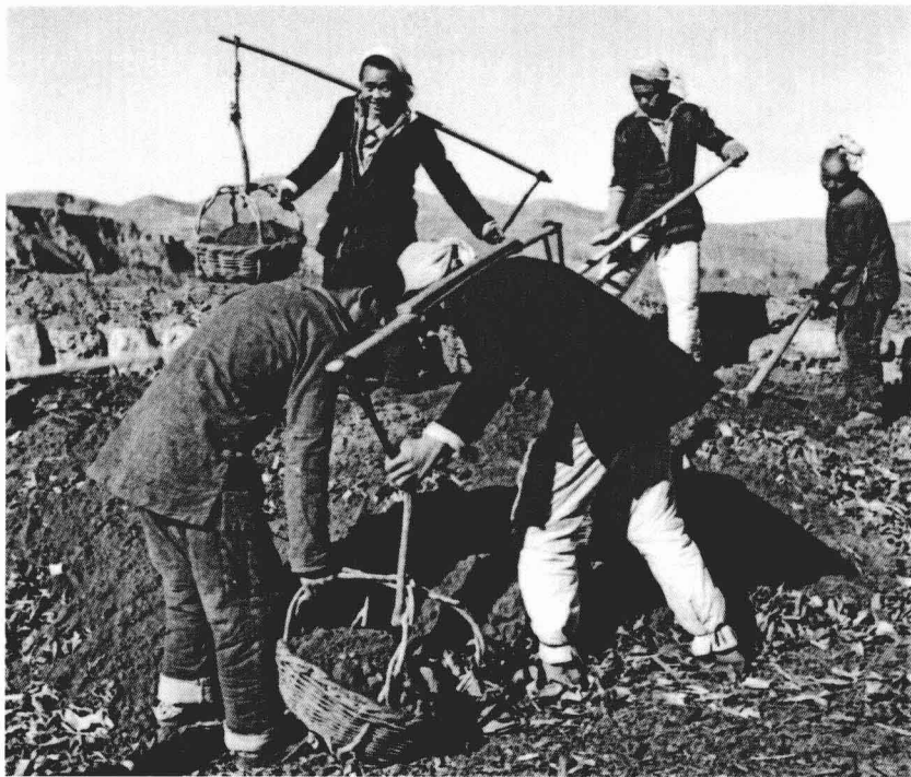
1950 · 山西潞城 集体堆肥。 1950 Lucheng, Shanxi Collecting manures.