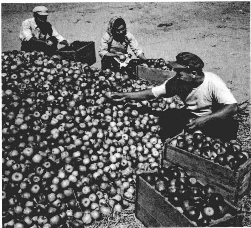
1952 · 辽宁金县 苹果装箱。