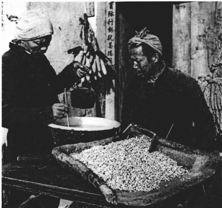
1951 · 山西平順 浸谷种。

1951 Pingshun, Shanxi Soaking corn seeds in warm water.