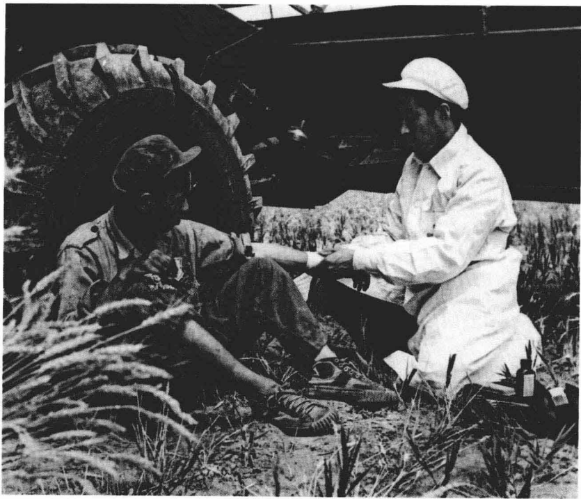
1950 · 河北衡水 卫生员田头巡诊。

1950 Hengshui, Hebei A health worker visiting the sick in the fields.