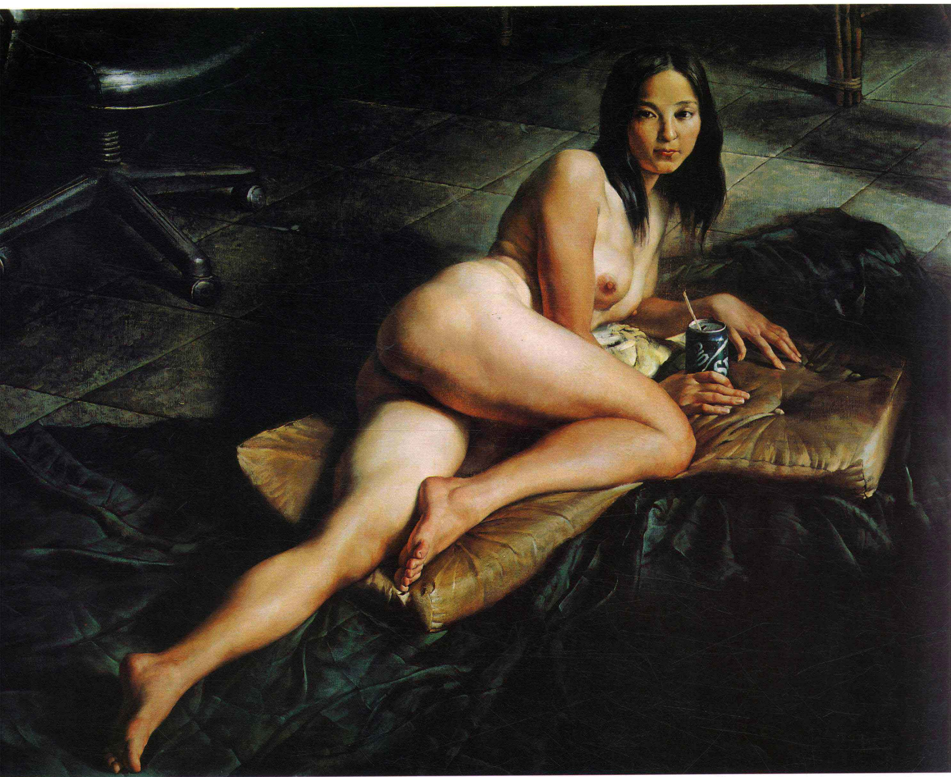
《虚幻的影子》 陈克平 122 × 96cm 1997 年 Fantastic Shadow