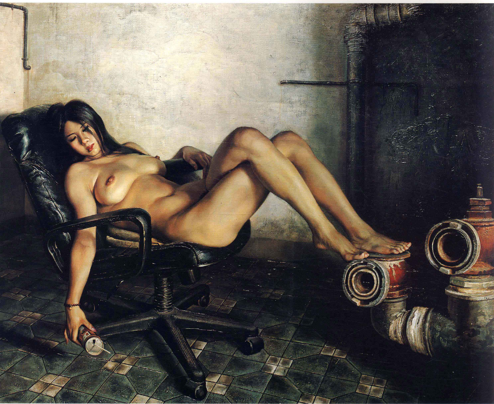
《跨越状态》 陈克平 145 × 113cm 1996 年 Beyond State