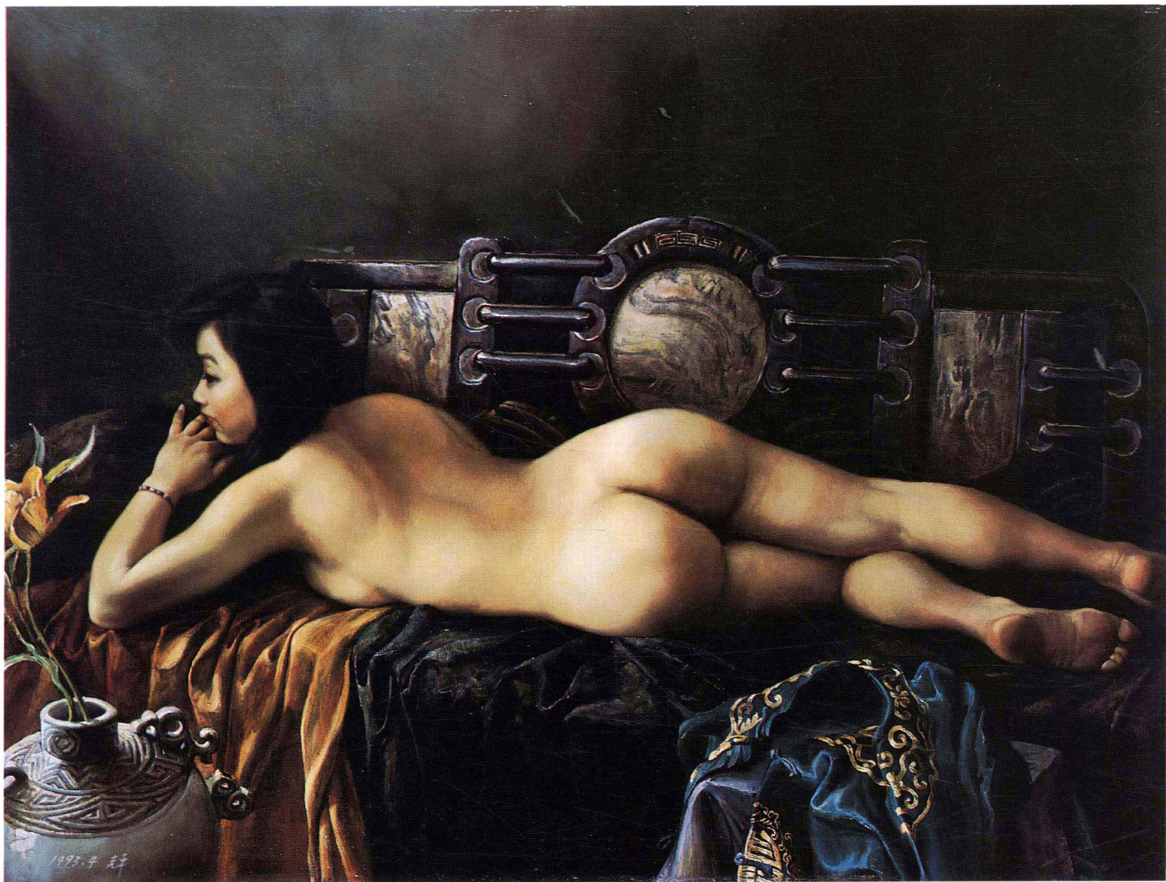
《女人·长椅 II》 陈克平 116 × 89cm 1993 年 Woman · Long Chair II