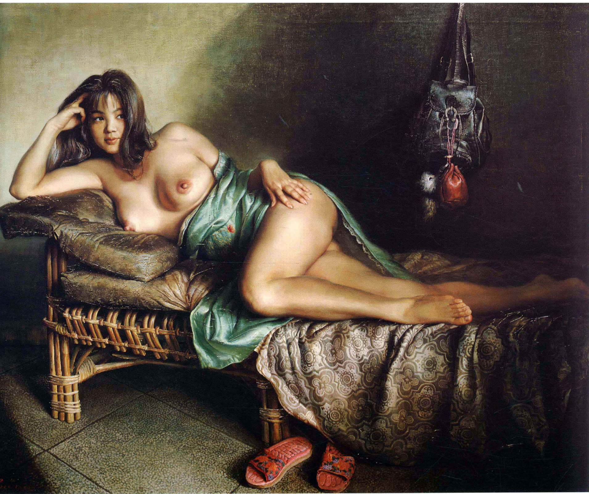
《好时光》 陈克平 145 × 113cm 1997 年 Good Time