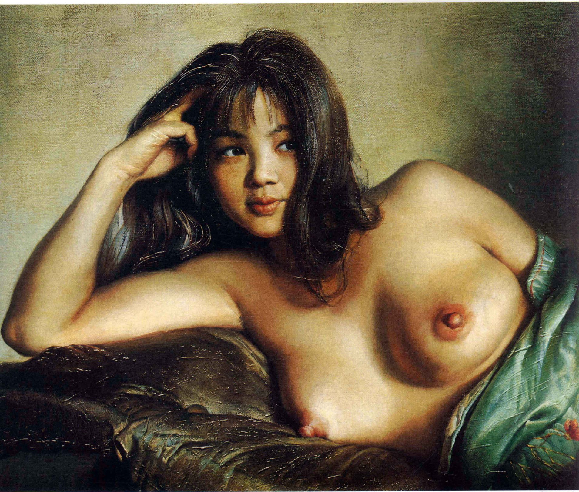
《好时光》(局部) 陈克平 Good Time(part)