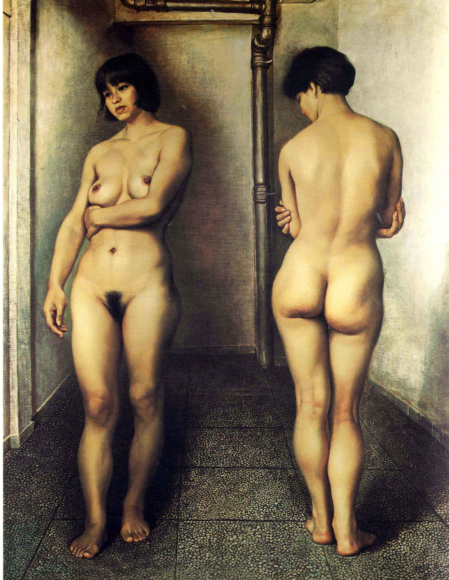
《封闭的走廊》 陈克平 130 × 97cm 1994 年 The Closed Corridor