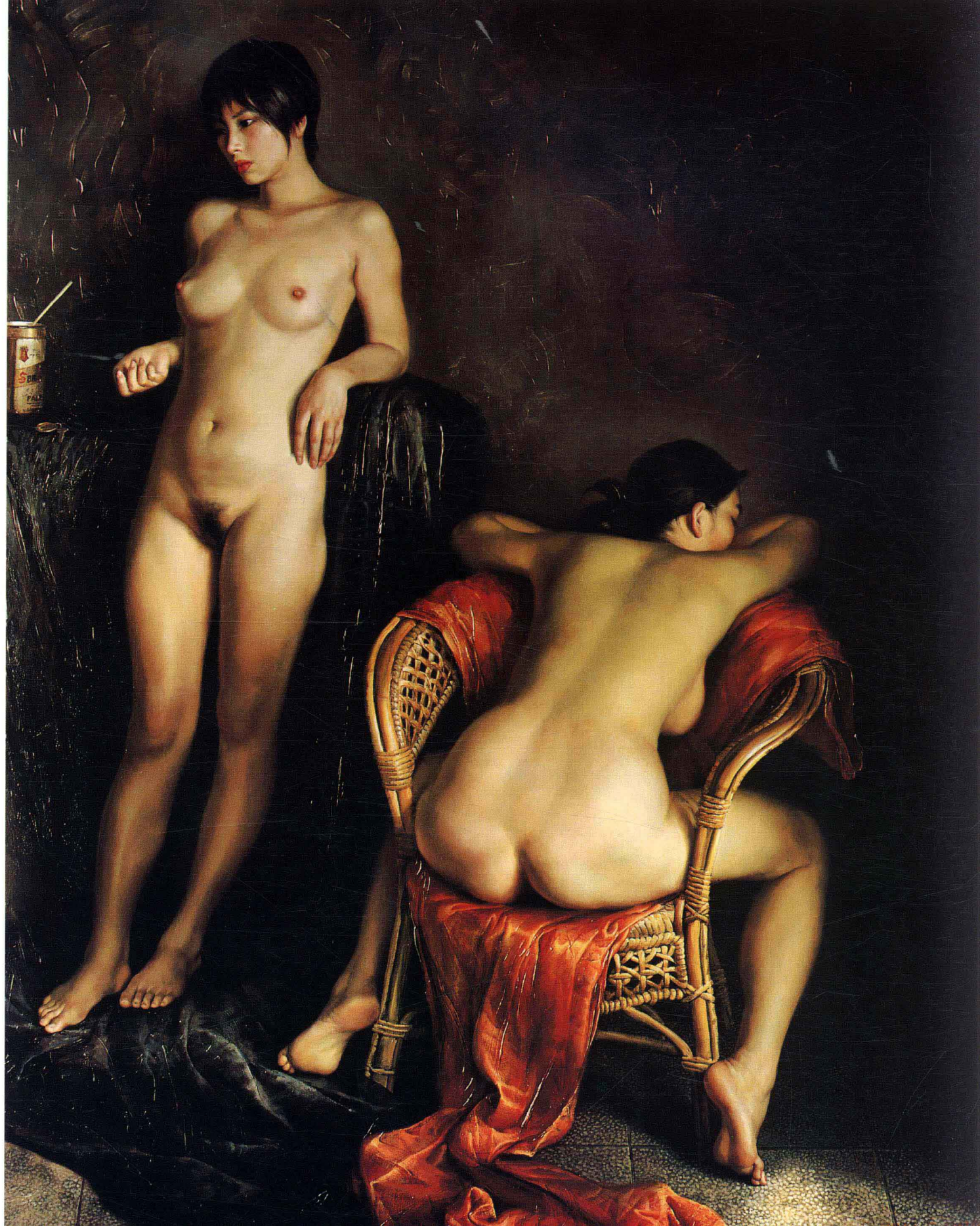
《205 工作室 I》 陈克平 145 × 113cm 1996 年 Studio NO. 205 I