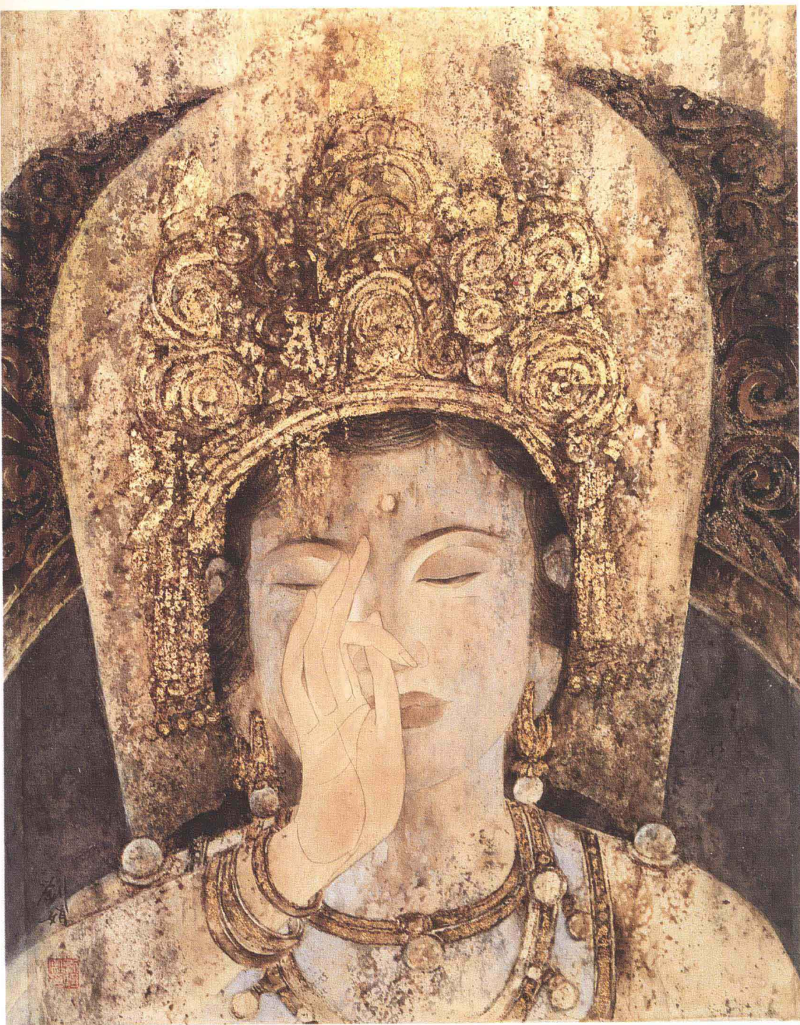
敦煌印象系列 纸本设色 66cm x 51cm 2004