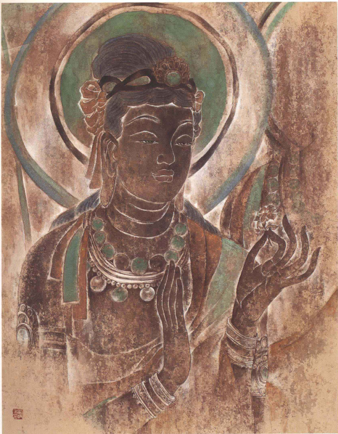
敦煌印象系列 纸本设色 70cm × 84cm 2003