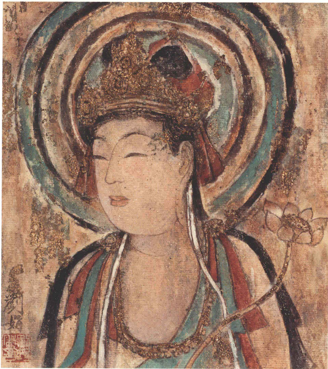
敦煌印象系列 纸本设色 24cm x 26cm 2004