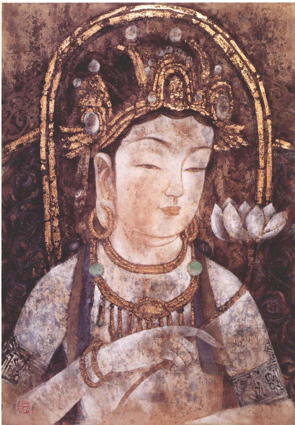
敦煌印象系列 纸本设色 66cm × 51cm 2003