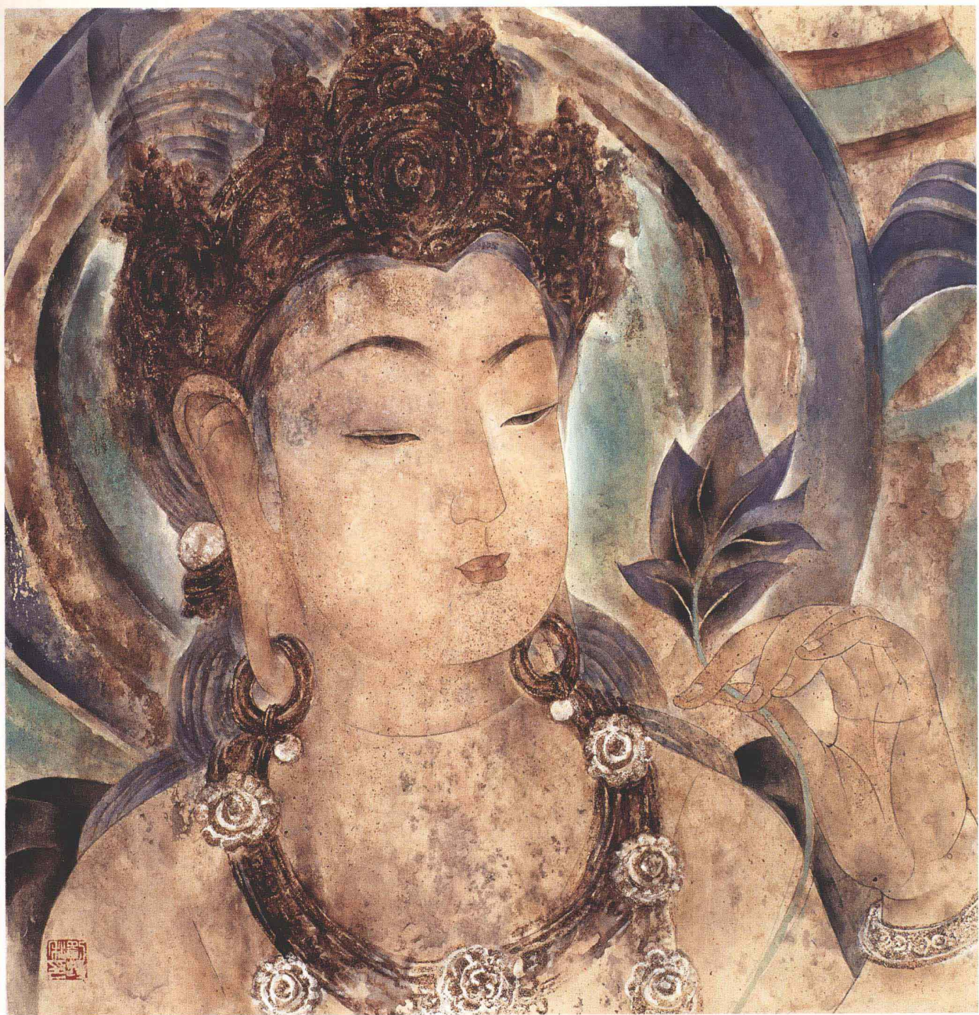
敦煌印象系列 纸本设色 48cm × 48cm 2005