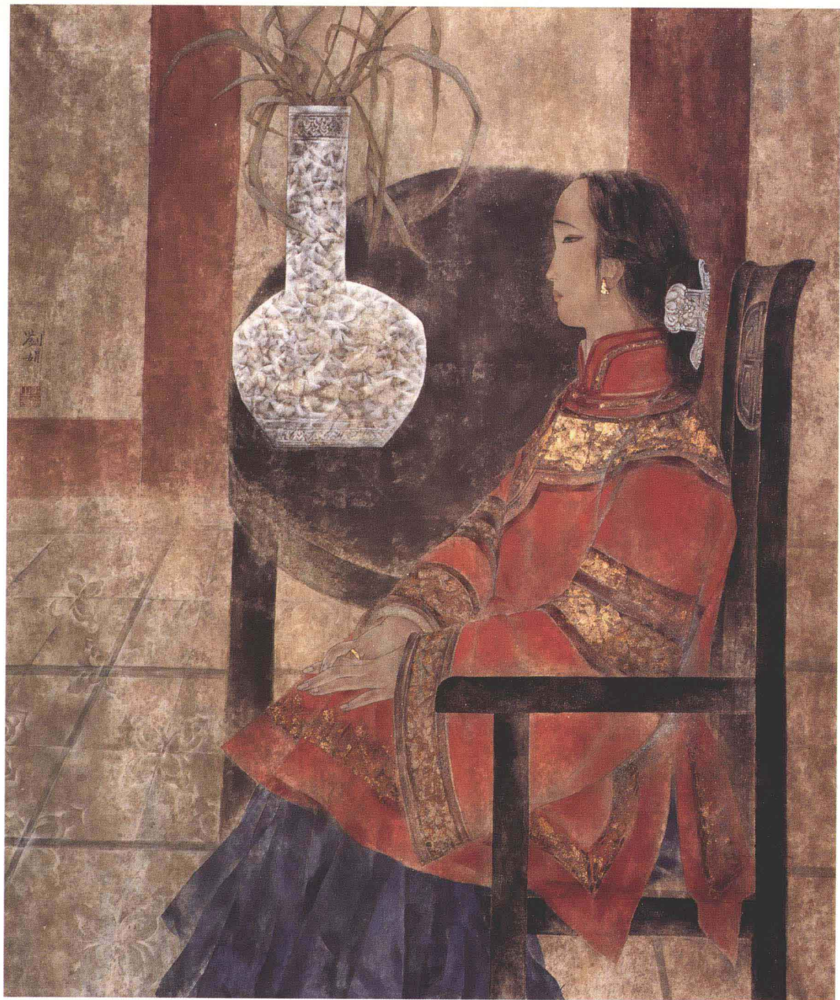
春怡庭阁 纸本设色 110cm x 94cm 2004