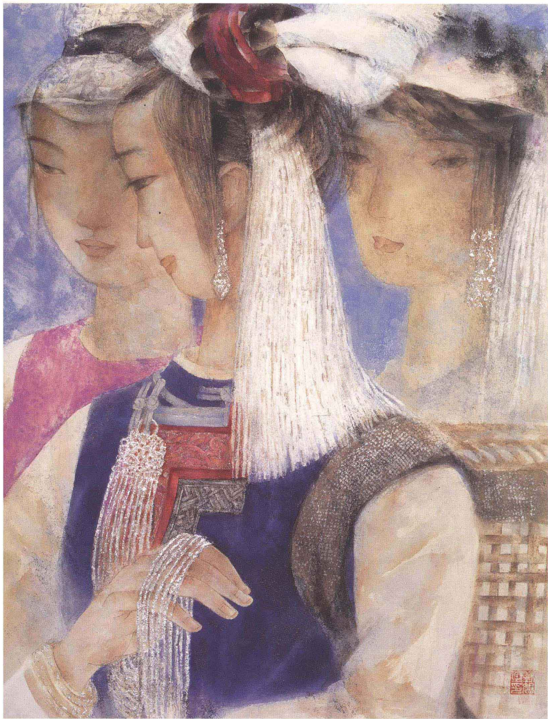
三月三 纸本设色 66cm × 51cm 2002