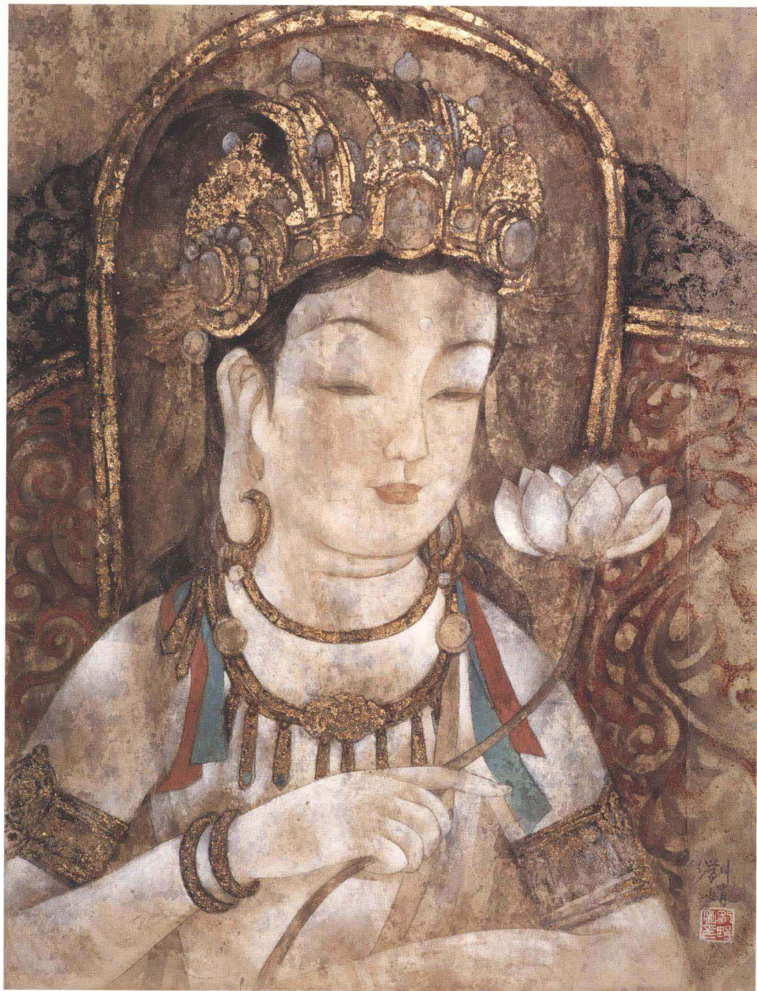
敦煌印象系列 纸本设色 66cm × 51cm 2003