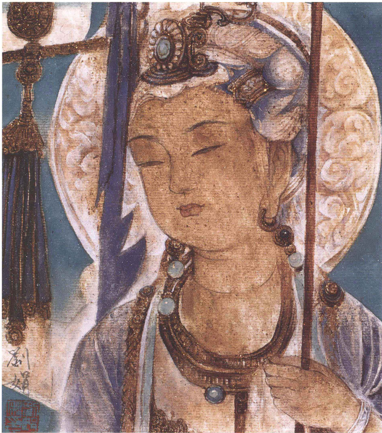
敦煌印象系列 纸本设色 24cm x 26cm 2005