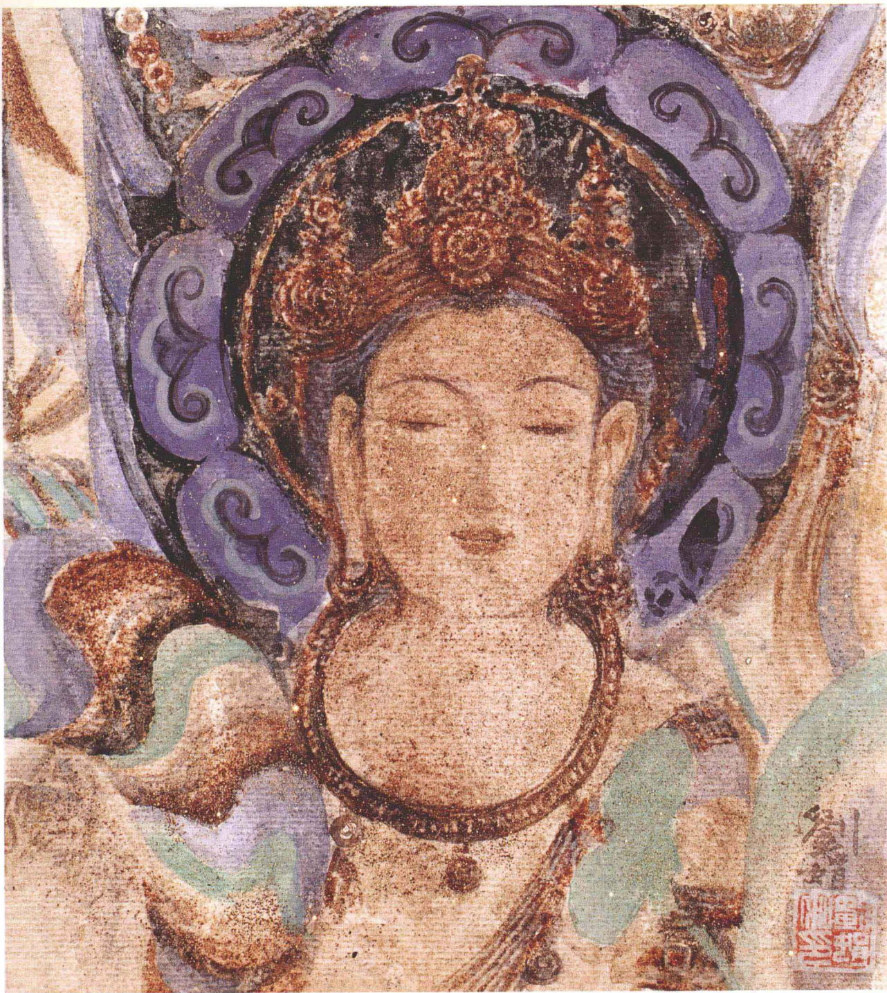
敦煌印象系列 纸本设色 24cm × 26cm 2004