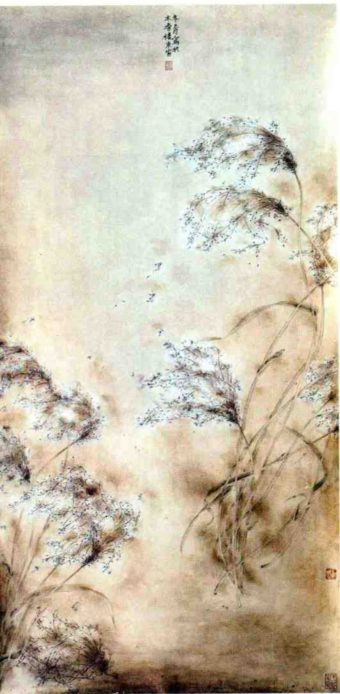
白衣 紙本設色 136cm × 69cm 2004