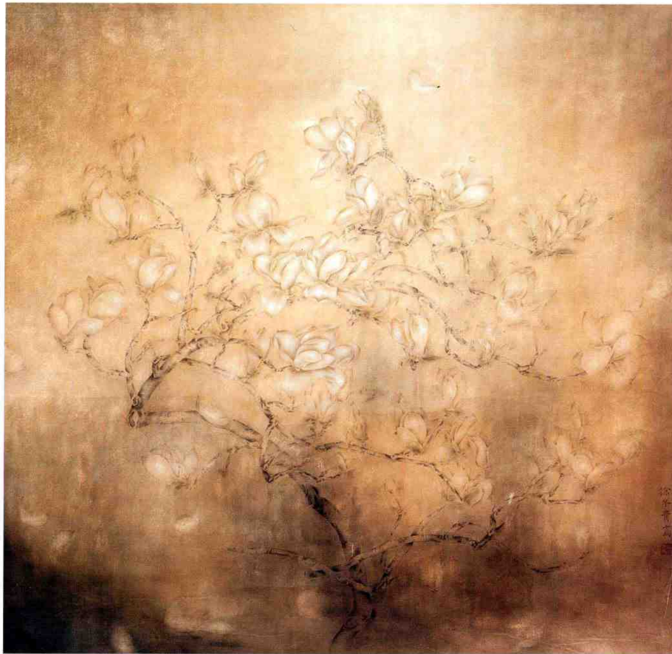
玉宇澄明 纸本设色 145cm × 145cm 2005