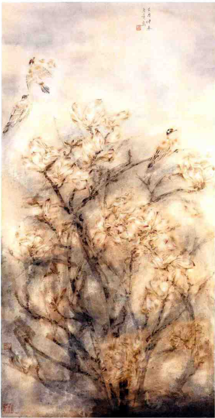
四月之光 纸本设色 136cm x 69cm 2005