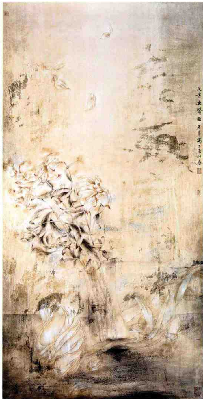
反舌无声图 纸本设色 136cm × 58cm 2005