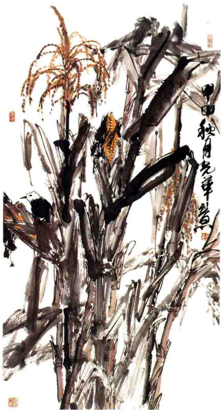
老玉米 纸本设色 183cm×35cm 2003