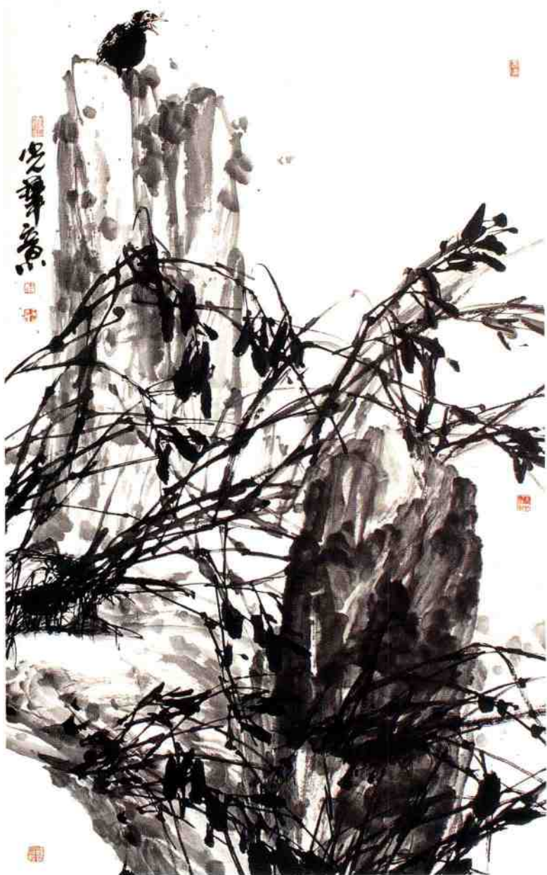
春 晓 纸本水墨 183cm x 95cm 2003