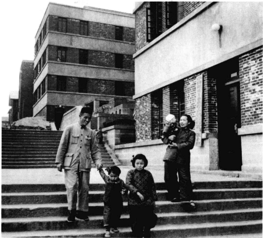
1953 · 重庆 散步的一家人。 1953 Chongqing A family taking a walk.