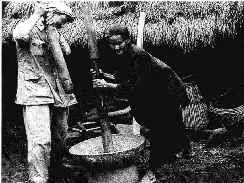
1950 · 海南 舂米。 1950 Hainan Pounding rice.