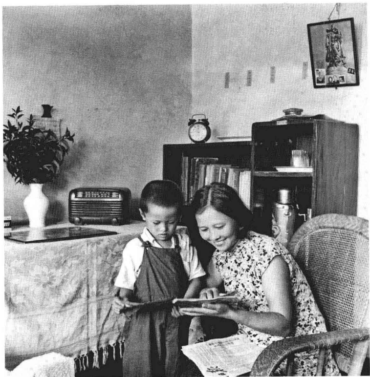
1952 · 湖南株洲 帮助孩子温习功课。 1952 Zhuzhou, Hunan Helping children reviewing lessons.