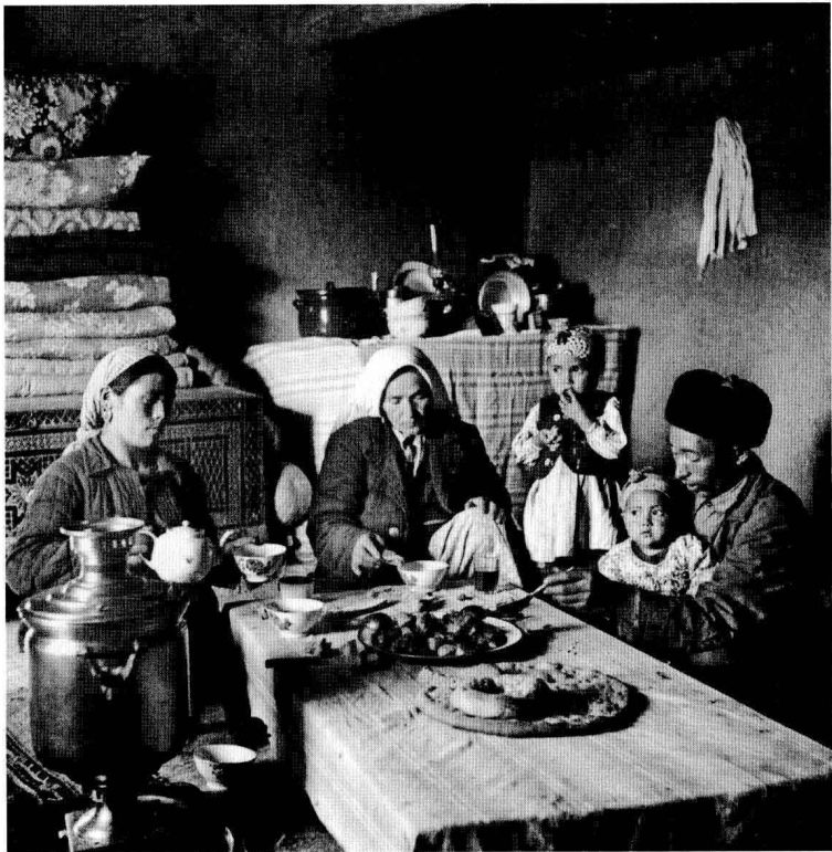
1953 · 新疆巩留 哈萨克牧民进餐。 1953 Gongliu, Xinjiang Kazakh herders dining.