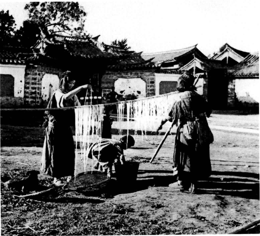
1951 · 云南丽江 纳西妇女做米线。 1951 Lijiang, Yunnan Naxi women making rice noodles.