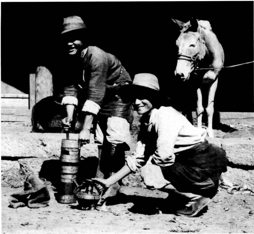
1951 · 云南迪庆 打酥油茶。 1951 Diqing, Yunnan Beating up butter tea.