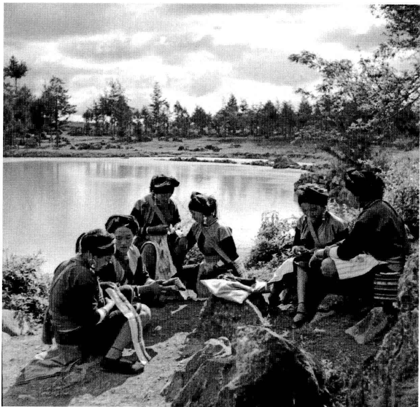
1953 · 云南弥勒 彝族妇女缝制过节新衣。 1953 Mile, Yunnan Yi women sewing festive clothes.