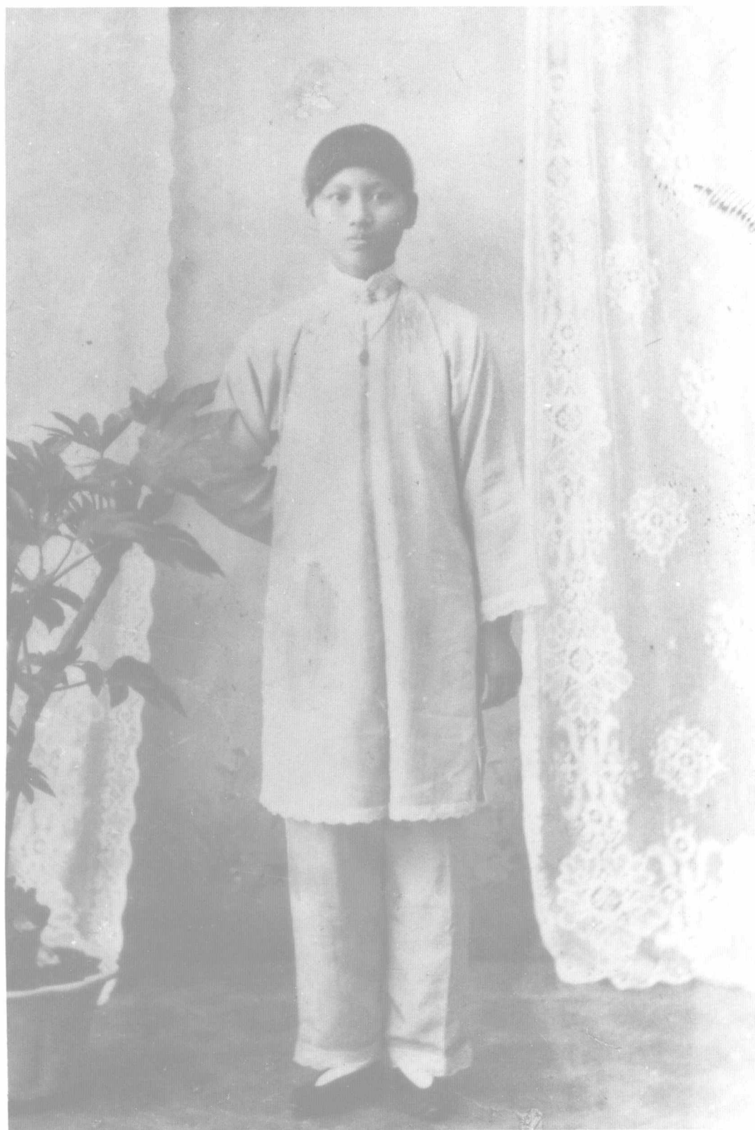
1 少年時期的宋慶齡 Soong Ching Ling in her girlhood.