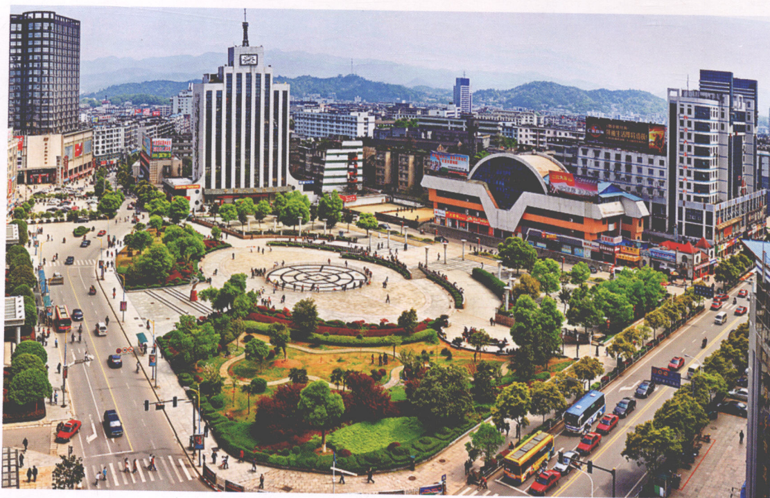
改造前的绿茵广场 Green Grass Square before Reconstruction 周锦晖