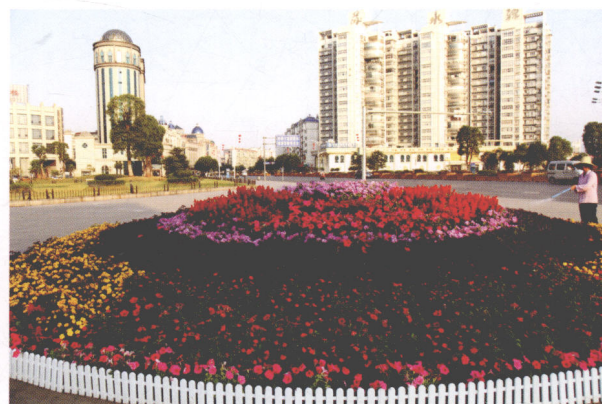
秋收起义广场 Autumn Harvest Uprising Square 李晓萍