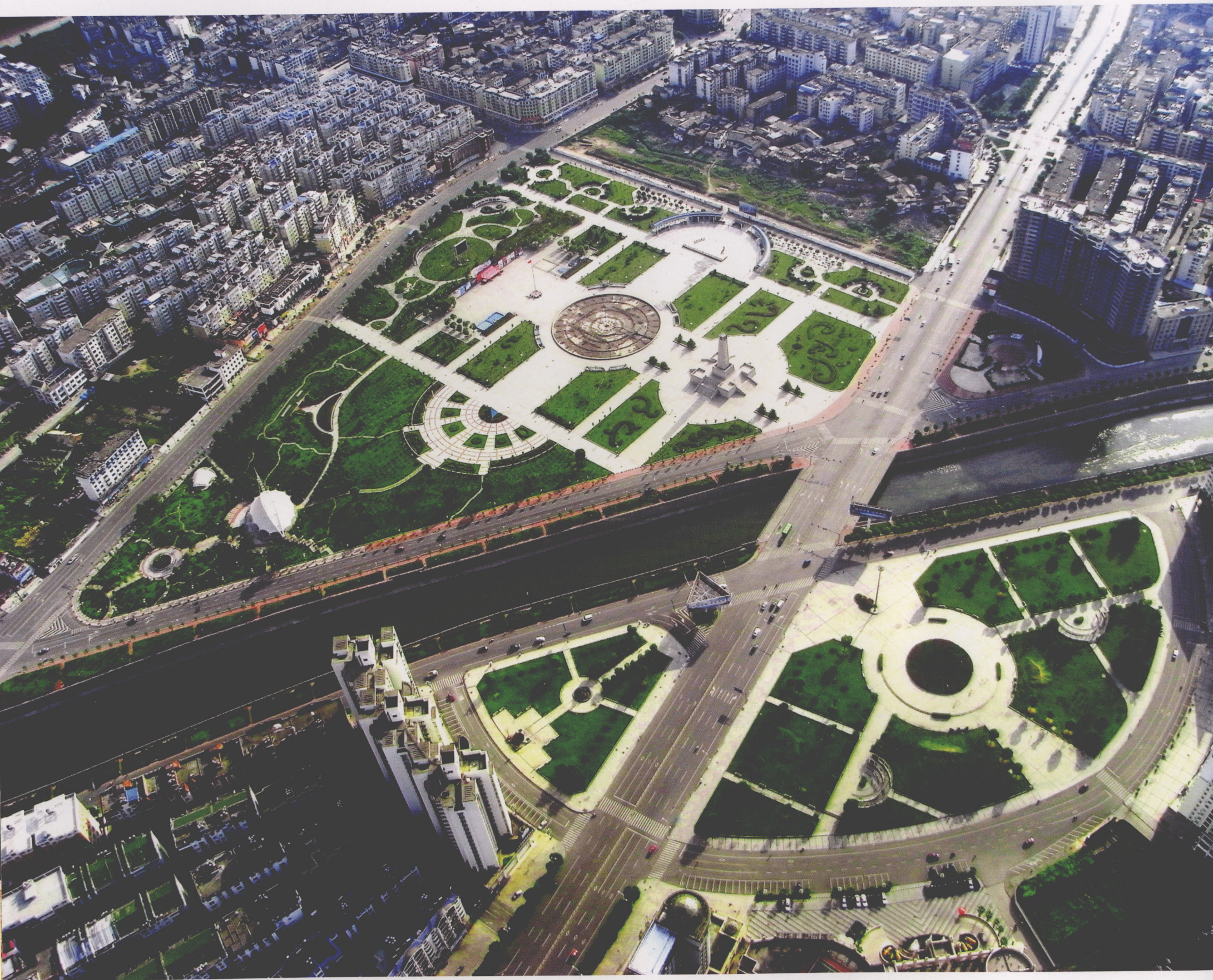
秋收起义广场航拍图 Aerial Photograph of Autumn Harvest Uprising Square