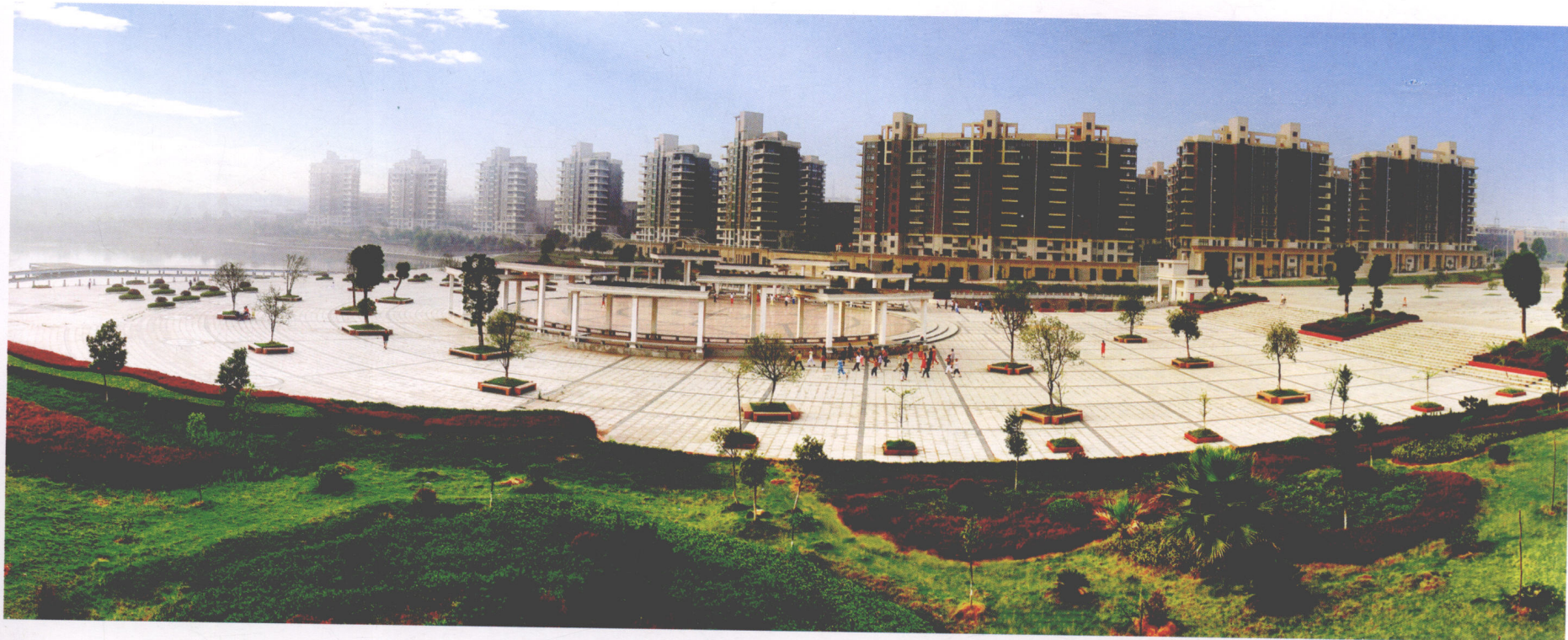
玉湖广场 Yuhu Lake Square 周锦晖