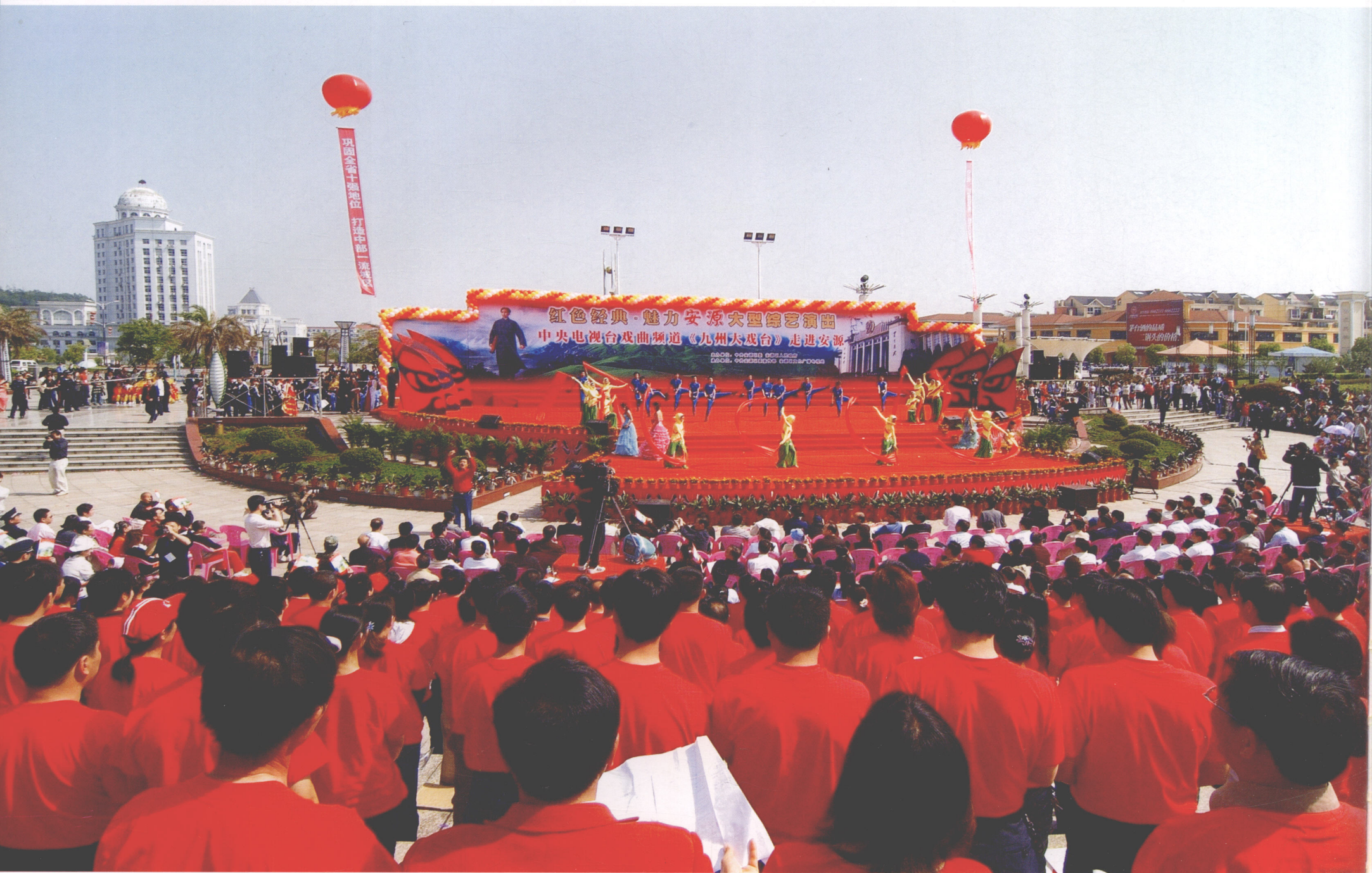
安源世纪广场 Anyuan Century Square 文飞翔