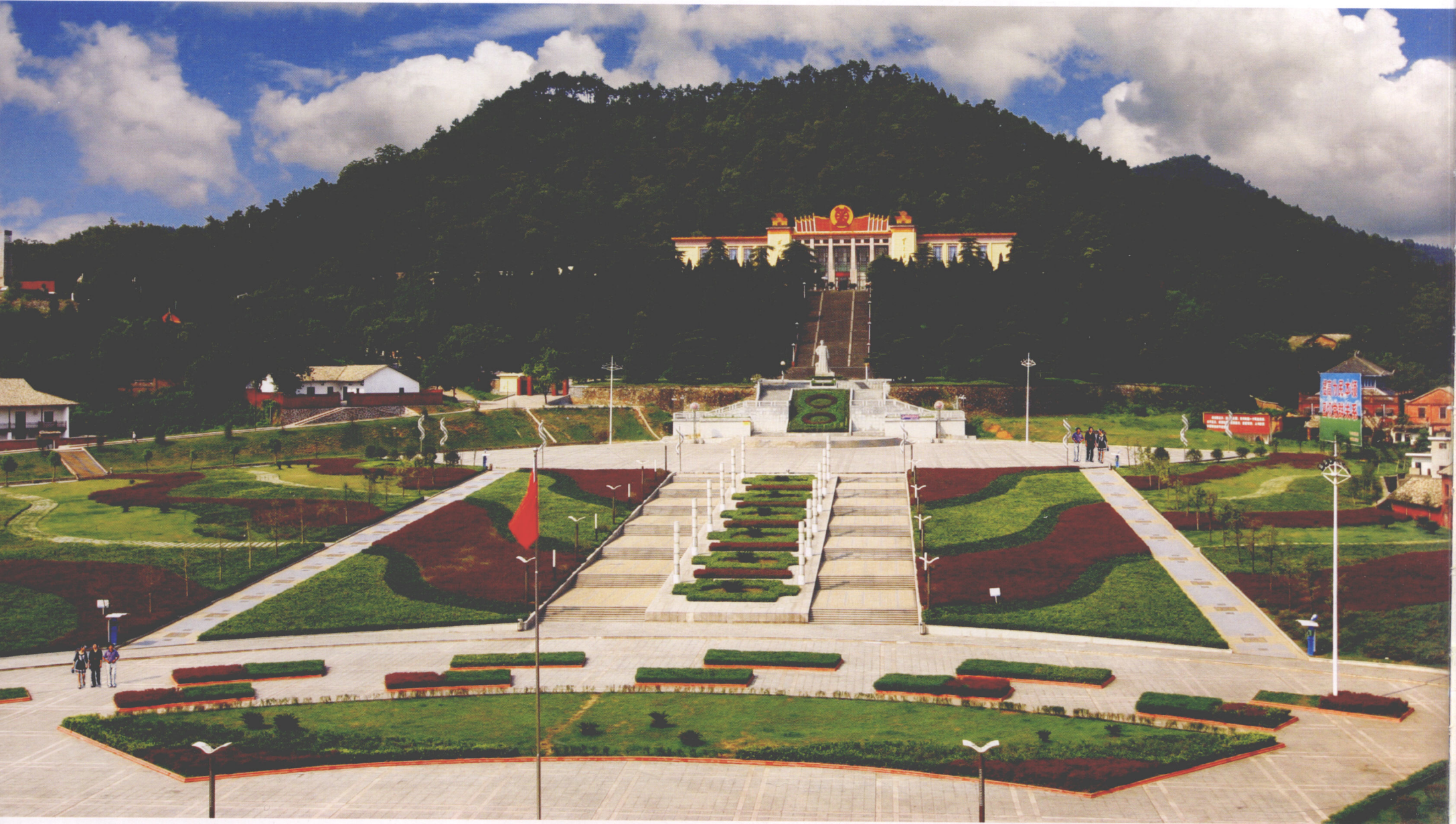
安源胜利广场 Anyuan Victory Square