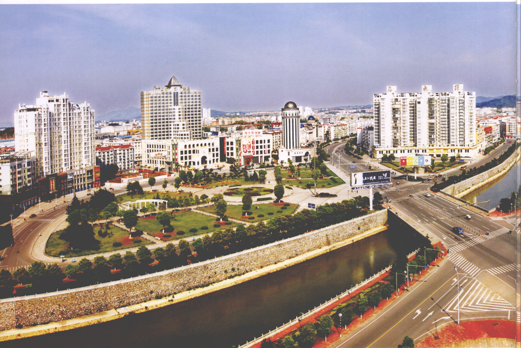
秋收起义广场 Autumn Harvest Uprising Square

今天的萍乡儿女，将现代雄壮的广场打造成群众文化的崭新舞台，广场文化活力勃发，成为城市的新景观、精神文明的新亮点。