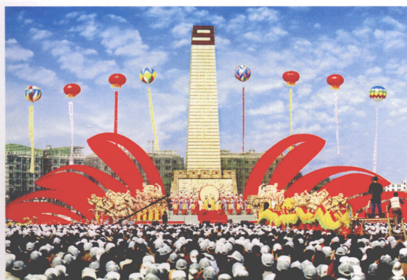
心连心艺术团演出现场 Heart-to-heart Troupe Performing in Pingxiang 臧秀德