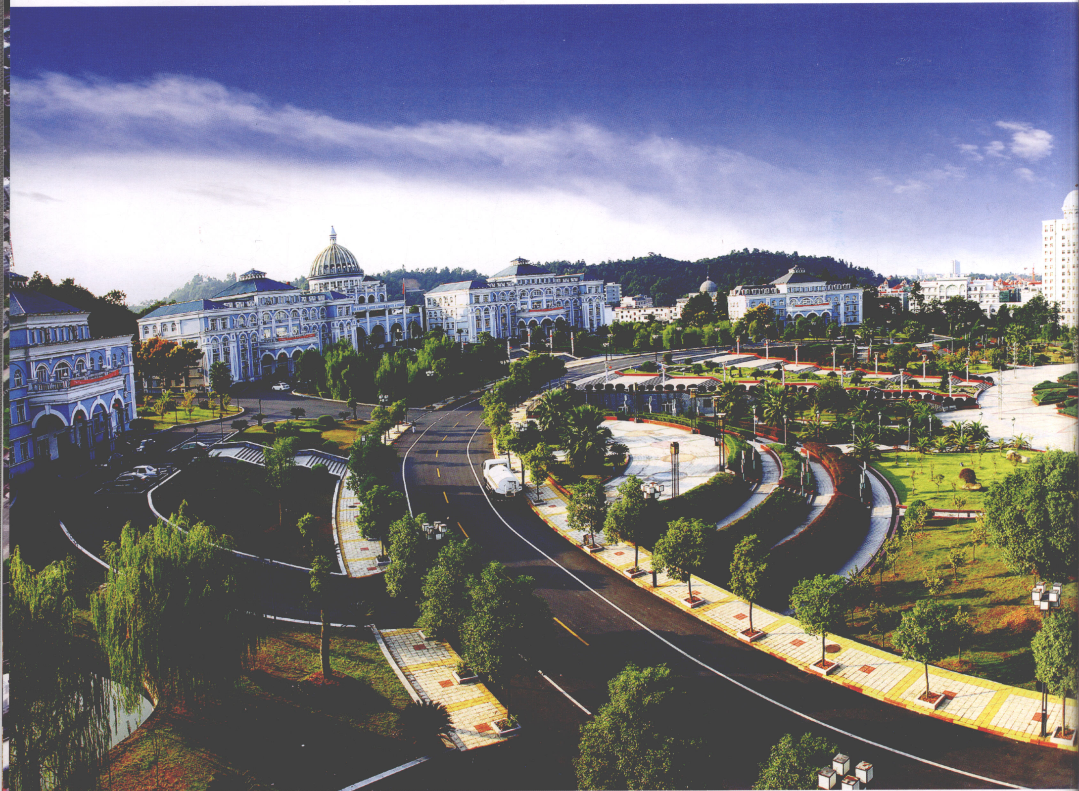
安源世纪广场 Anyuan Century Square 李桂东