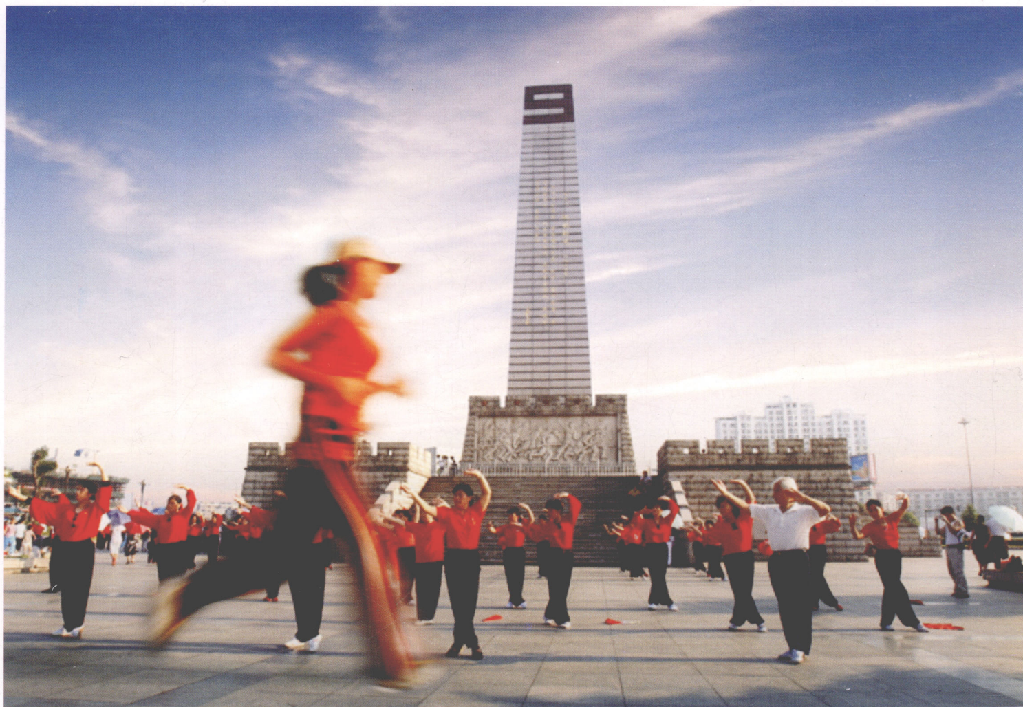
秋收起义广场 Autumn Harvest Uprising Square 彭学平