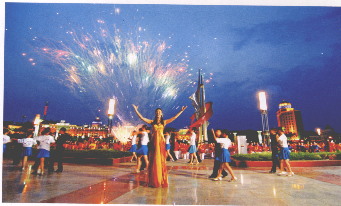
安源世纪广场 Anyuan Century Square 周锦晖