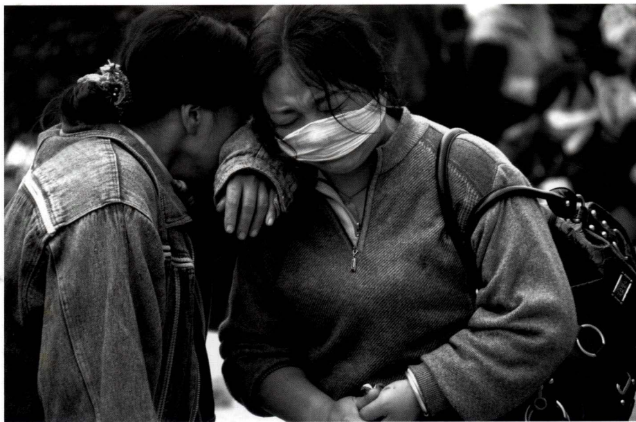
两名在地震中失去孩子的母亲相依而泣。 Two mothers hugged and cried for their dead kids.