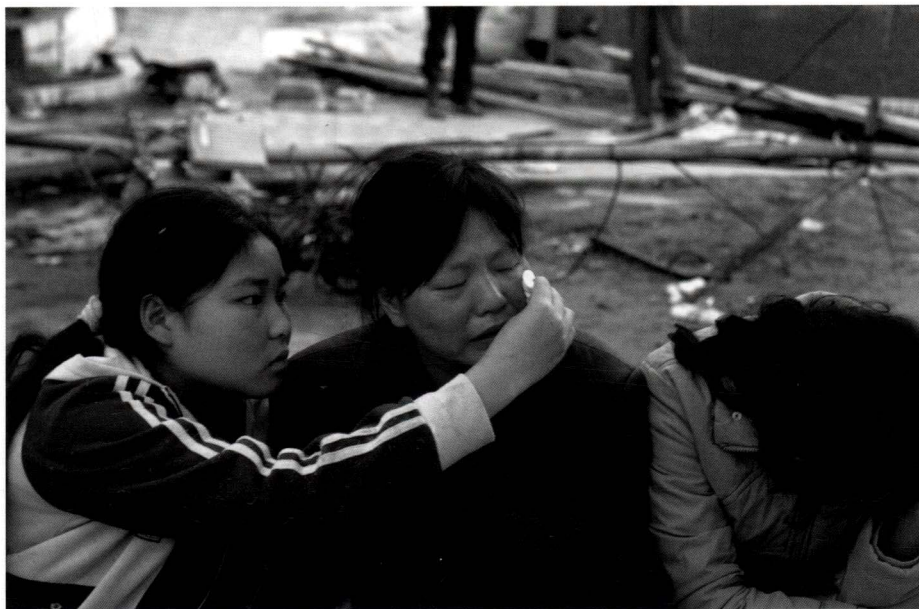
妈妈，别难过！失去弟弟的这名中学生在地震中显得特别坚强。 Mother, do not cry! A student looked more strongly, after his younger brother was dead.