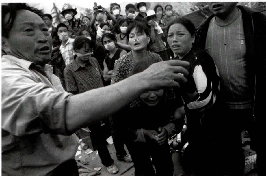
映透镇中心小学是这次汶川大地震中伤亡最为惨重的地方，校长和家长在学校操场上焦急等待救援人员到来。 The school master of Ying Xiu Center Primary School was waiting for the rescue team with the parents.