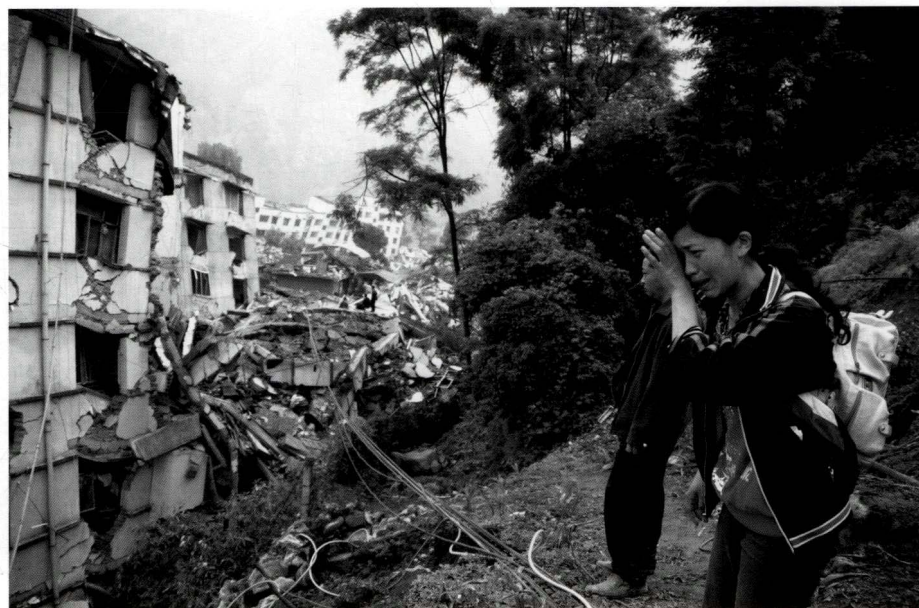
汶川大地震使映秀镇几乎所有的家庭都遭受了灭顶之灾。 All most homes were ruined in this earthquake.