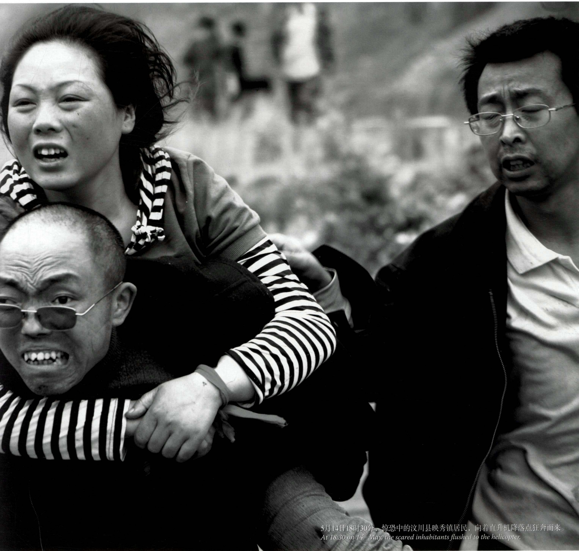
5月14日18时30分，惊恐中的汶川县映秀镇居民，向着直升机降落点狂奔而来。 At 18:30 on 14 th May, the scared inhabitants flushed to the helicopter.