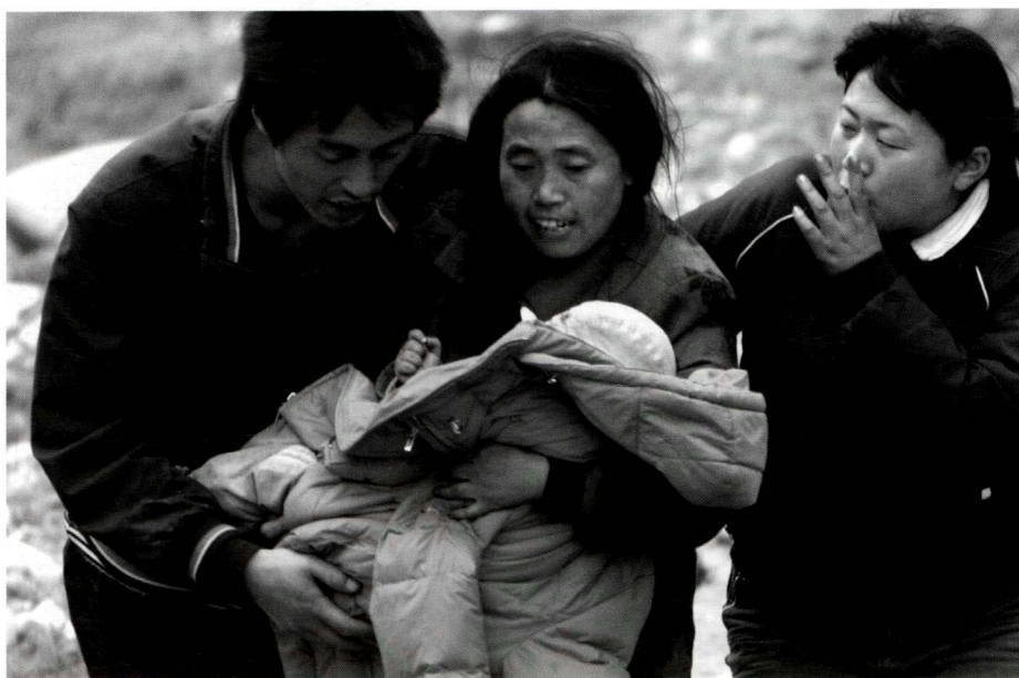
地震中幸存的一家人，在奔跑中小心呵护襁褓中的婴儿。 A survived family was in run of protecting the baby carefully.