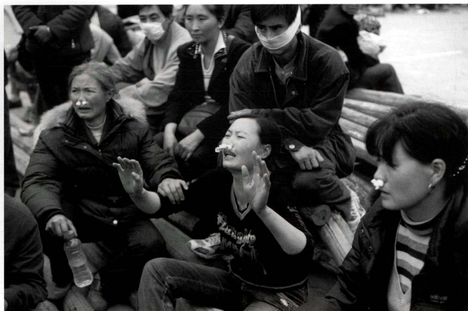
失去亲人、失去家园，妇女们脆弱的心灵遭受了巨大的伤痛。 Most women got hurt deadly in this earthquake for losing their lovers and homes.