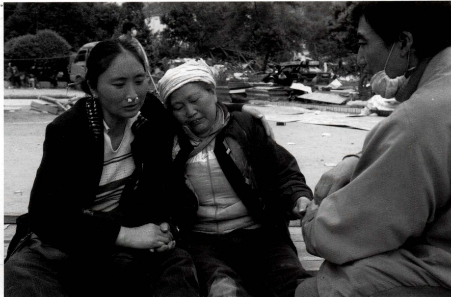
失去亲人使这对羌族母女失去了家庭支柱。 The Qiang Folk mother and daughter lost the family backbone.