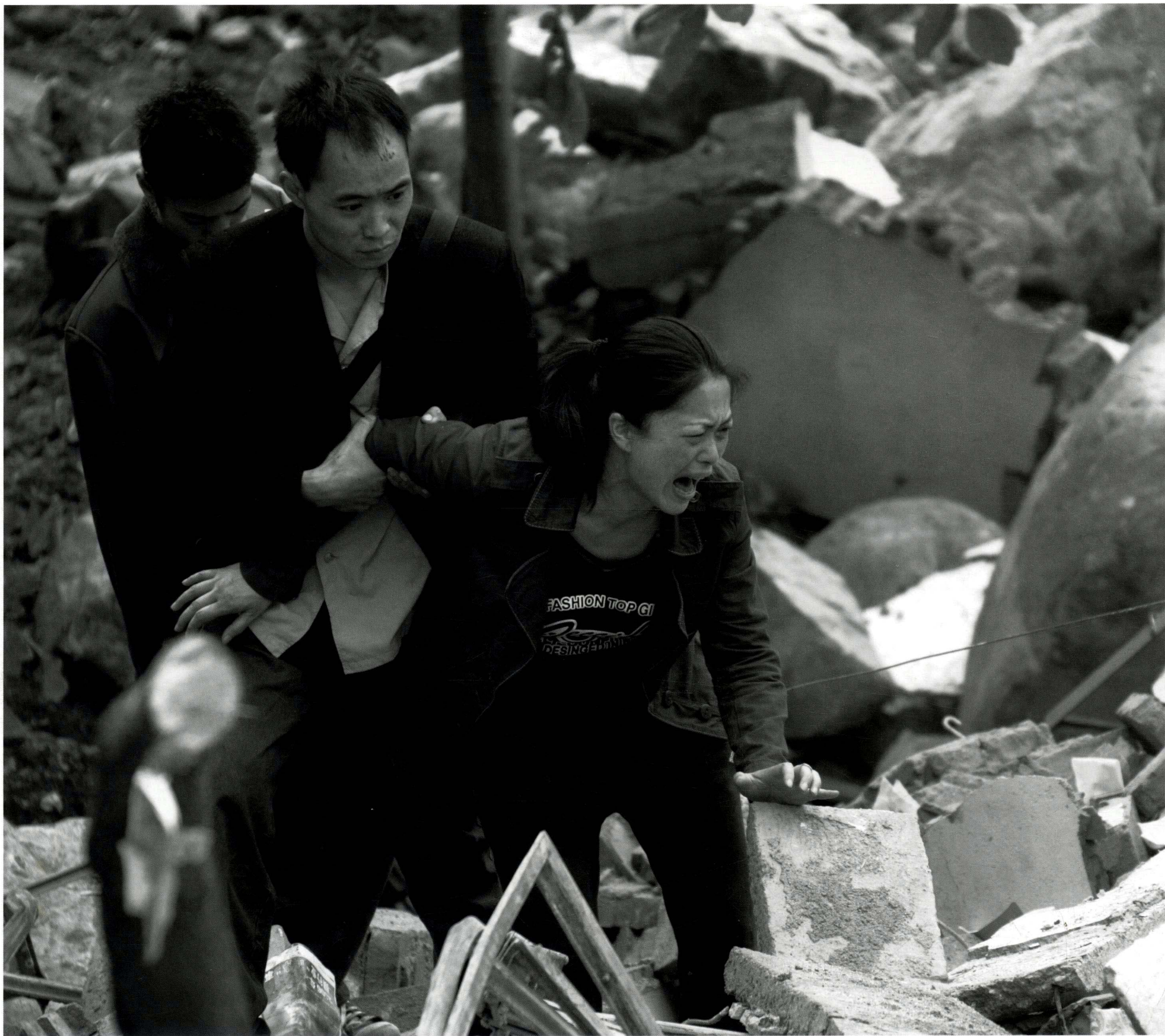
映秀镇电信局7层住宿楼震塌，职工家属在废墟中呼唤亲人。 The officer's relatives from the Yingxiu Telephone Bureau called out each other in the ruins.