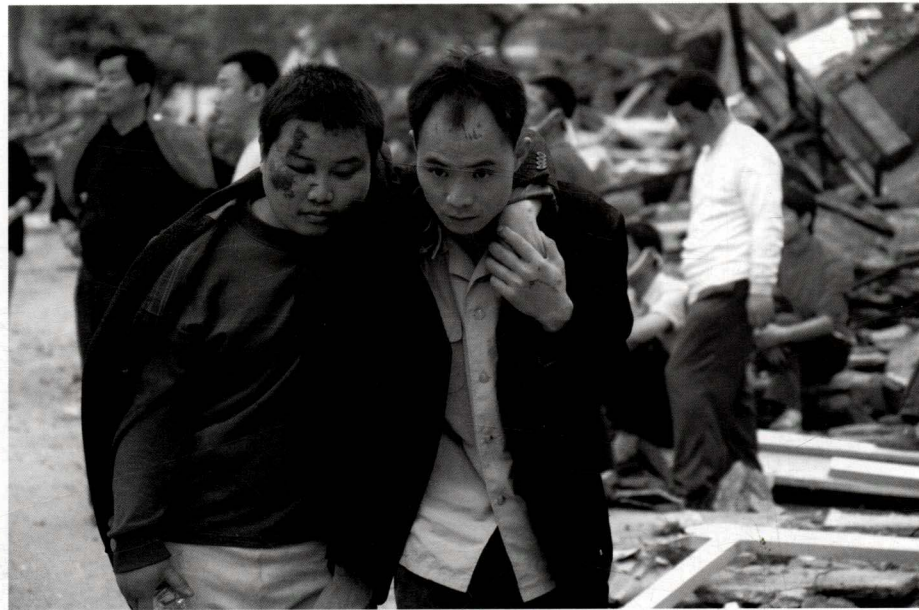
泪已干，哥哥搀扶着弟弟向前走去。 The brothers kept walking together.