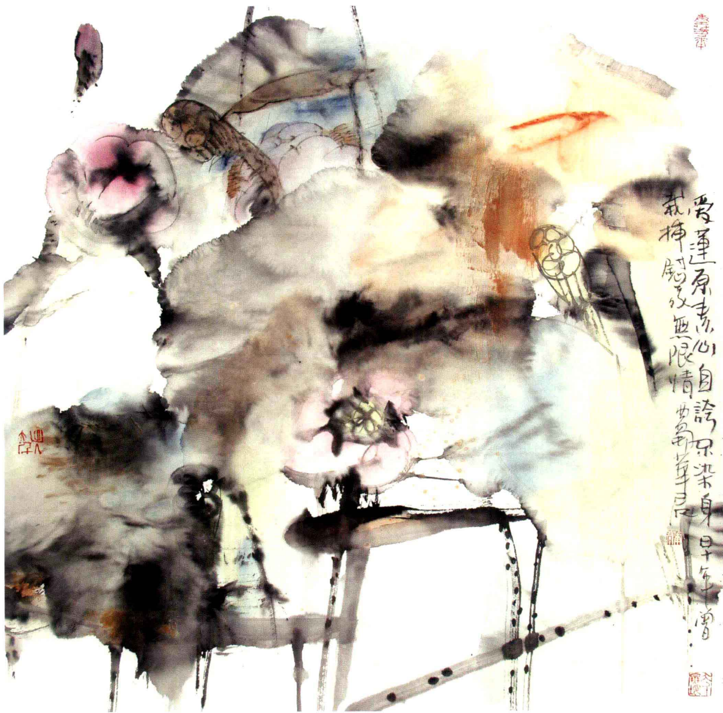
素心爱莲图 纸本设色 68cm x 68cm 2004