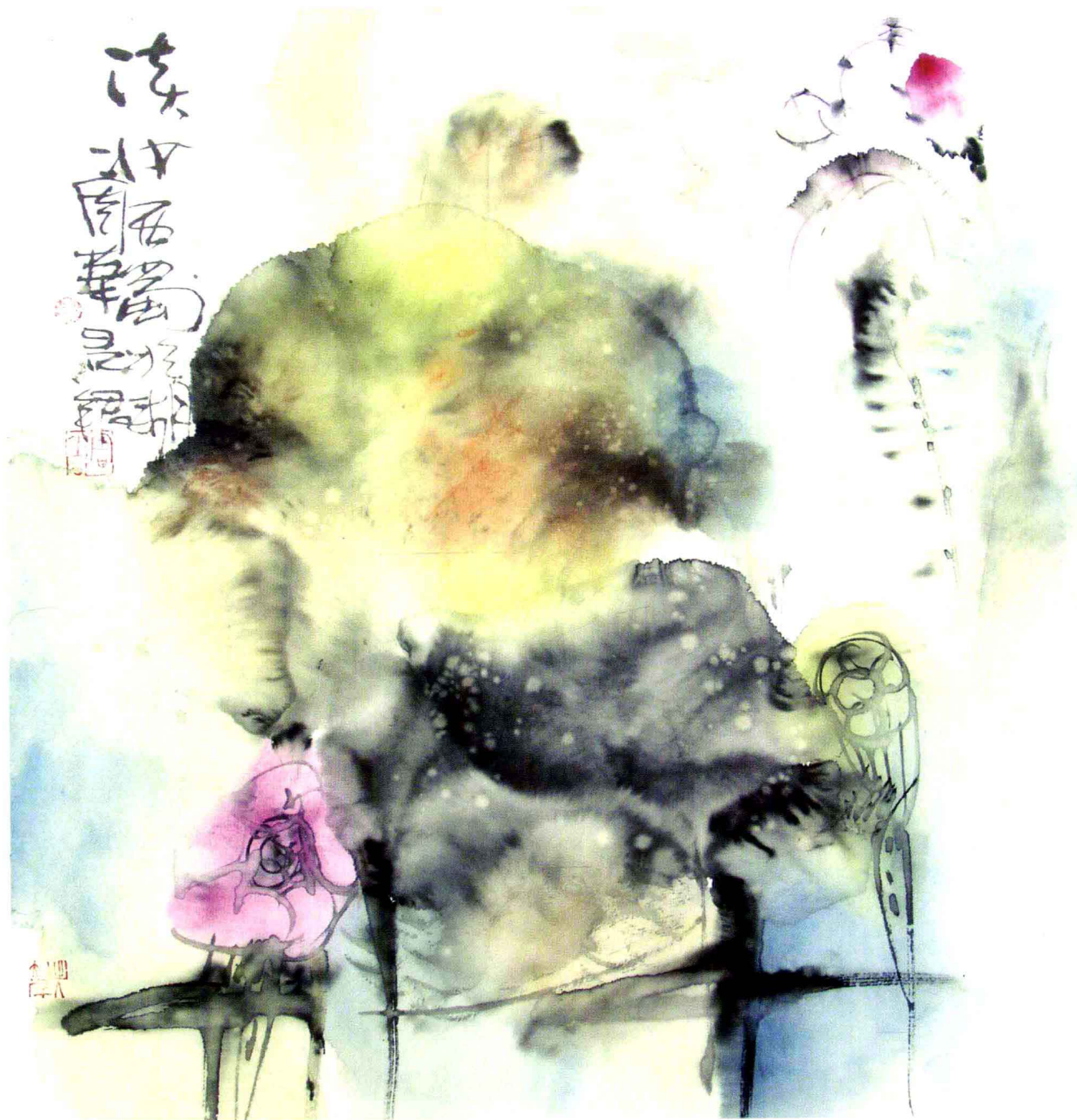
淡雅君子风 纸本设色 98cm × 63cm 1996