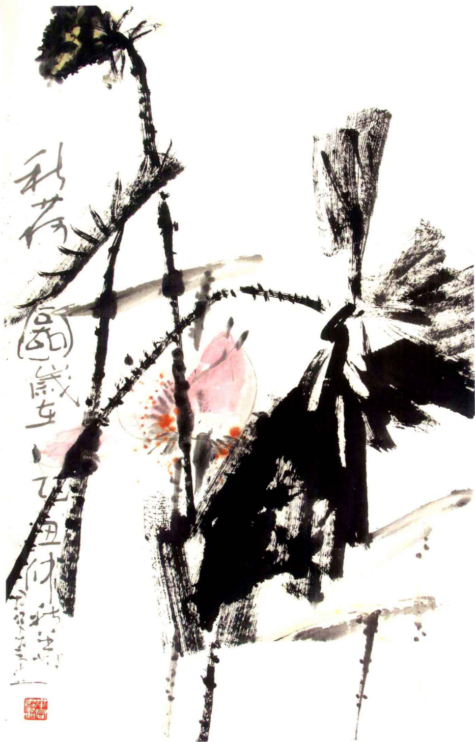
秋荷花 纸本设色 96cm x 63cm 2005