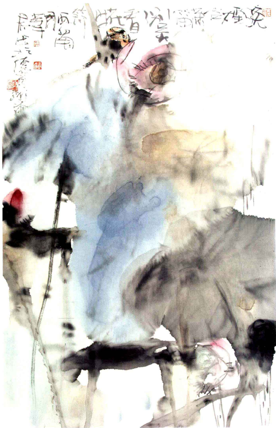
晚烟含箫笛 别误了赏花时节 纸本设色 96cm × 63cm 1995