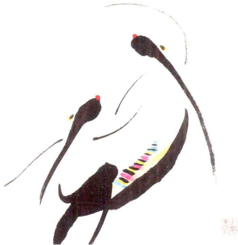
藏舞 Tibet dance 34 cm x 34 cm 纸本 Paper 2003