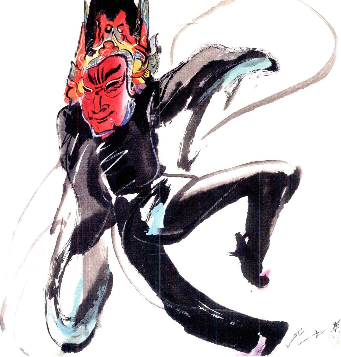
傩舞 (中国面具舞) Nuo mask opera — driving away the plague 68 cm x 68 cm 纸本 Paper 2004