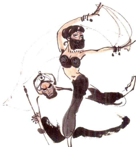
一千零一夜 Thousand nights and one night 29 cm x 29 cm 纸本 Paper 2003