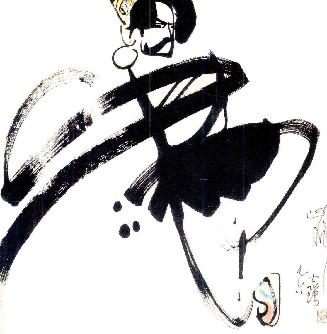
藏族汉子 Tibet man 68 cm x 68 cm 纸本 Paper 1996