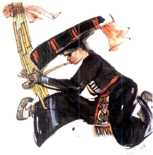
青年乐手 Young bandsman 68 cm x 68 cm 纸本 Paper 2004