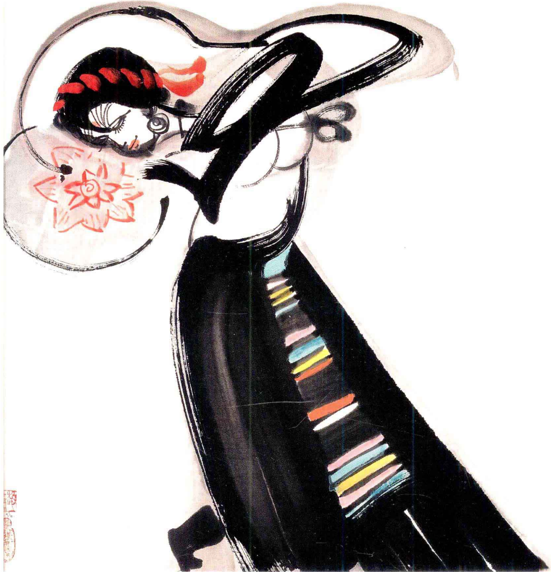
太平鼓 Taiping drum 68 cm x 68 cm 纸本 Paper 1996