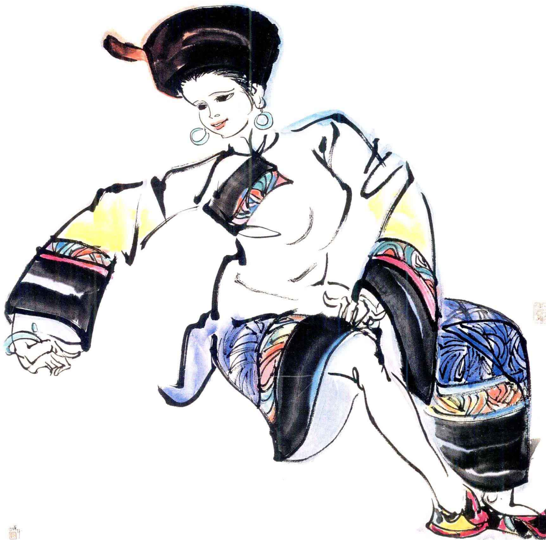
织 Twine 68 cm x 68 cm 纸本 Paper 1997