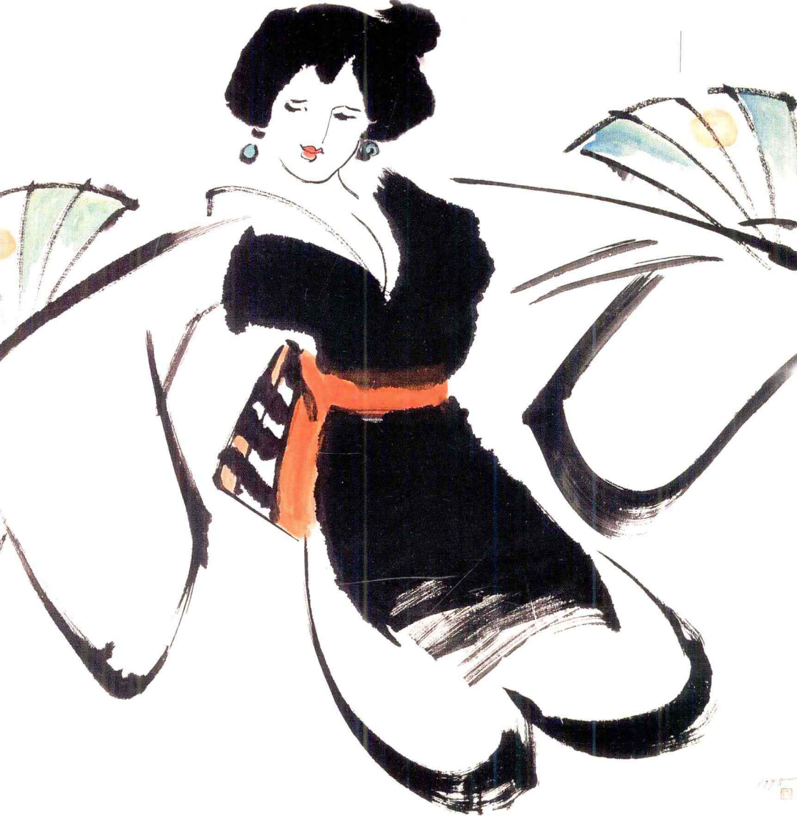
日本扇舞 Japanese fan dance 68 cm x 68 cm 纸本 Paper 1995