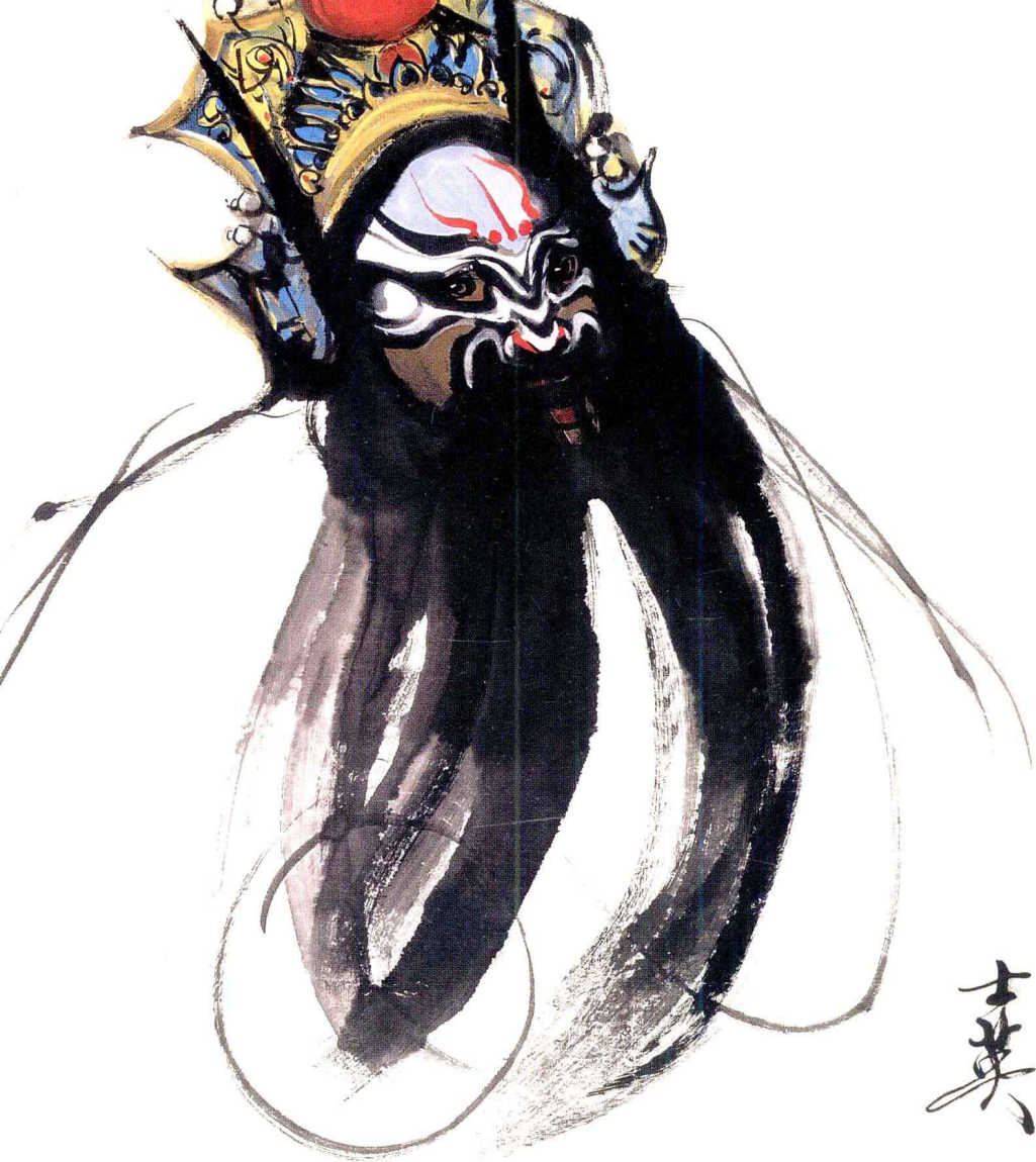
花脸 Martial role in Chinese operas 110 cm x 90 cm 纸本 Paper 1987