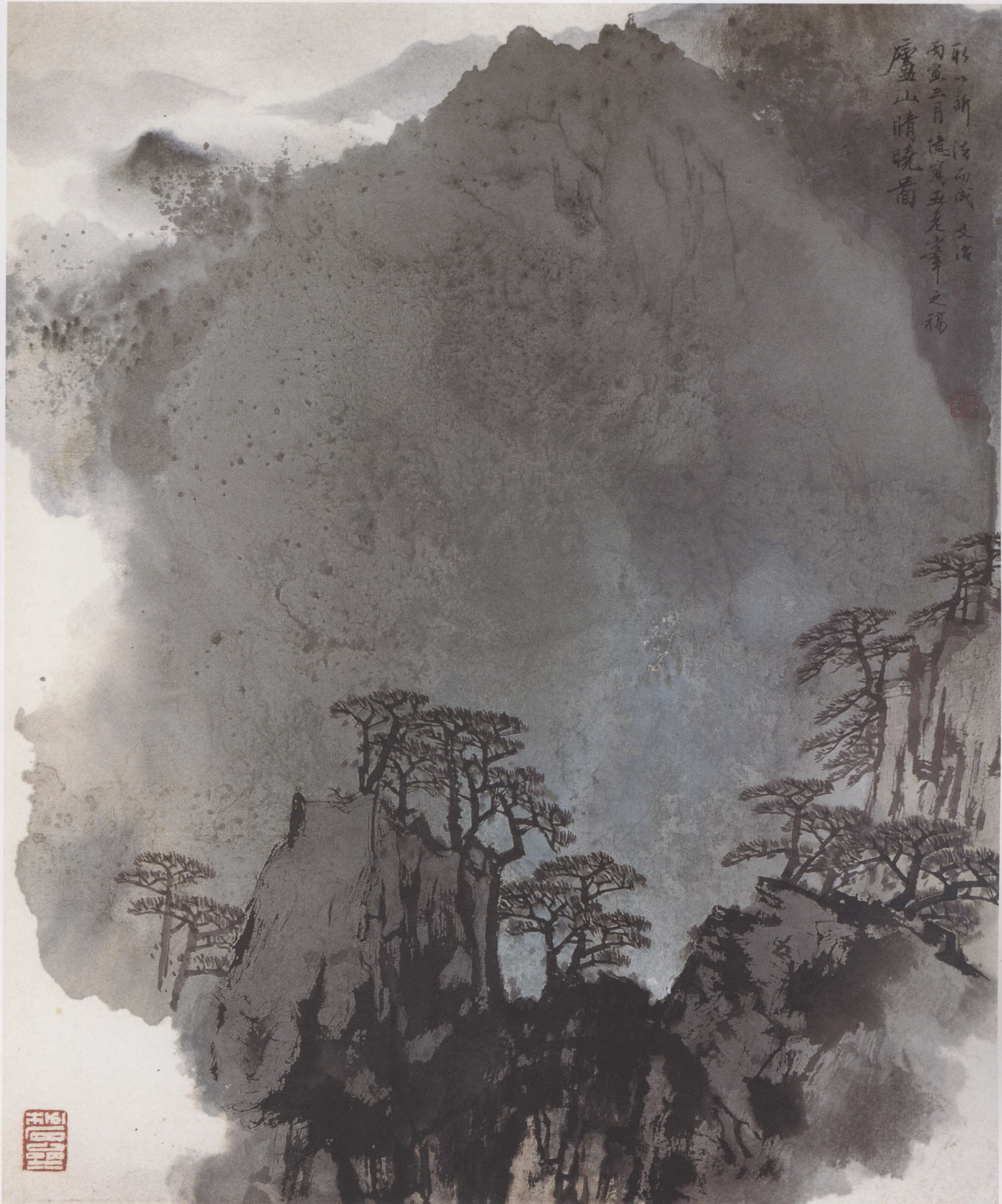
Sunny Morning on Mt. Lu 廬山晴曉圖