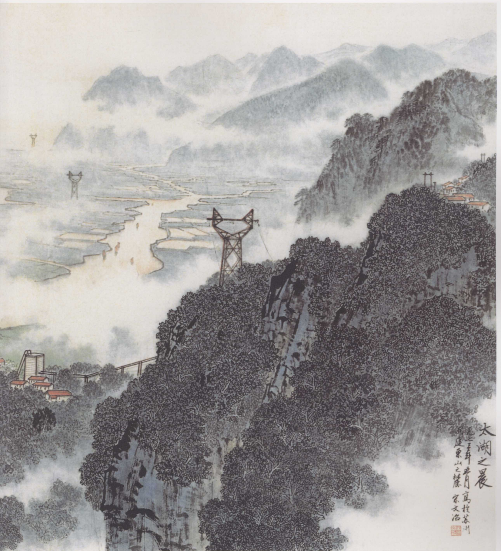
Morning at Lake Tai 太湖之晨