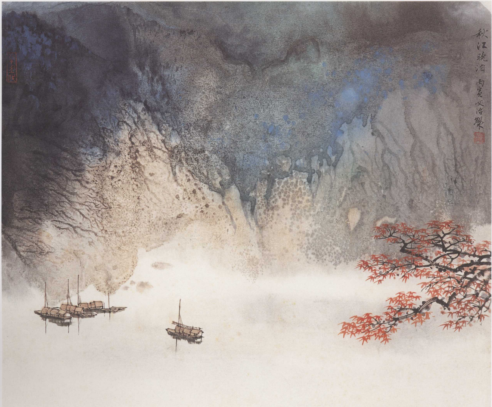
Moored at Dawn on the River in Autumn 秋江晚泊