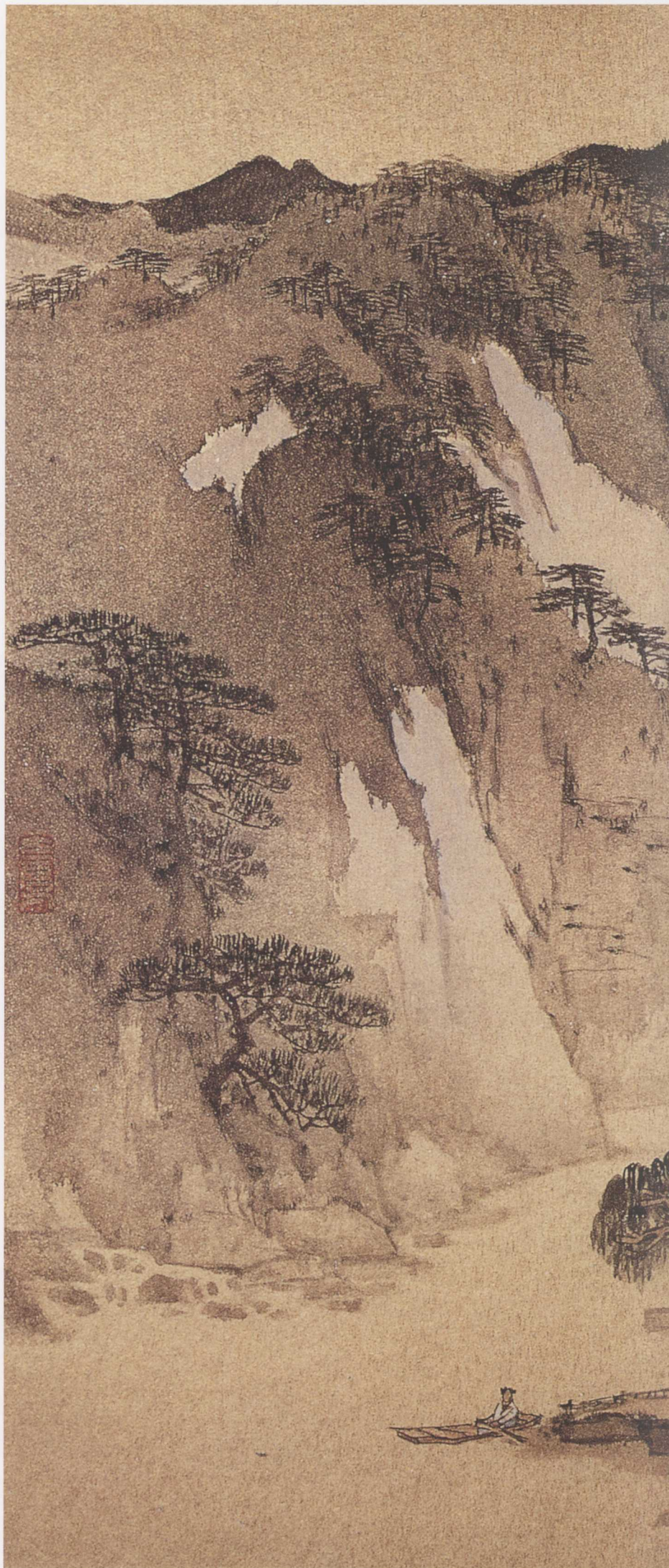
Mt. Lu After Snow Clears