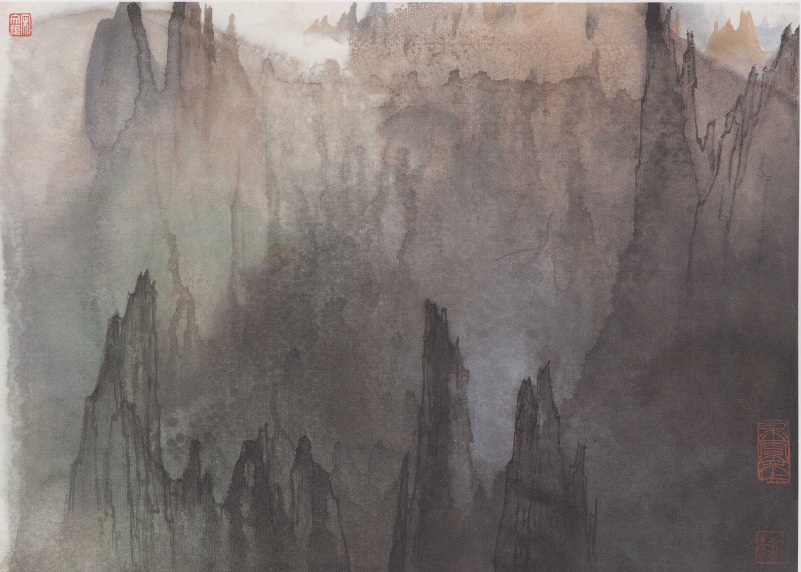
Stalagmite Peaks on Mt. Huang 黄山石笋峰