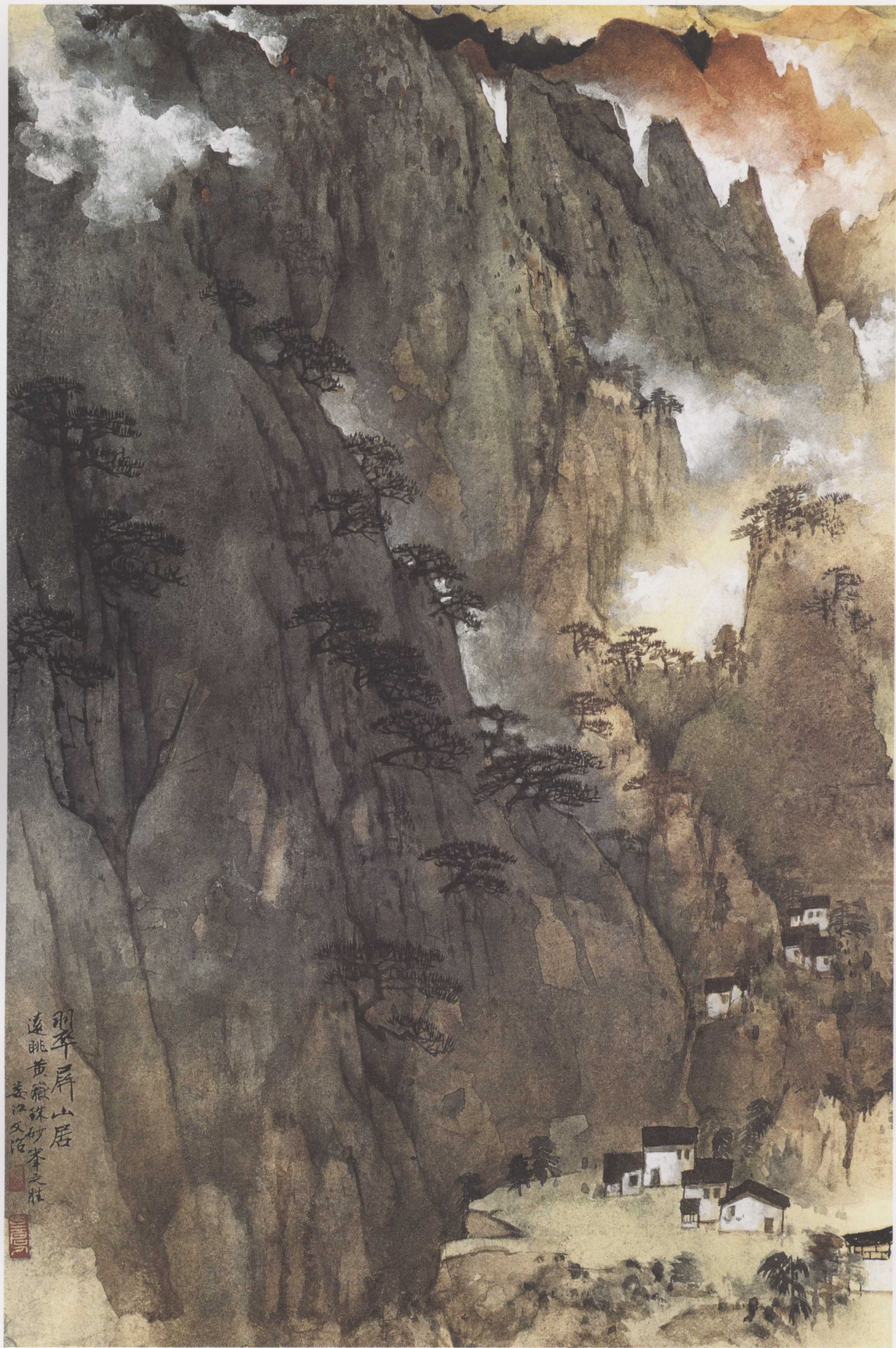
Cui Ping Mountain Dwellings