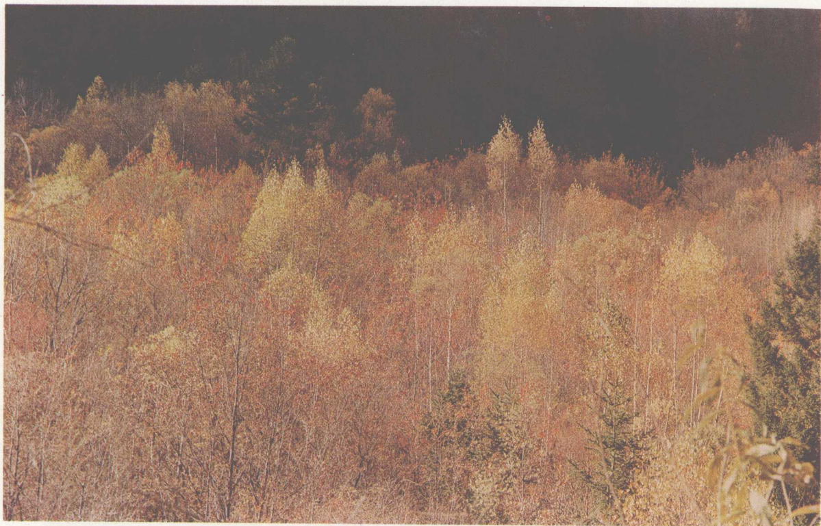
2. 失落的少年时的憧憬 RETRIEVED MEMORY OF JUNIOR DREAMS