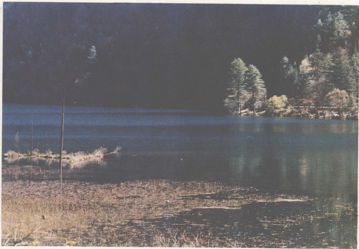
4. 甦 THE FIRST BEAMS OF SUNSHINE IN THE AWAKENING MOUNTAIN