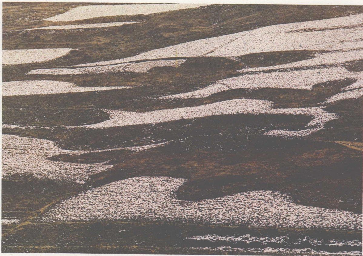
5. 诗笺 A POETIC SCENE