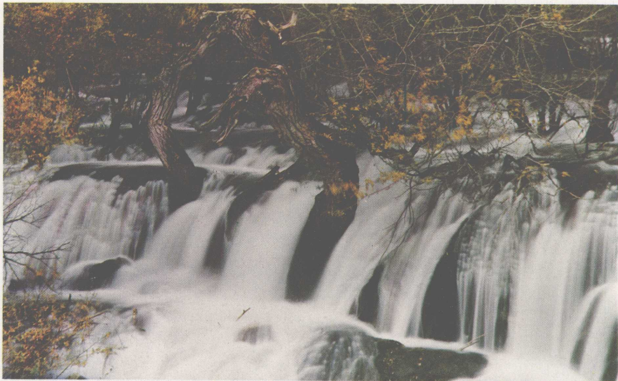
6. 恐龙的传说 THE LEGEND OF THE DINOSAUR