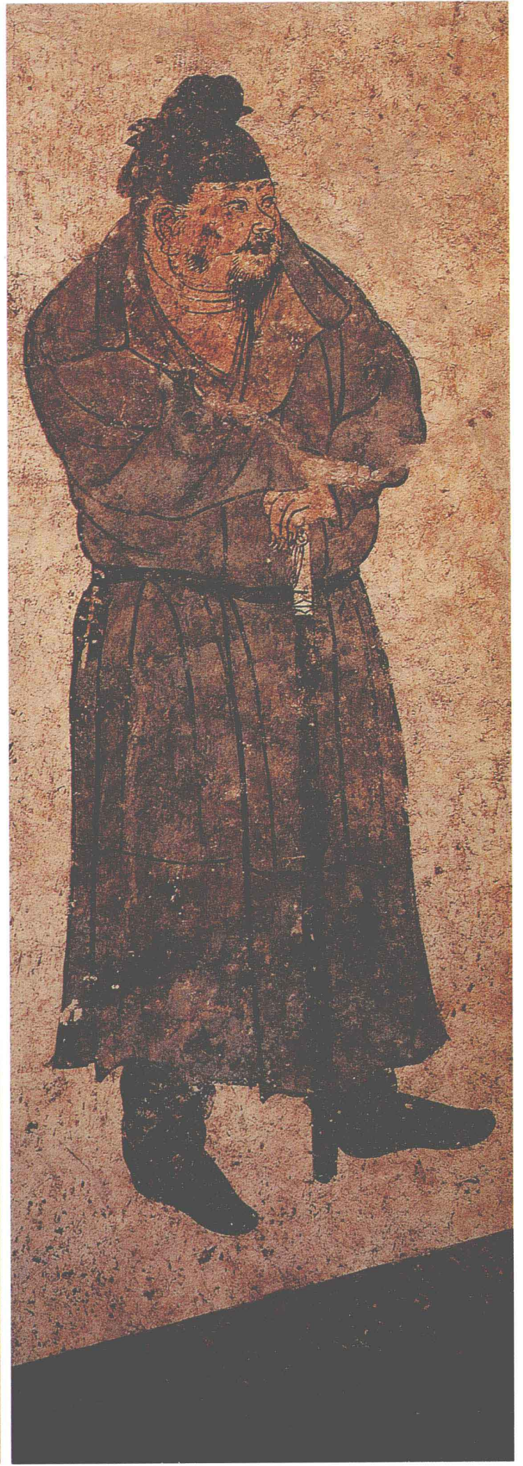
Tang, Anonymous: Honor Guards (Wall Painting) 223×281 cm 唐·無款 儀仗隊列 (壁畫)