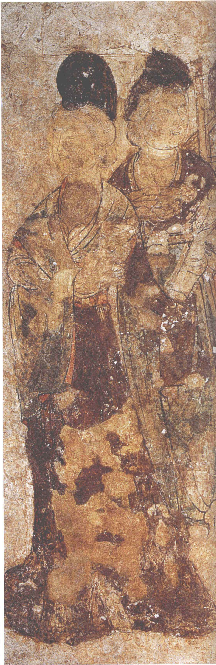
Tang, Anonymous: Female Attendants (Wall Painting) 177×198 cm