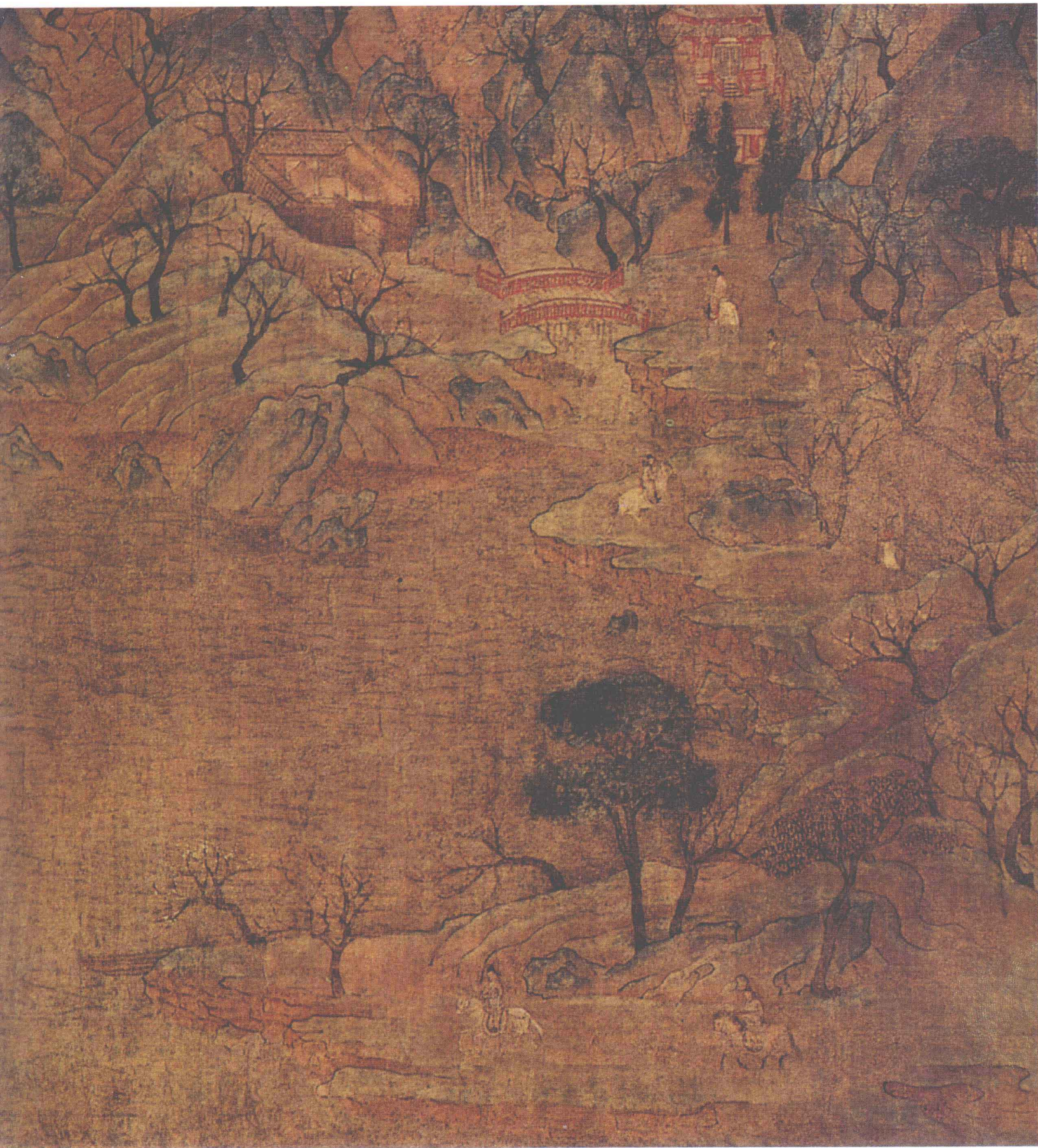
Sui, Zhan Ziqian: Spring Outing (Partial)