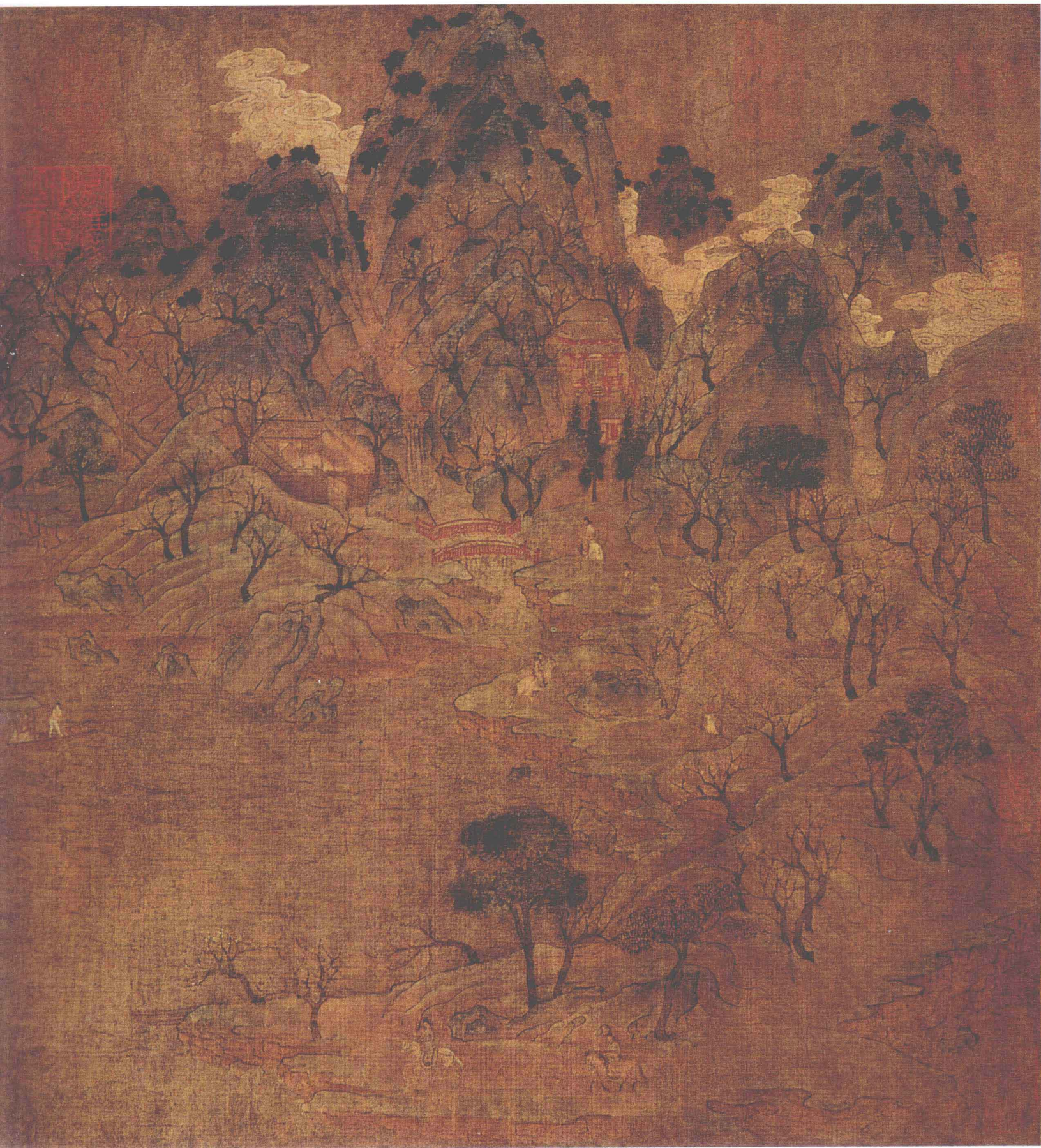
Sui, Zhan Ziqian: Spring Outing 43×80.5 cm