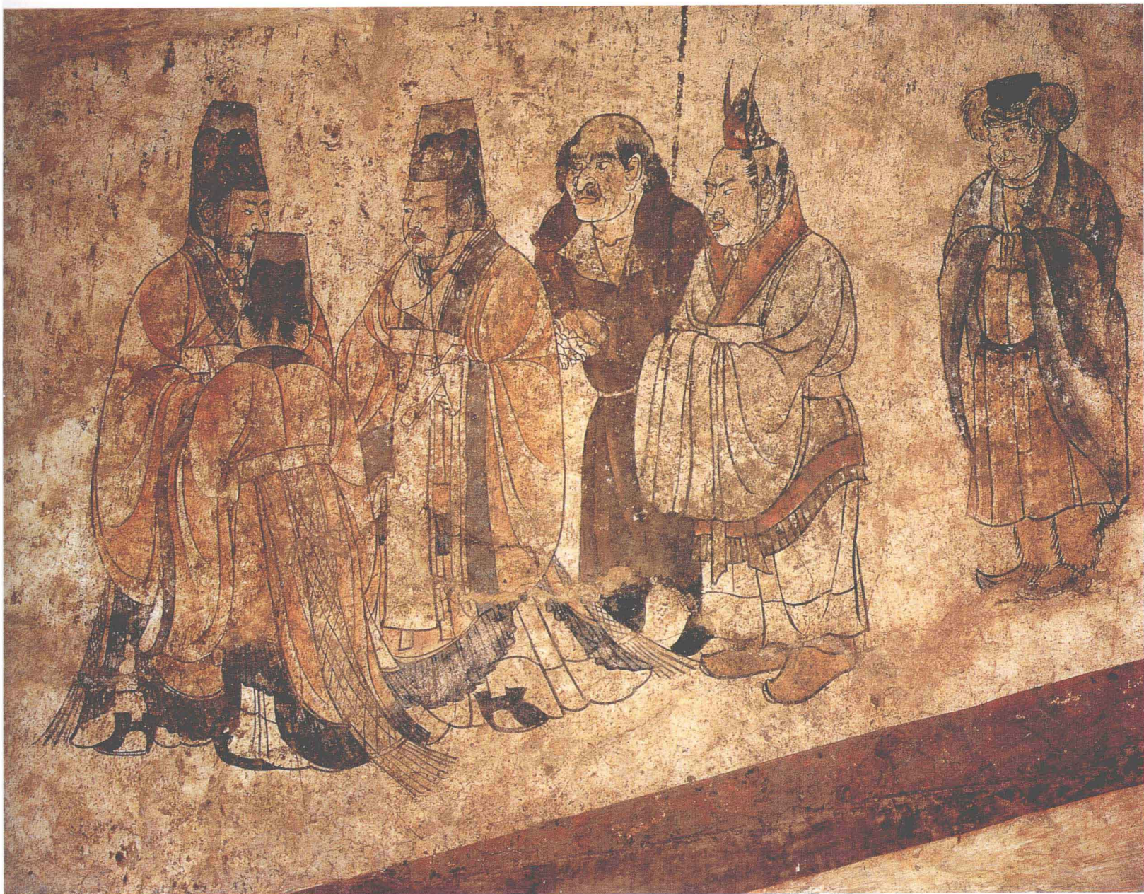
Tang, Anonymous: Greeting Guests (Wall Painting)