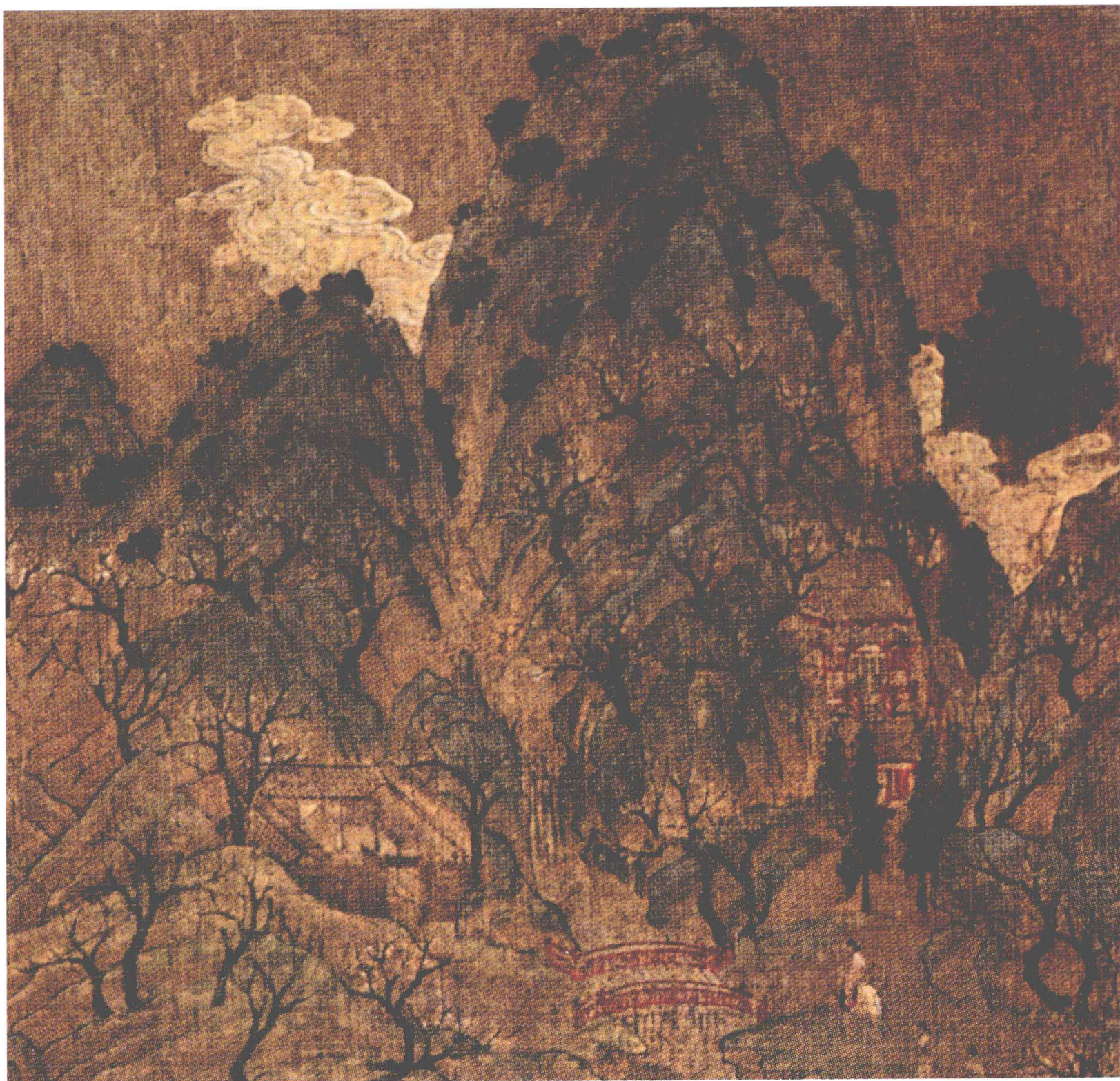
Sui, Zhan Ziqian: Spring Outing (Partial)