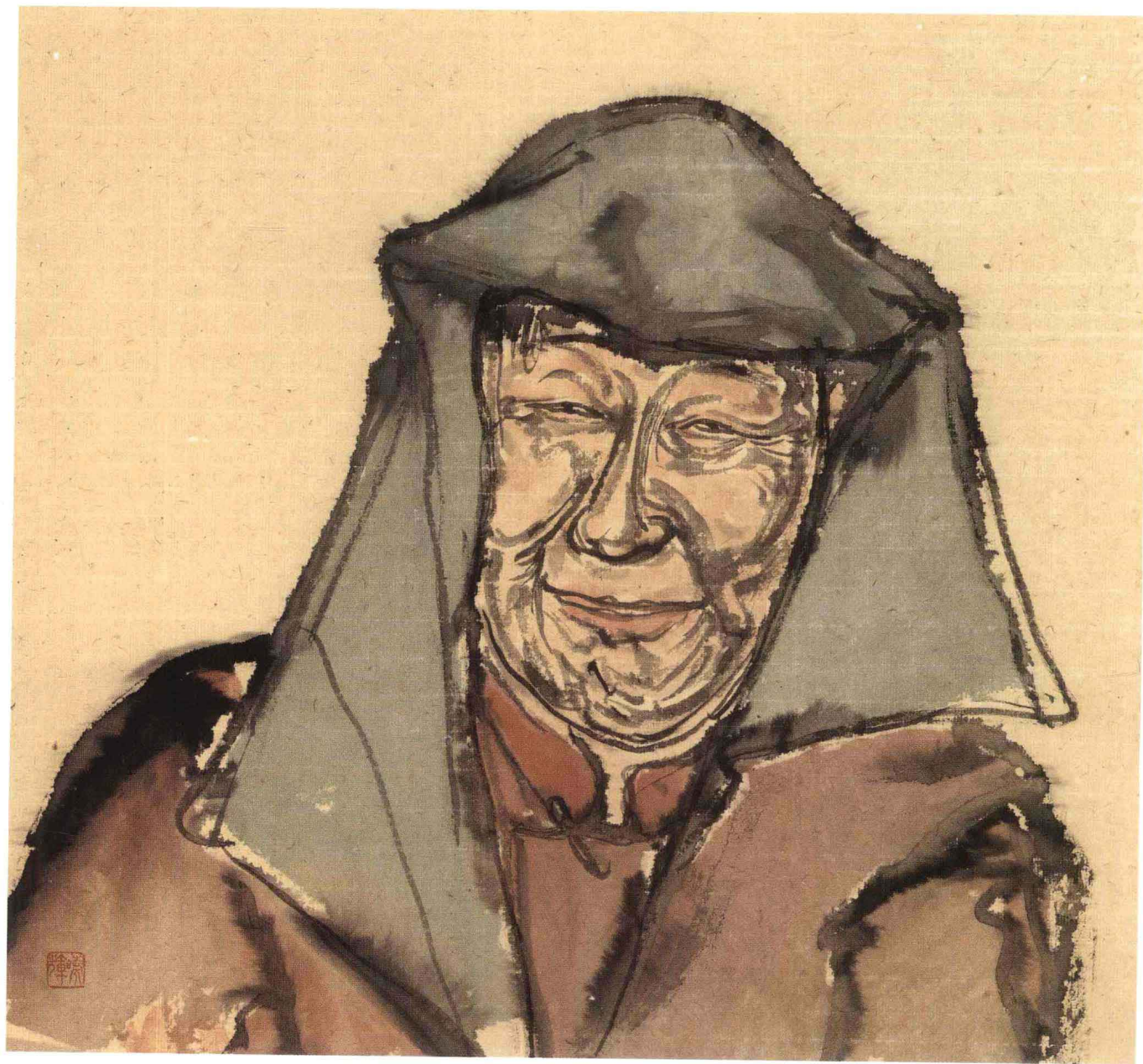
人物系列之一 纸本设色 40cm × 40cm 2005