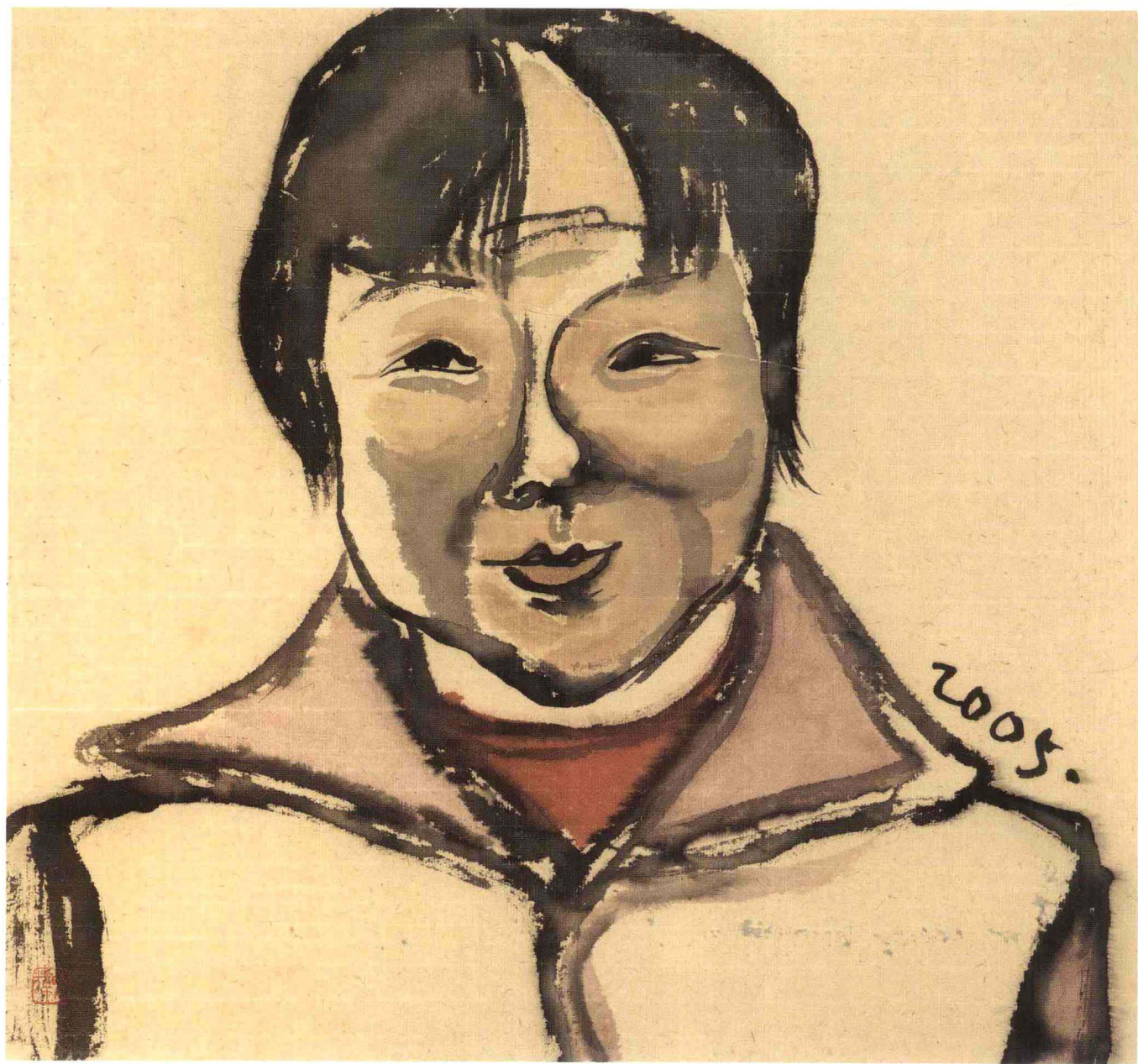
人物系列之七 纸本设色 40cm × 40cm 2005