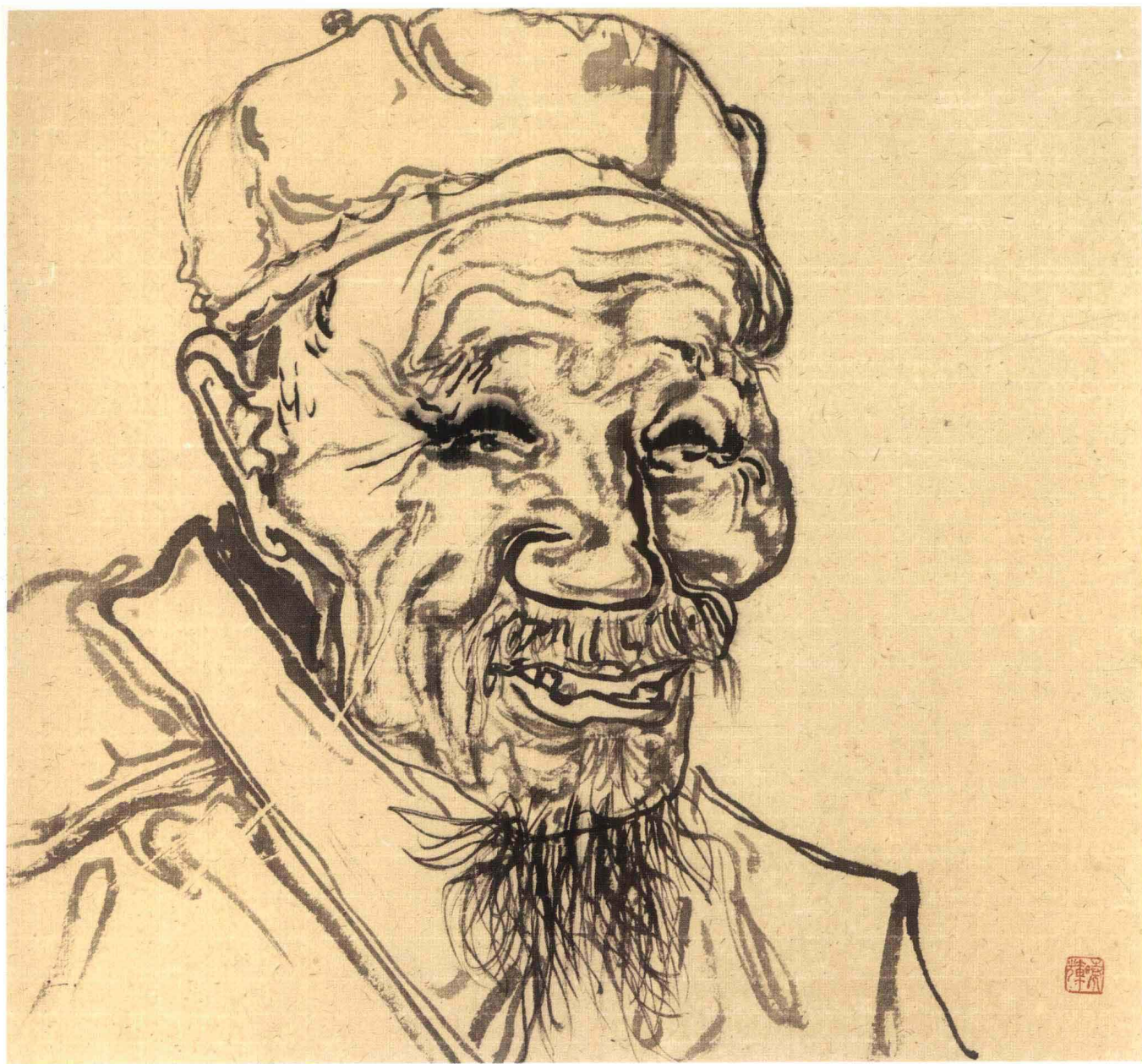
人物系列之十三 纸本设色 40cm × 40cm 2005