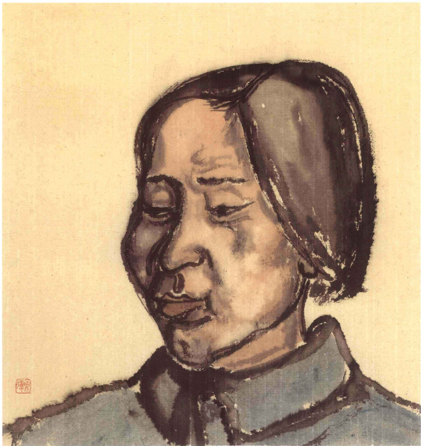
人物系列之十 纸本设色 50cm × 40cm 2005