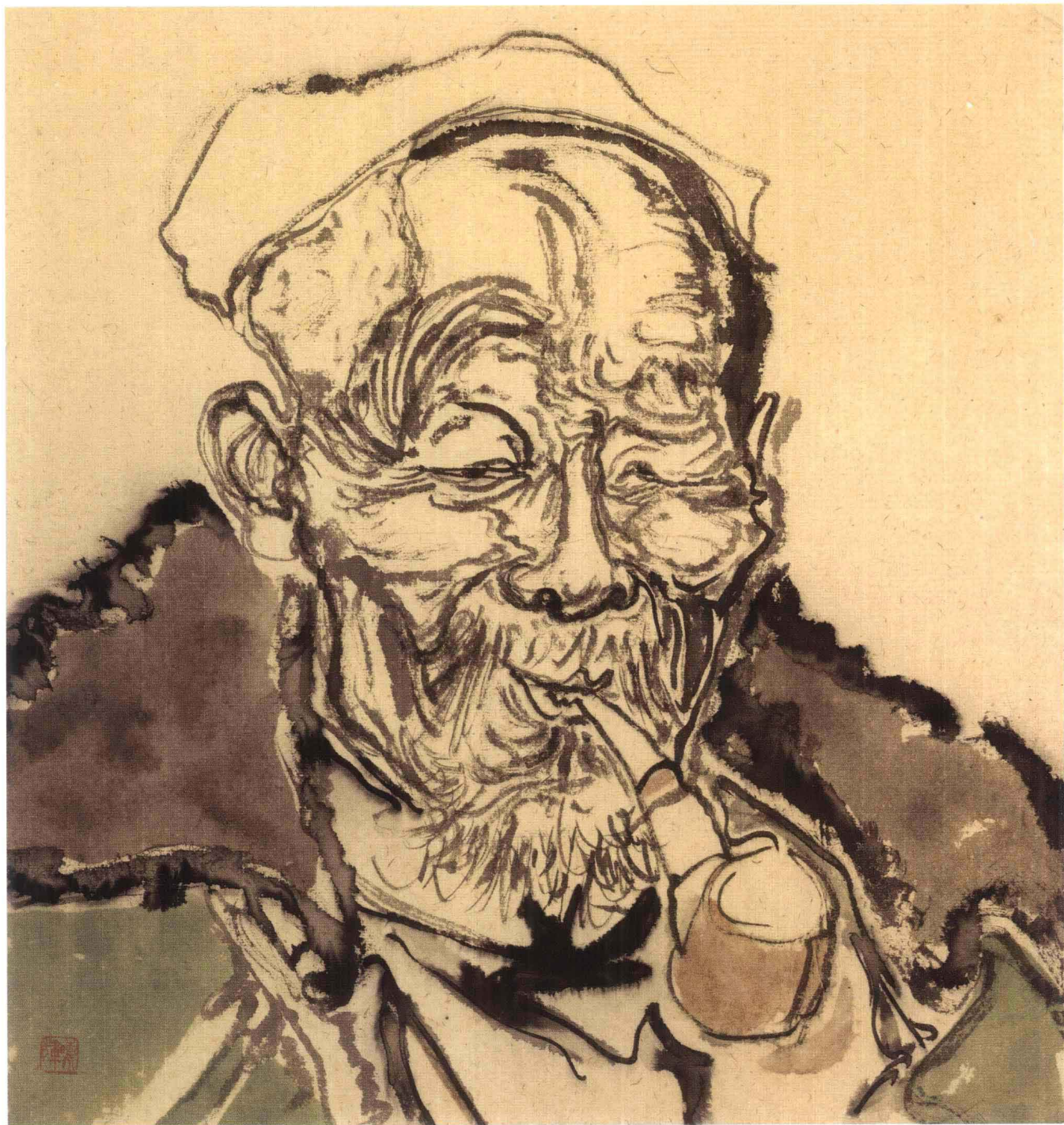
人物系列之十二 纸本设色 50cm × 40cm 2005