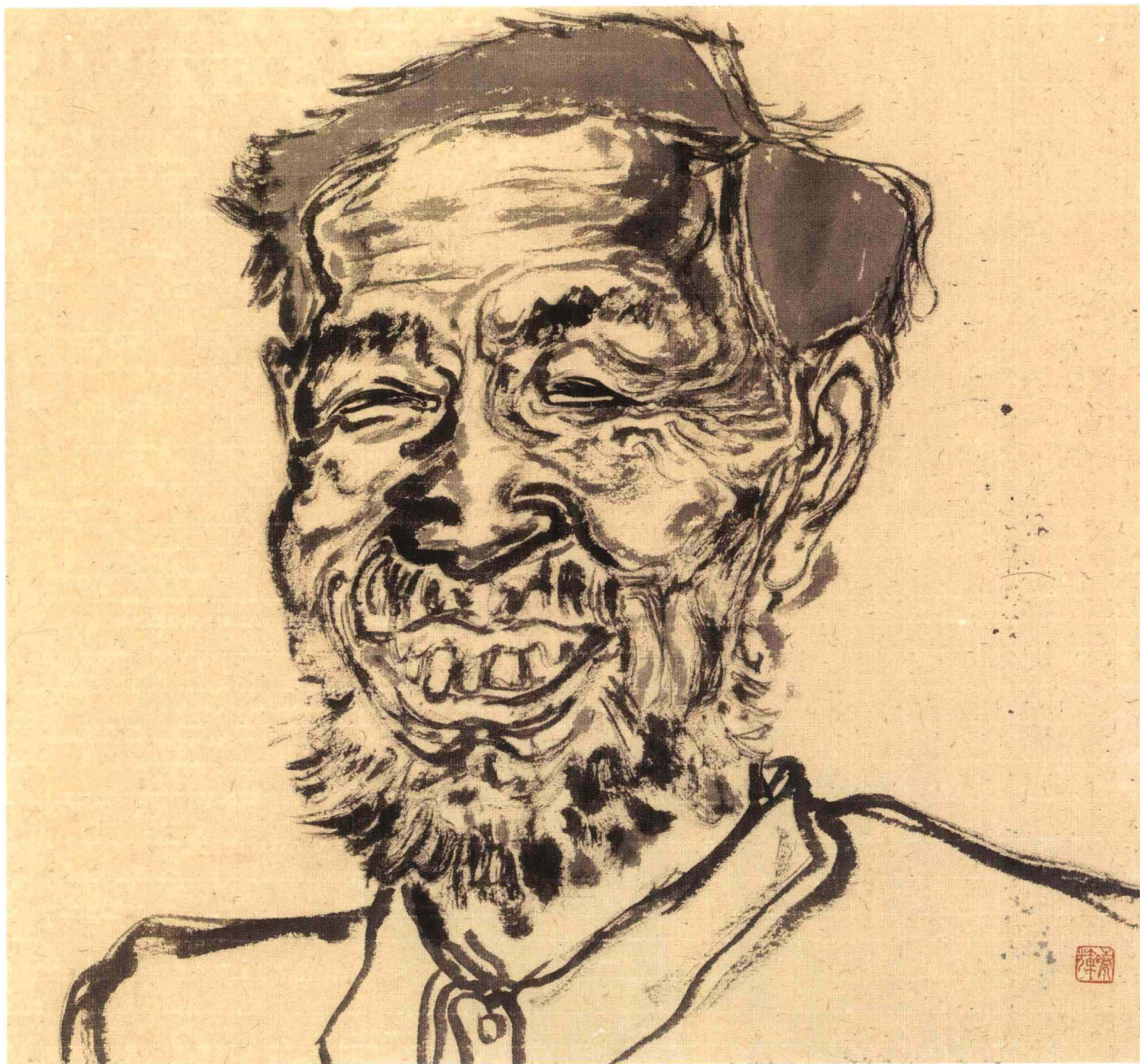
人物系列之六 纸本设色 40cm × 40cm 2005