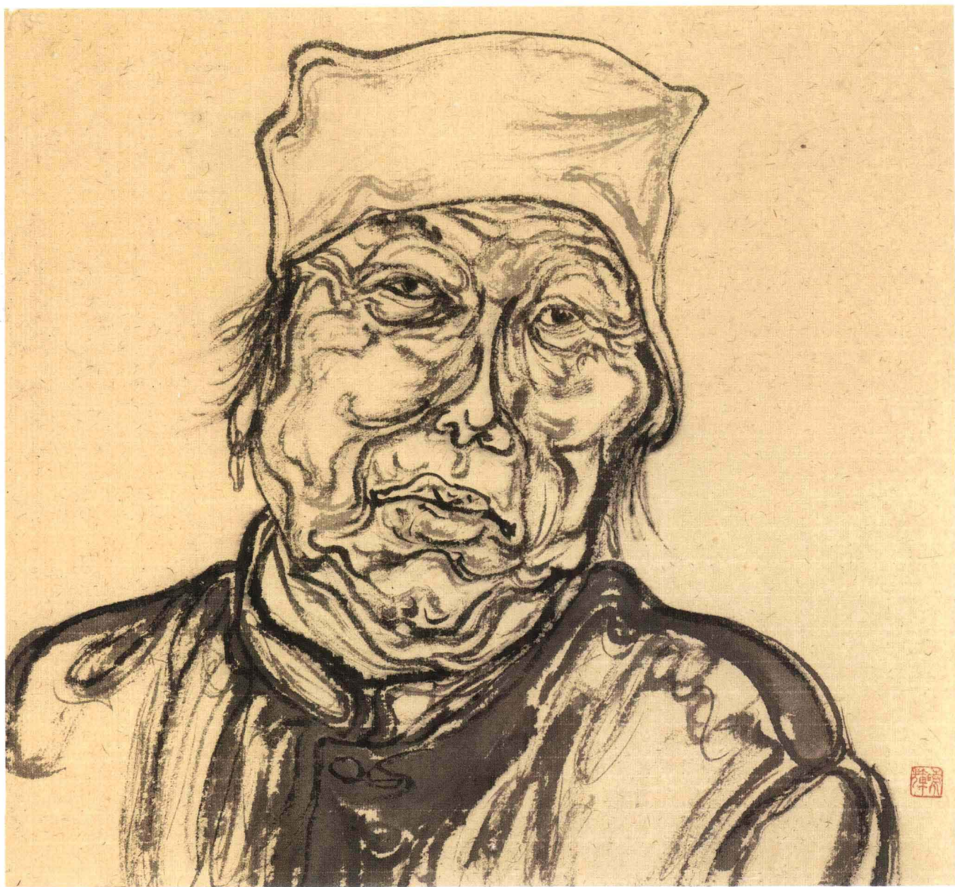
人物系列之五 纸本设色 40cm × 40cm 2005