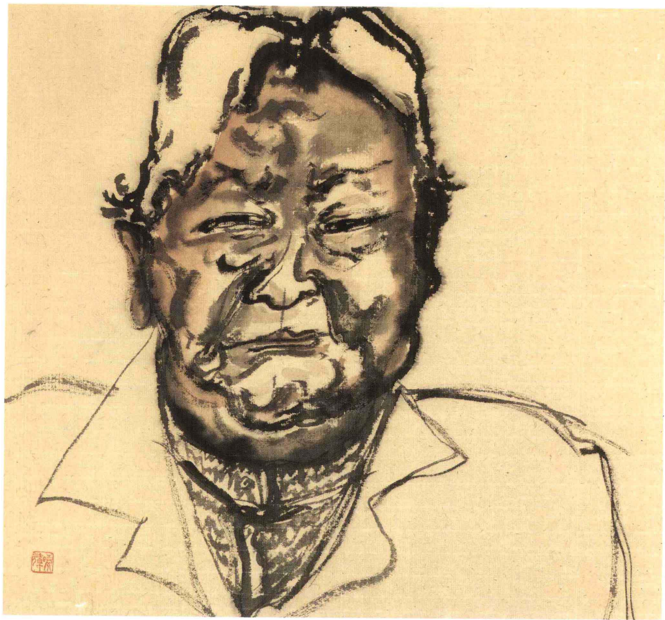
人物系列之四 纸本设色 40cm × 40cm 2005