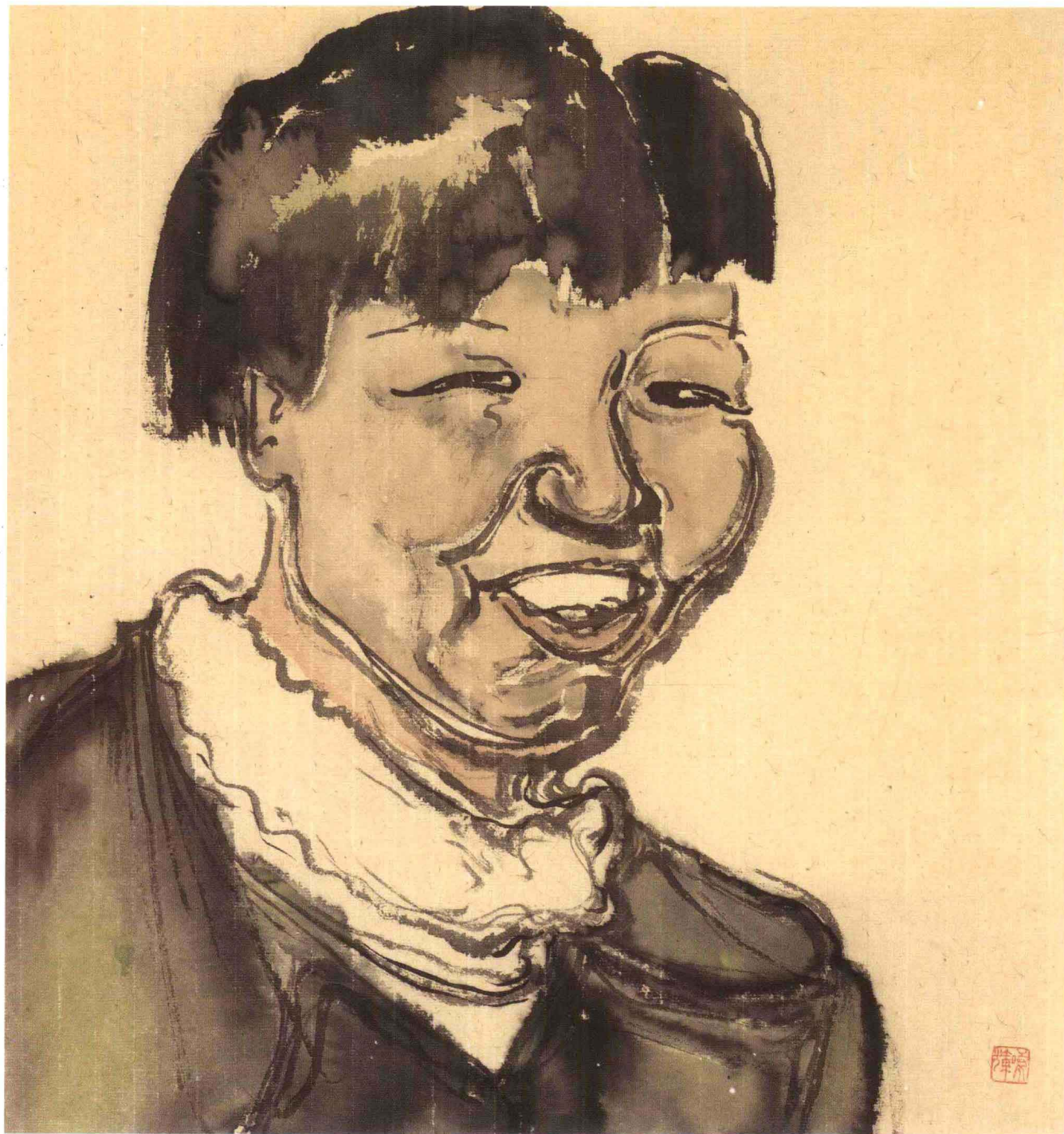
人物系列之九 纸本设色 50cm x 40cm 2005