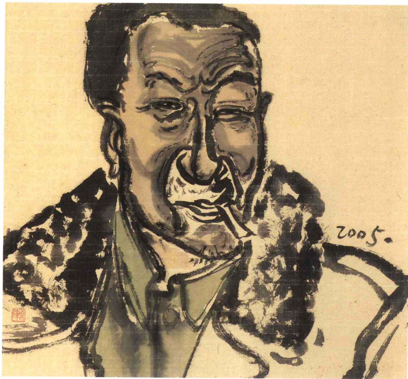
人物系列之三 纸本设色 40cm x 40cm 2005