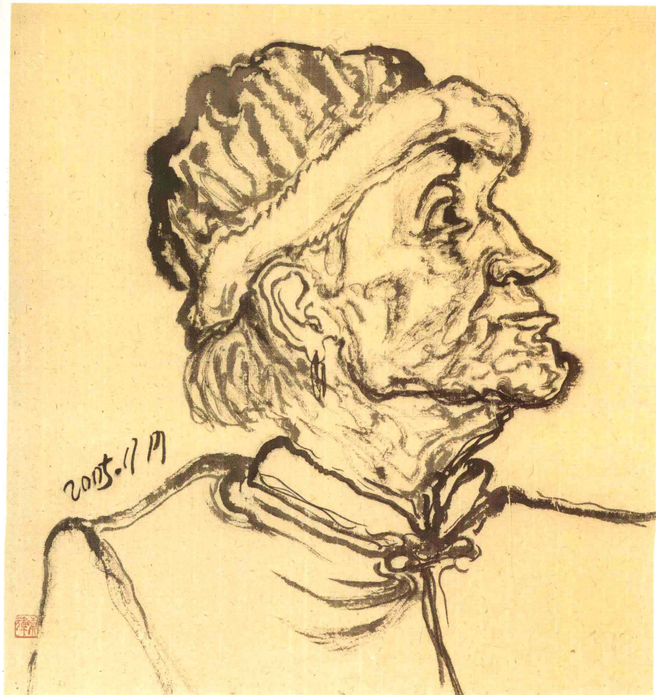
人物系列之十一 纸本设色 50cm × 40cm 2005