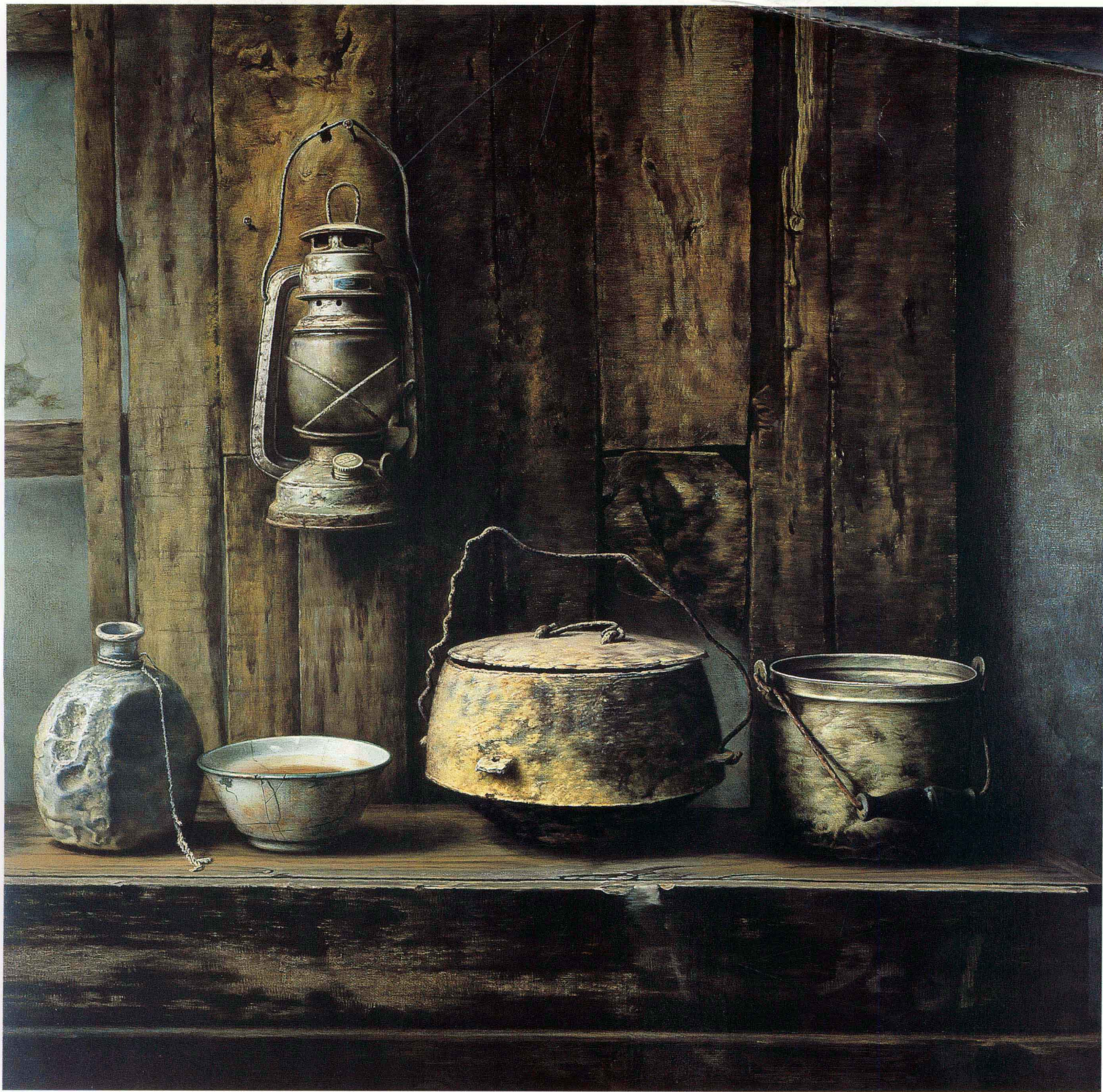
艱苦留痕 The Mark of Hard Days Before