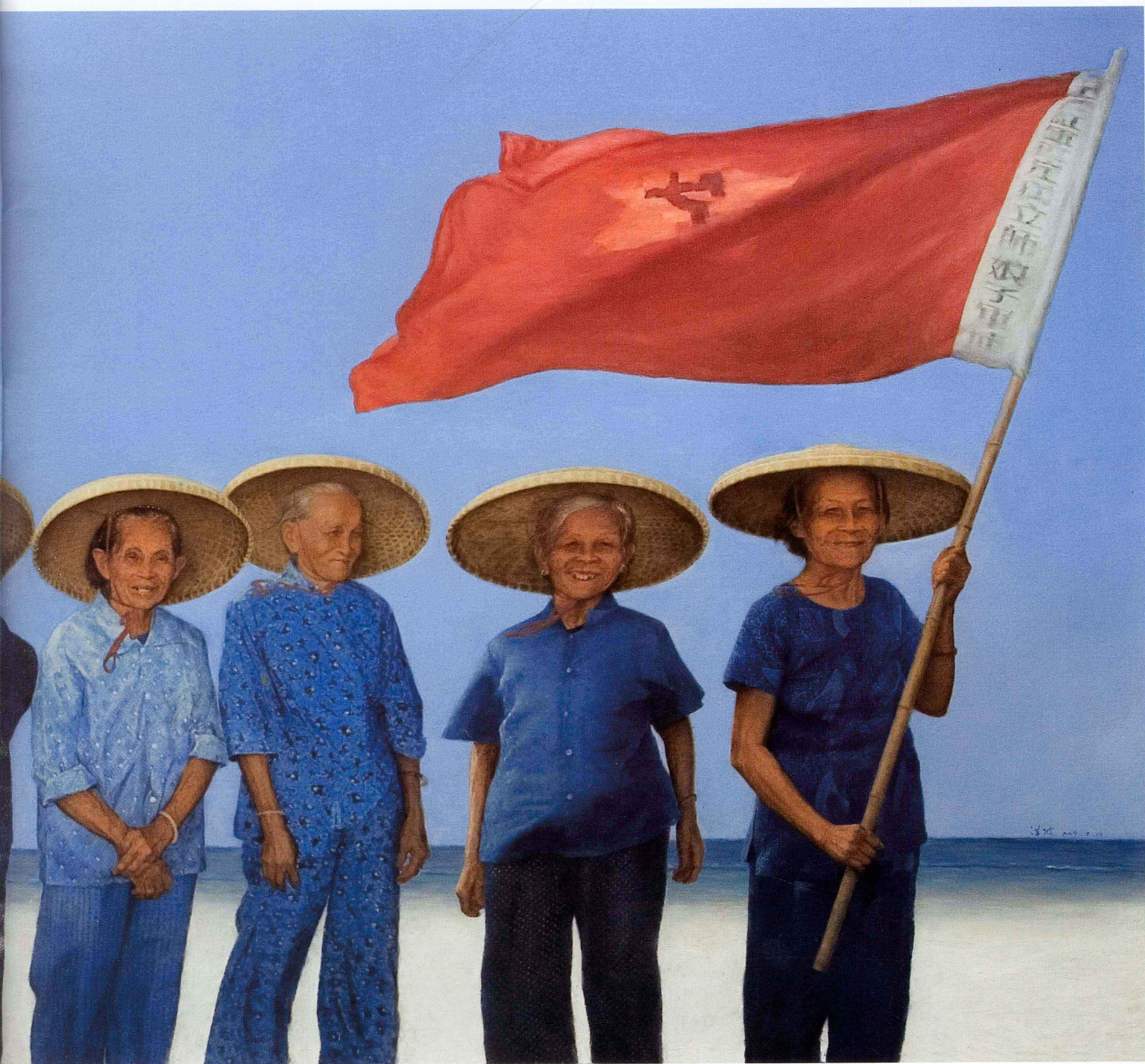
紅色娘子軍之歌 Reunion of Red Detachment of Women