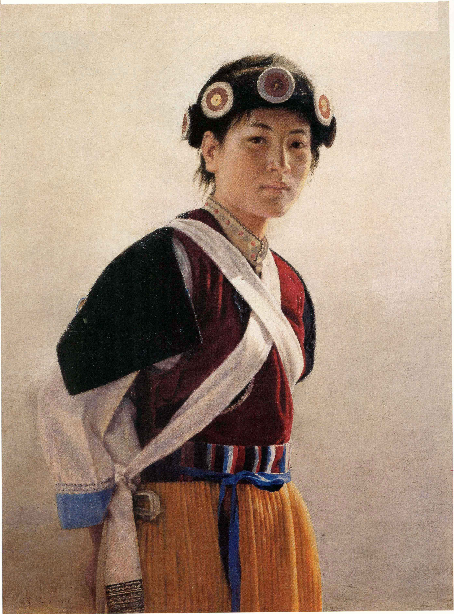
納西姑娘 A Girl of Naxi Minority