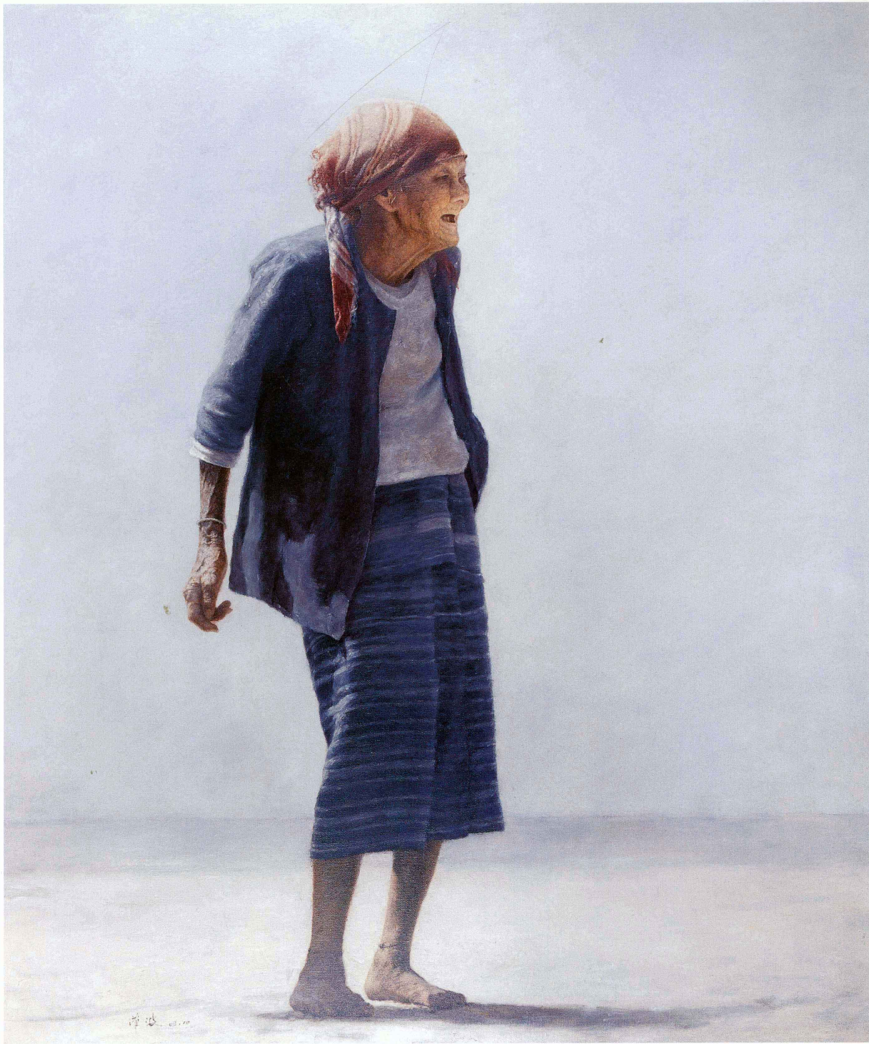
祖母 My Grandma