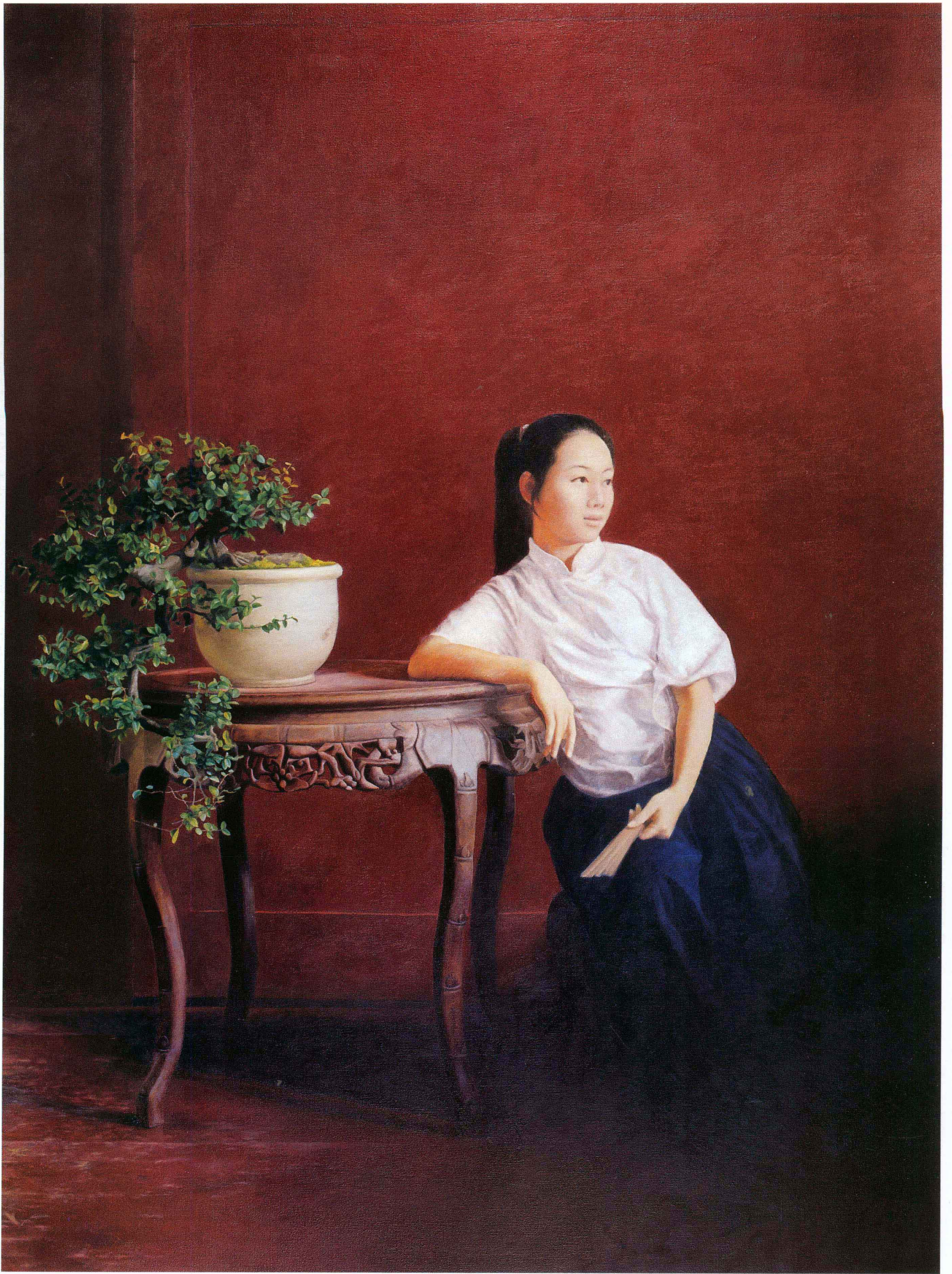
九里香 The Flower's Fragrance Lasts for Long Distance