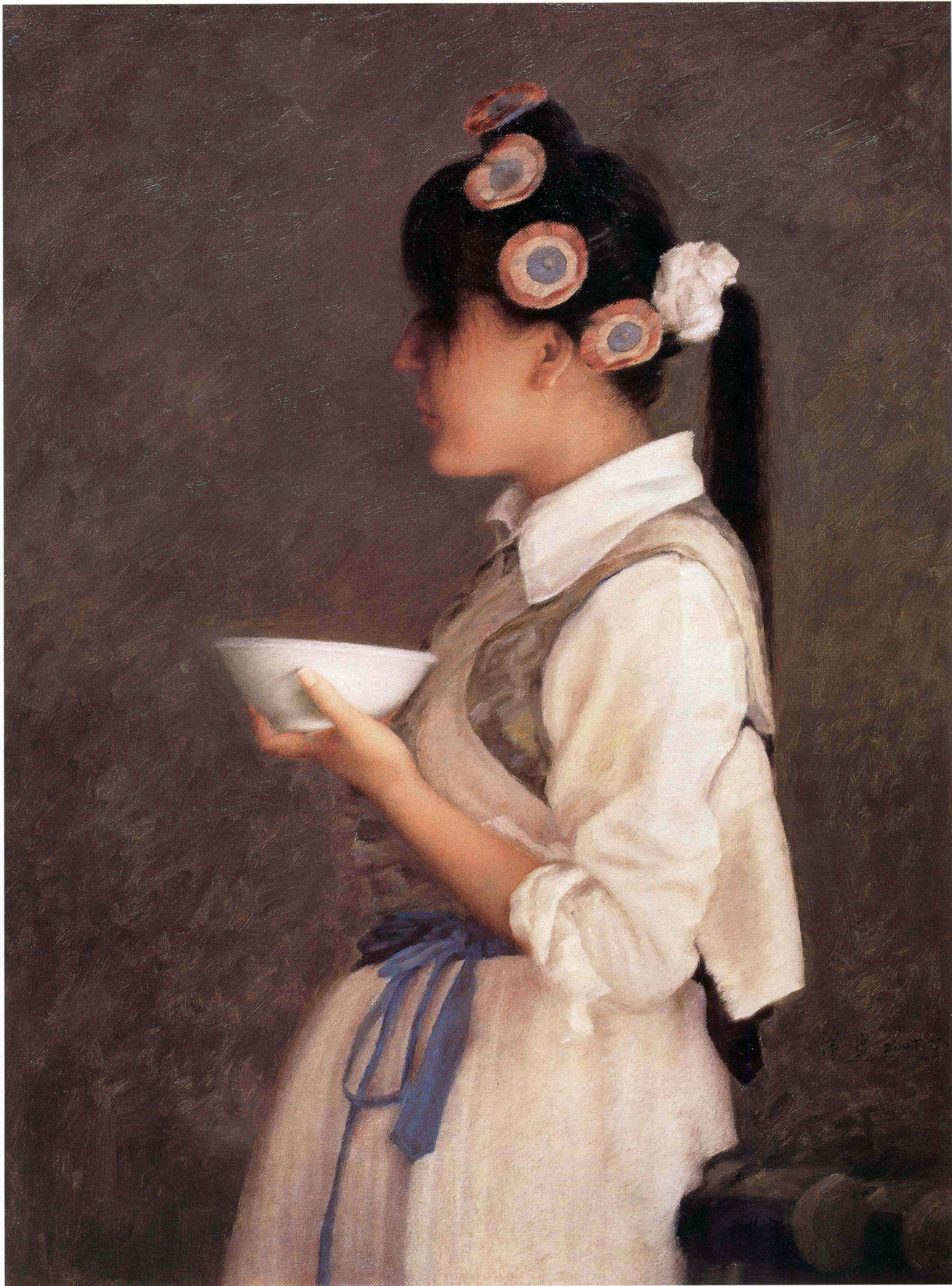
蕎麥酒 Buckwheat Wine