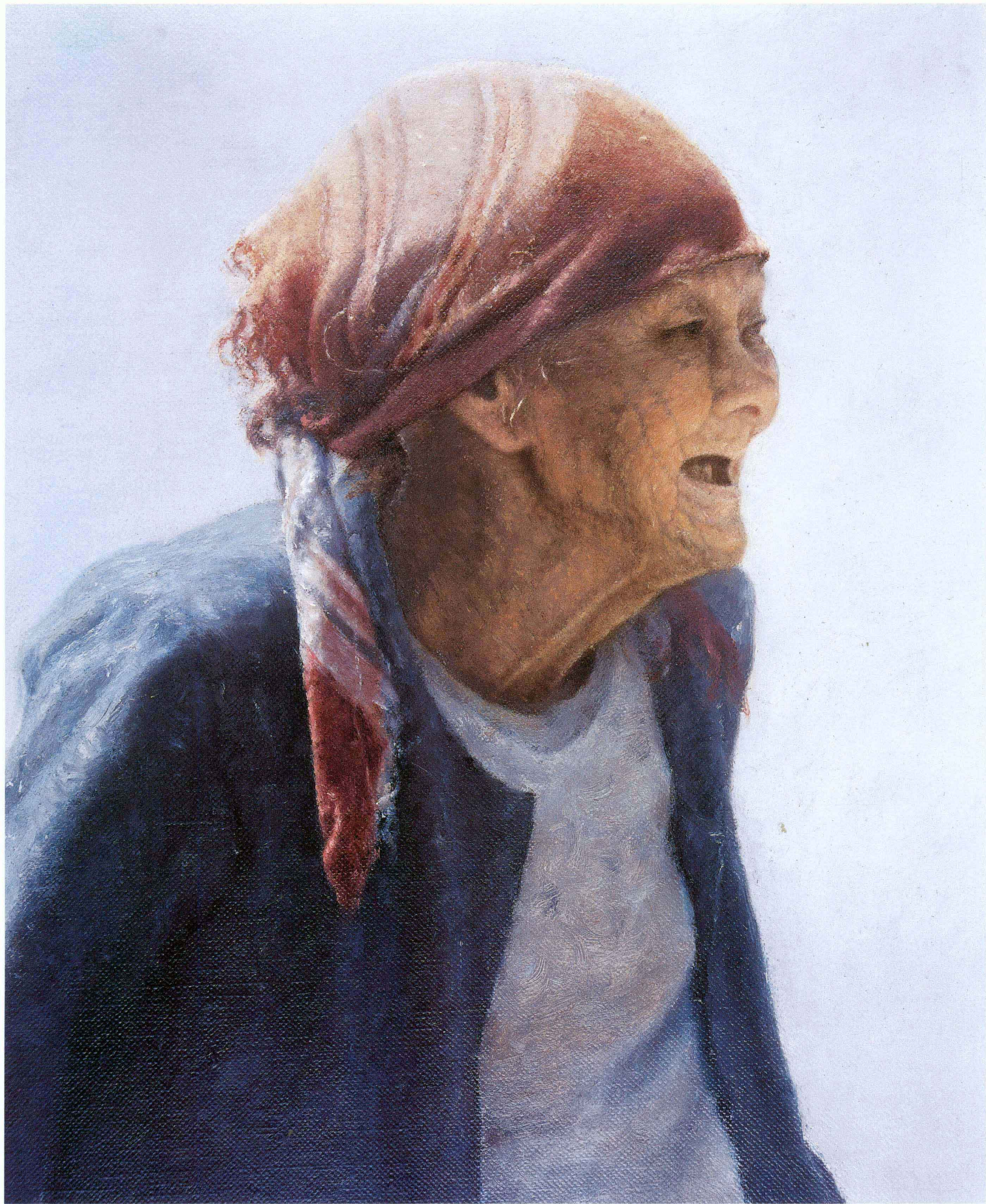
祖母（局部） My Grandma(Detail)