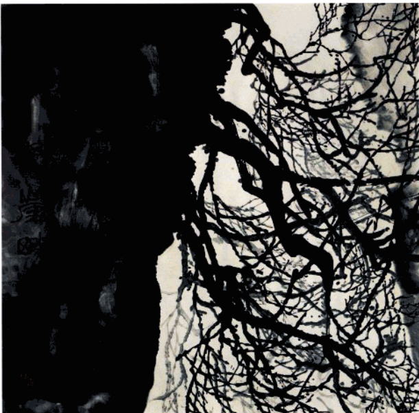
■ 悬崖畔上 branches on the cliff