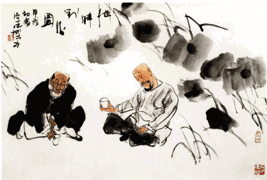
■ 池畔对酒图 Drinking at pond