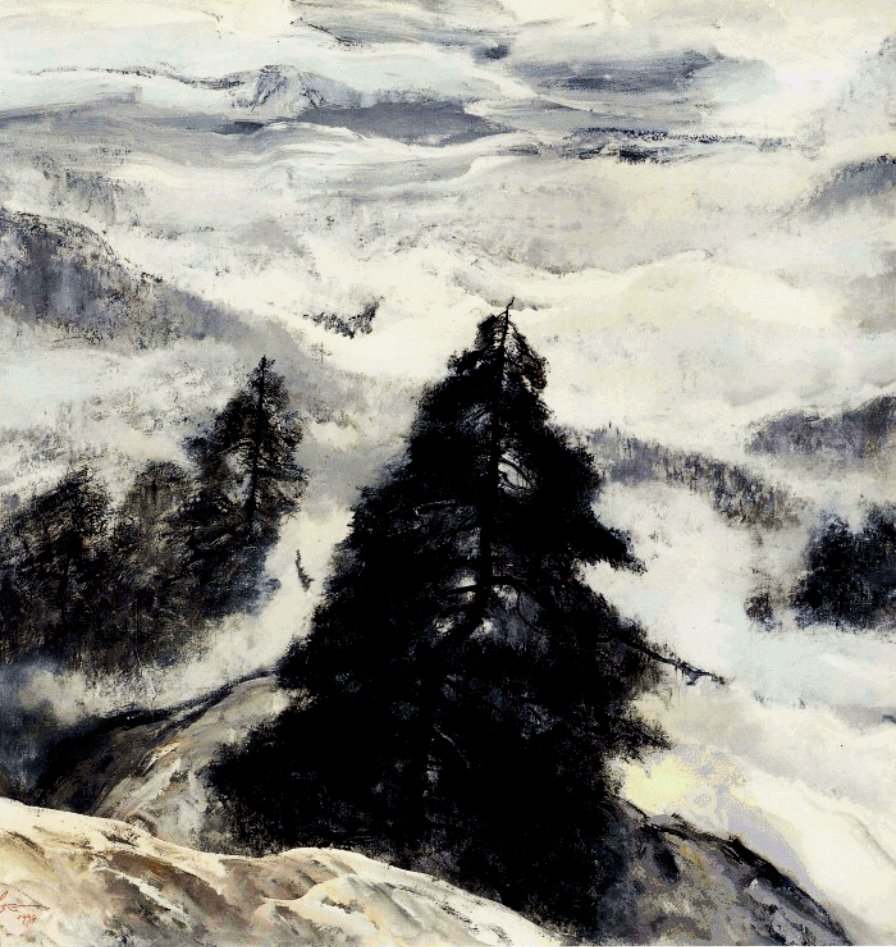
■ 雨雪松云 Pine clouds in rain and snow