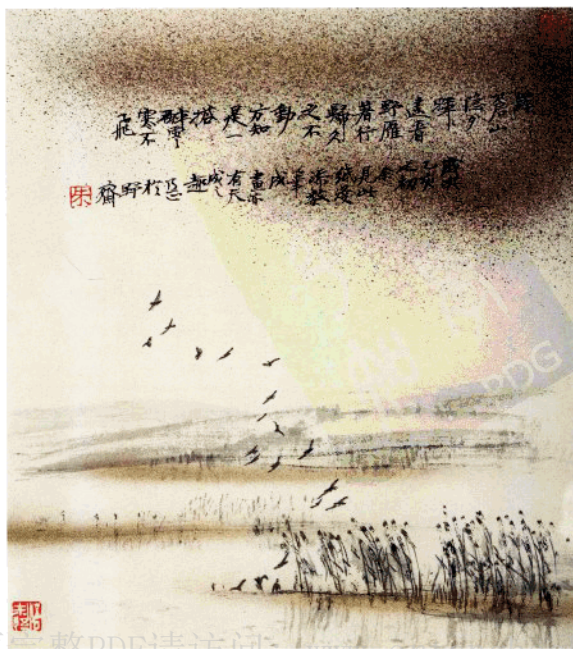
■ 惊起一片鸥鹭 Frightened gulls and herons