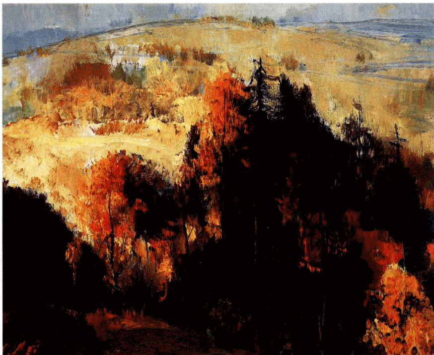
■ 金秋 Golden autumn