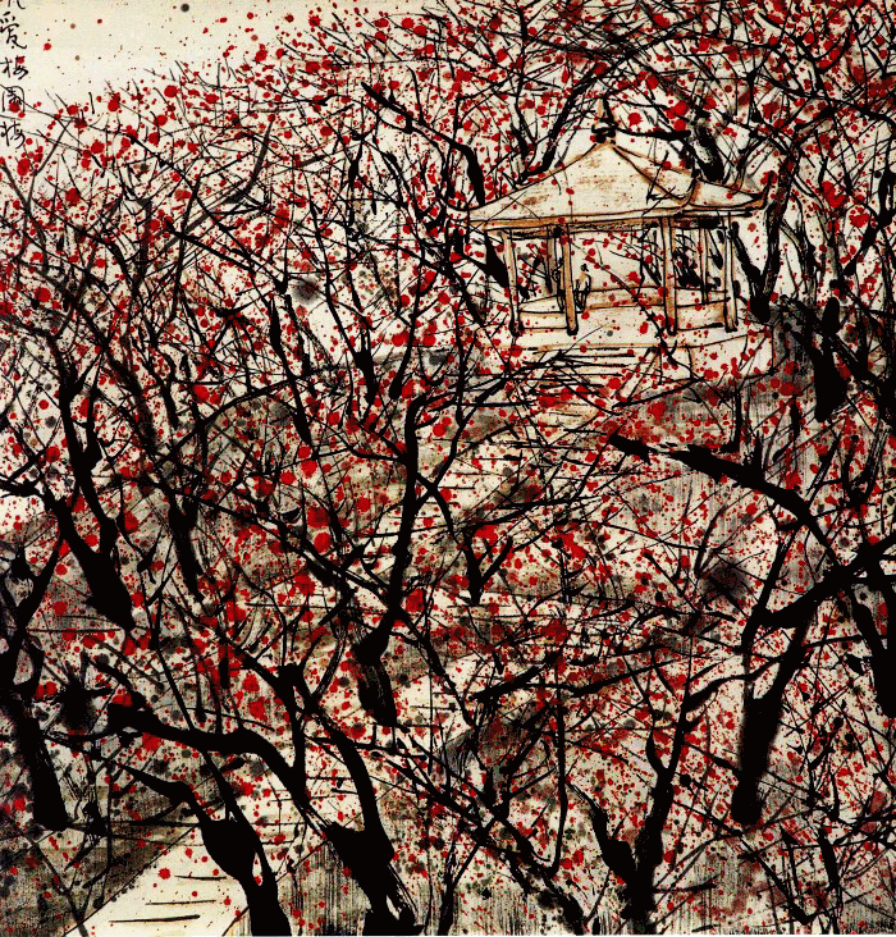
■ 梅园新春 New spring of plum garden