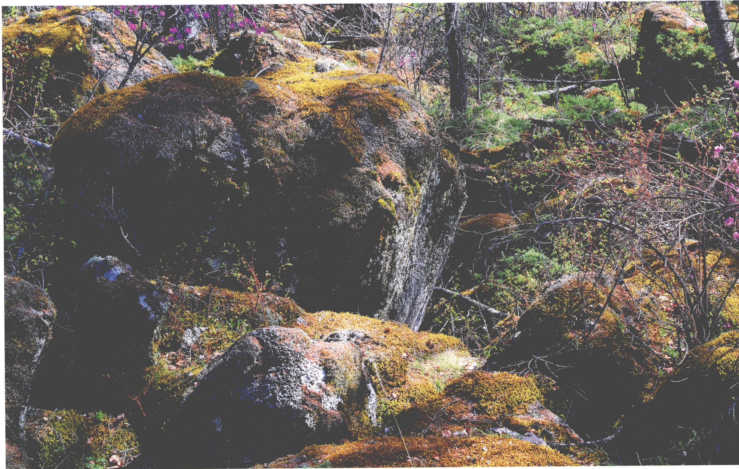
大朴不雕原生态 远离尘嚣自天然 A original nature of simplicity without carving Stay away from the hustle and bustle is the nature