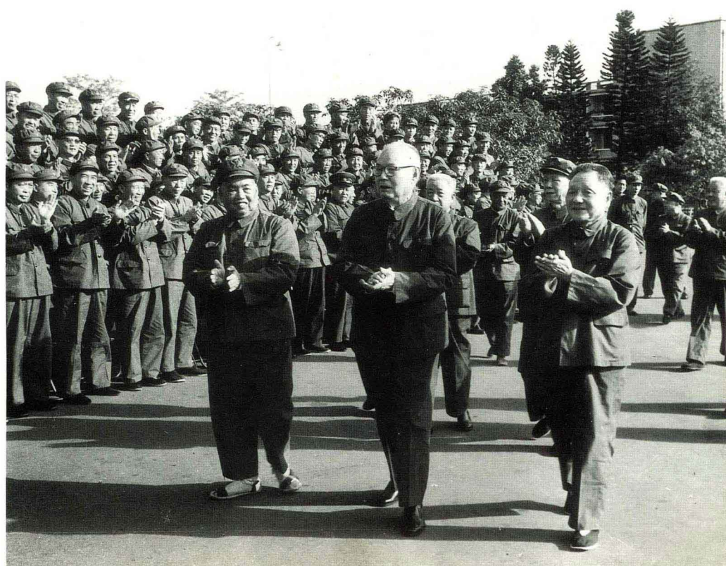
葉劍英、鄧小平同志在 廣州會見廣州軍區陸、海、 空三軍師以上幹部。

Comrades Ye Jianying and Deng Xiaoping and other leaders at the central-level, met with Party and government leading cadres from Guangdong Province and Guangzhou Municipality in Guangzhou.