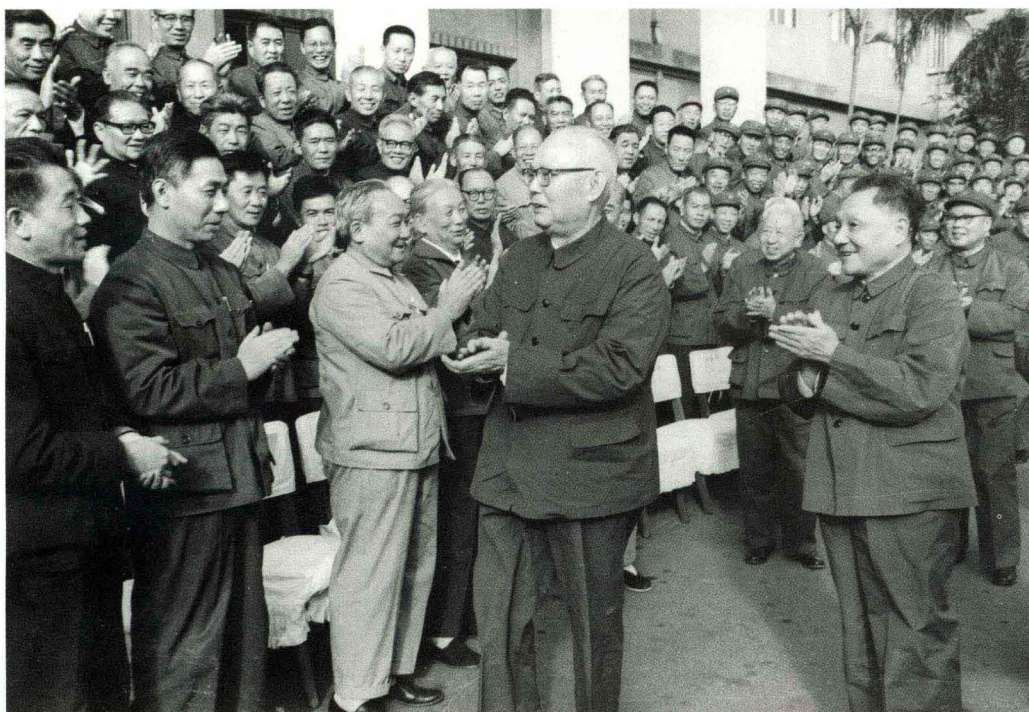
葉劍英、鄧小平等中央 領導同志，在廣州會見廣東 省、廣州市黨政領導幹部。

Comrades Ye Jianying and Deng Xiaoping and other leaders at the central-level, met with Party and government leading cadres from Guangdong Province and Guangzhou Municipality in Guangzhou.