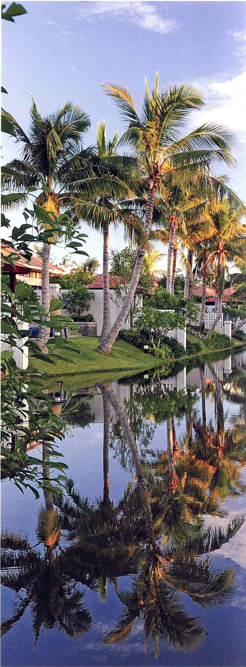
1. 水中有岛,岛中有水,户户临水 1. All the villas are located beside the water

The scheme and architecture style of the hotel are different from traditional villas' concept, which aims at building a completely new tropical golf holiday island. Develop small villas, create island environment and romantic atmosphere, build privacy space, focus on scenic environment, protect environmental resources as much as possible, put the idea of holiday and leisure in every detail, combine the modern architecture and exquisite landscape to provide elegant holiday meaning, create international top-level leisure holiday community.