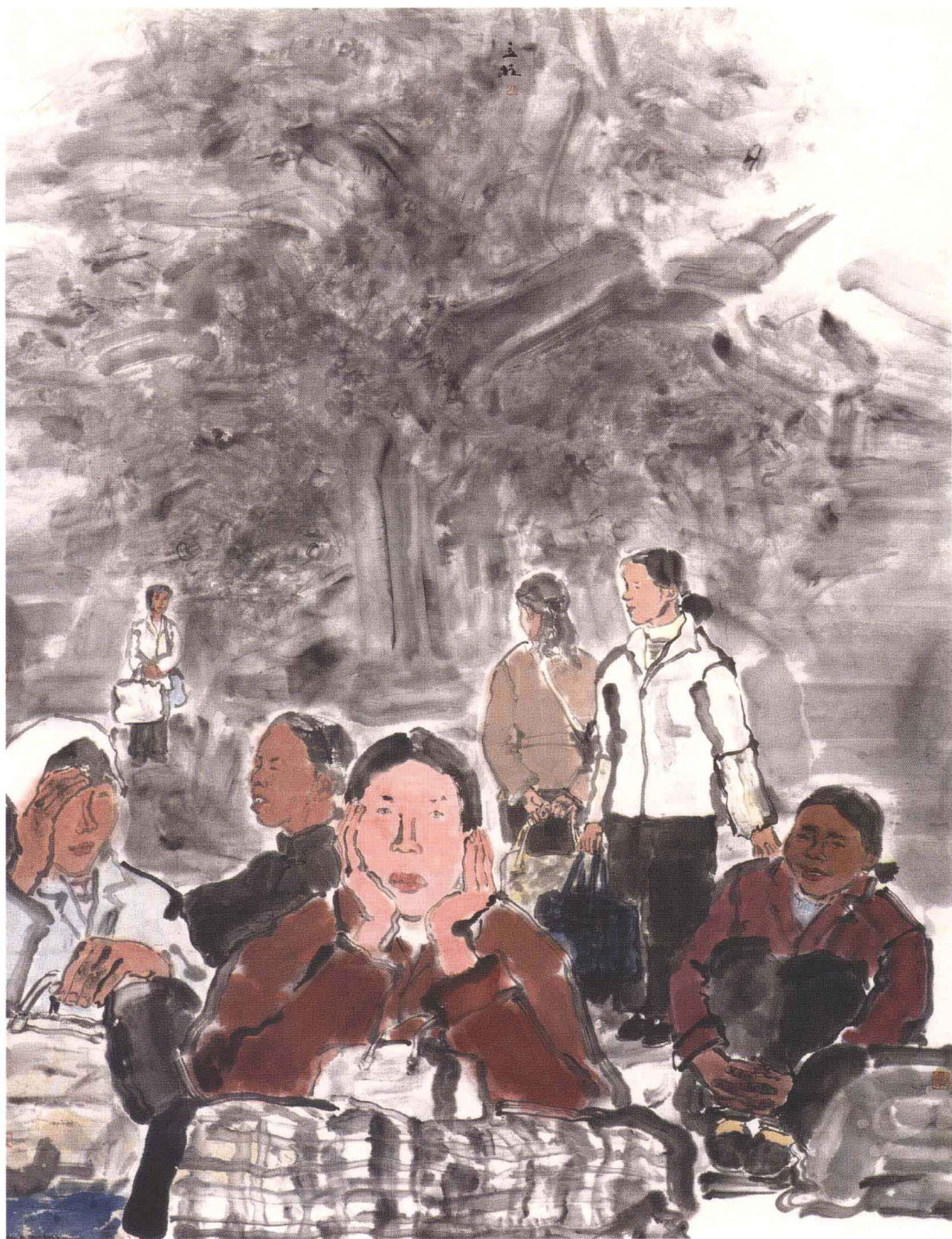
走出槐堡(二) 纸本设色 173cm × 134cm 2004