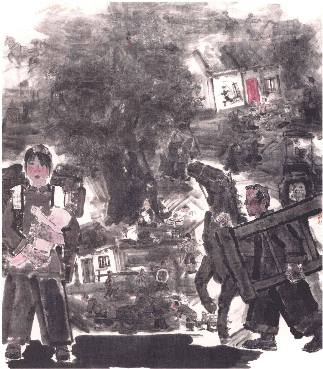
乡亲们 纸本设色 219cm × 192cm 2004