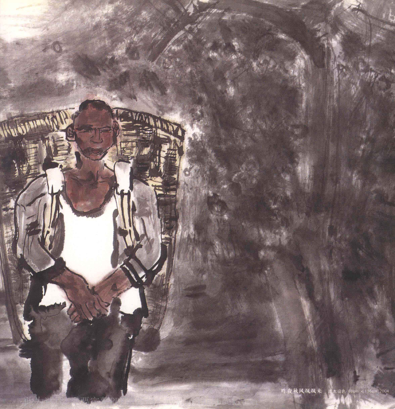
昨夜秋风飒飒来 红木设色 68cm × 136cm 2004