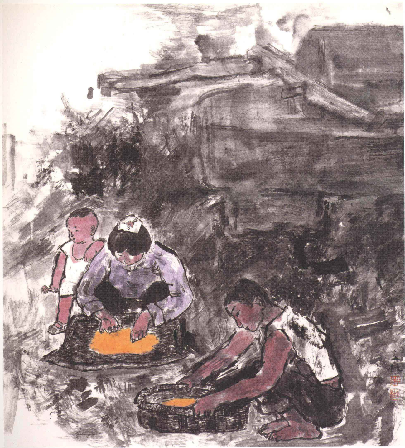
老石碾 纸本设色 90cm × 85cm 2004