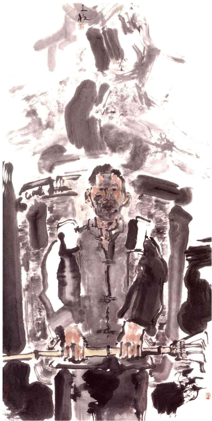
槐乡人(二) 纸本设色 136cm x 68cm 2004