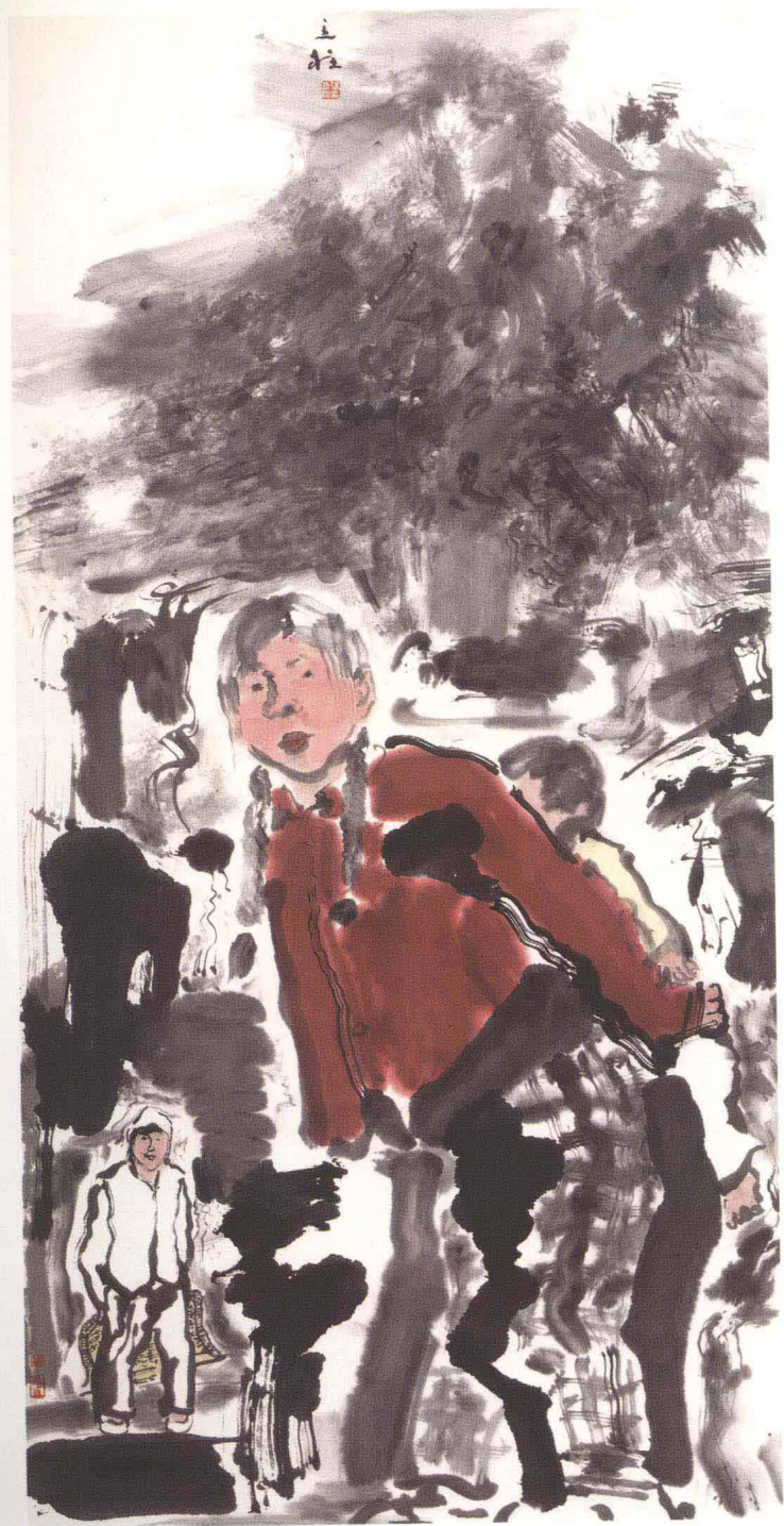
槐乡人(三) 纸本设色 136cm × 68cm 2004