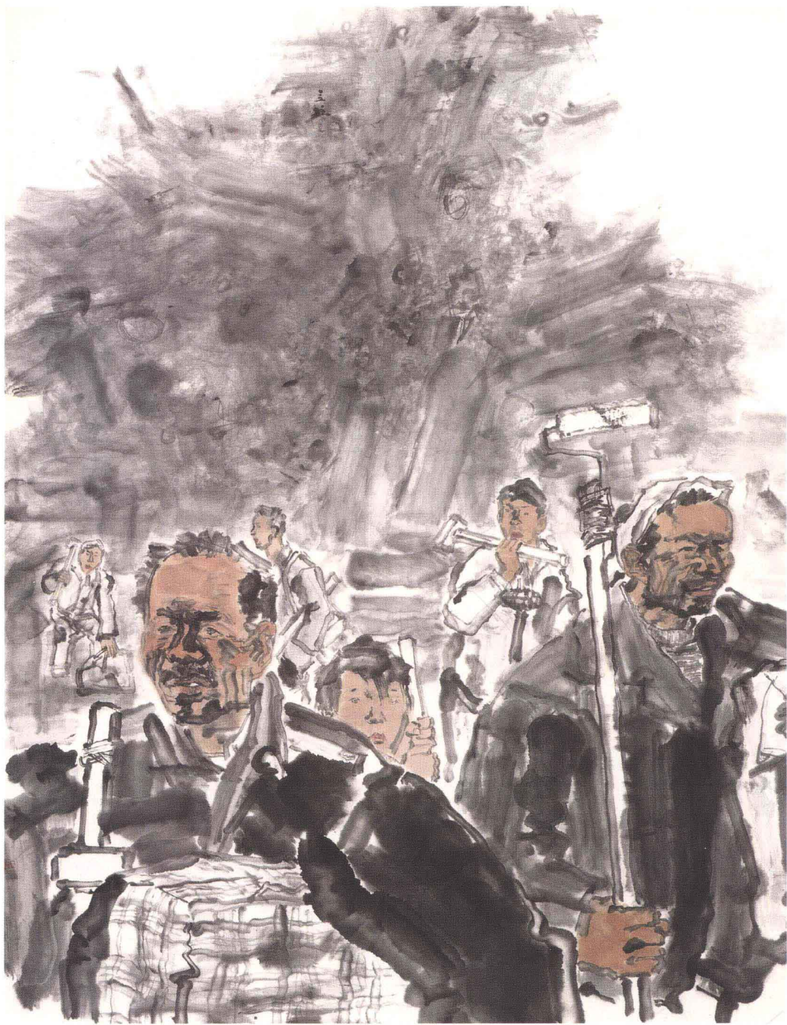
走出槐堡(三) 纸本设色 173cm × 134cm 2004