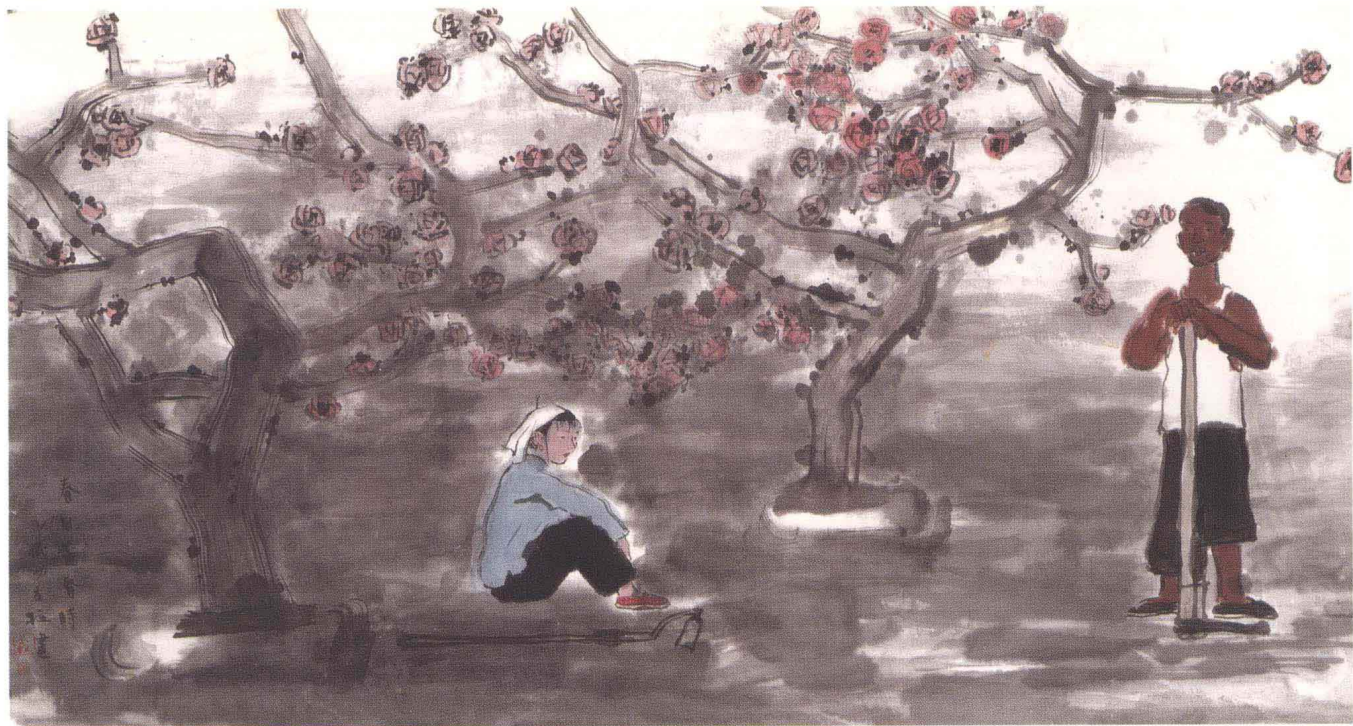
春日黄昏时 纸本设色 68cm × 136cm 2004