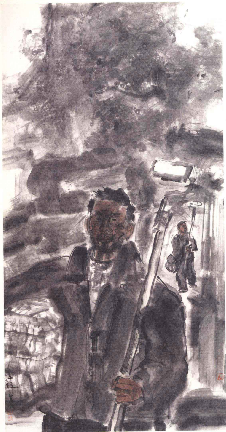
槐乡人(一) 纸本设色 136cm × 68cm 2004