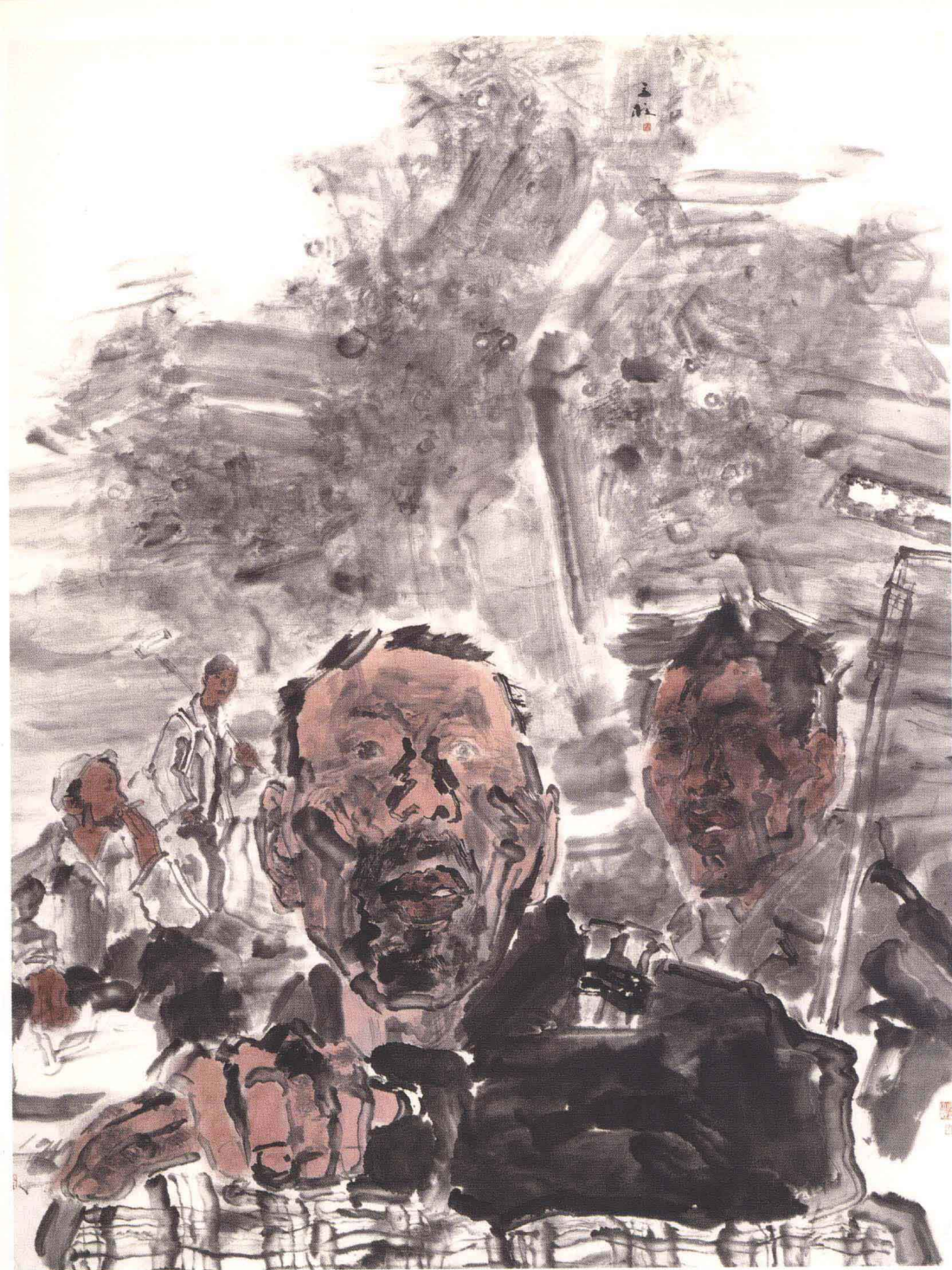
走出槐堡(一) 纸本设色 173cm × 134cm 2004