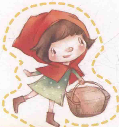
Little Red Riding Hood (LRRH)