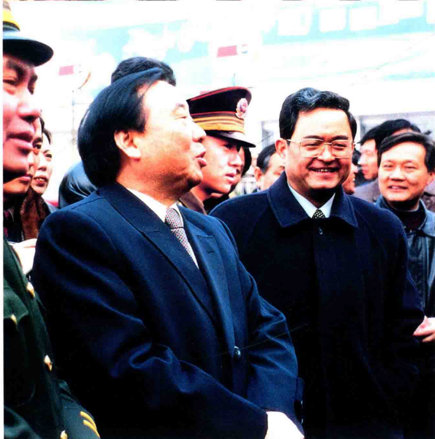
省委书记陈焕友、省长季允石亲切慰问公安民警 The Secretary of Provincial Party Committee Mr. Chen Huanyou and the Nomarch Mr. Ji Yunshi were expressing regards to the Policeman.