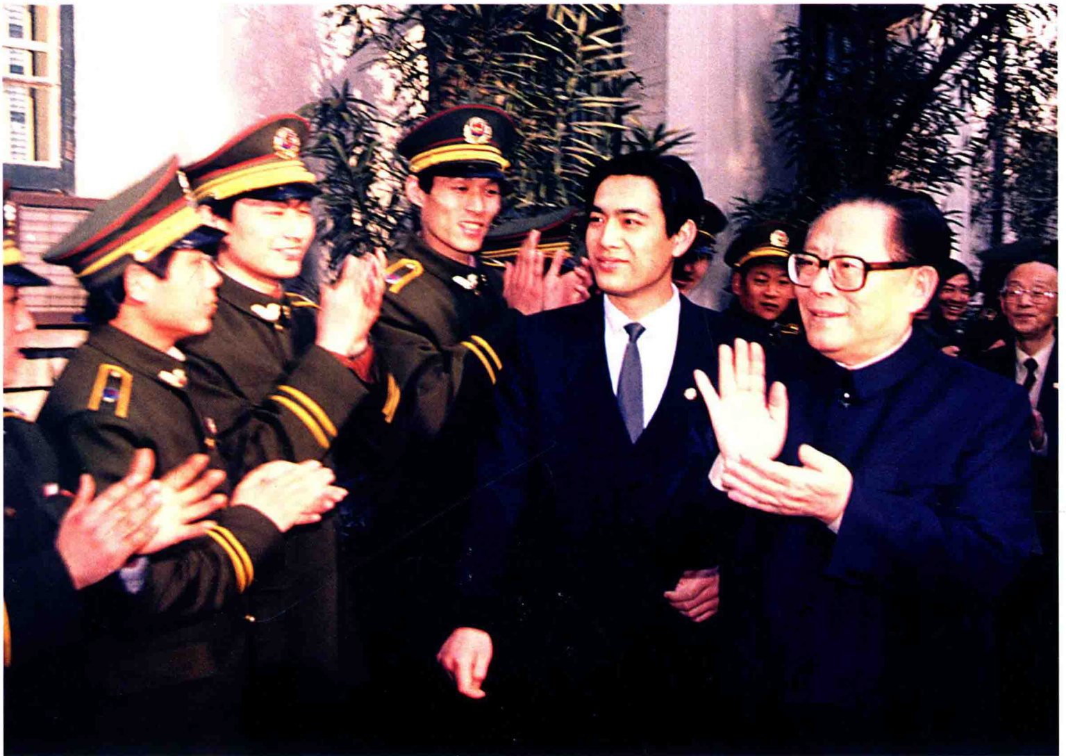
1992 年 1 月，江泽民总书记视察江苏省公安厅 In January of 1992, the Secretary-general Jiang Zemin was inspecting the Jiangsu Police Department