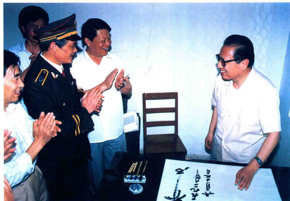
乔石在吴江市公安局视察 Mr. Qiao Shi was inspecting the Police Bureau of Wujiang City.