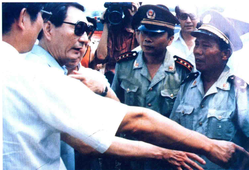
朱镕基在江苏指导抢险救灾工作 Mr. Zhu Rongji was supervising the dealing with emergencies in Jiangsu.