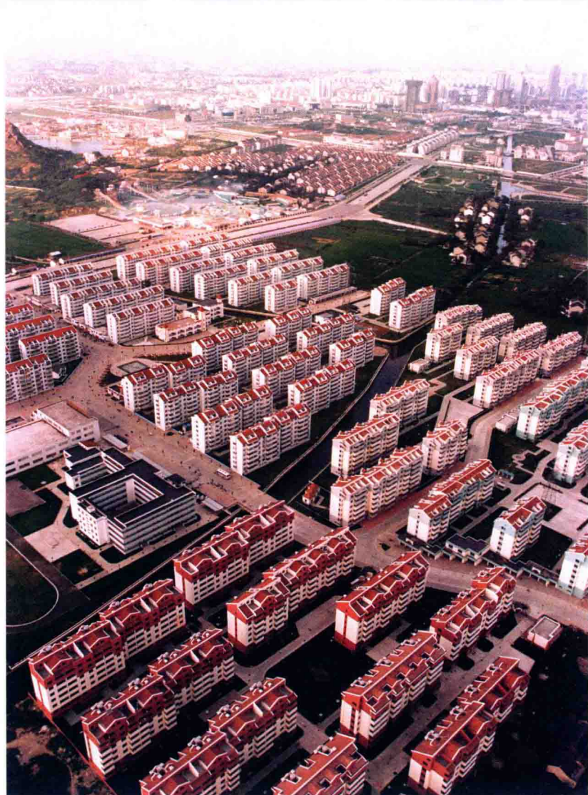
锦绣江南 the splendid sight of south Jiangsu