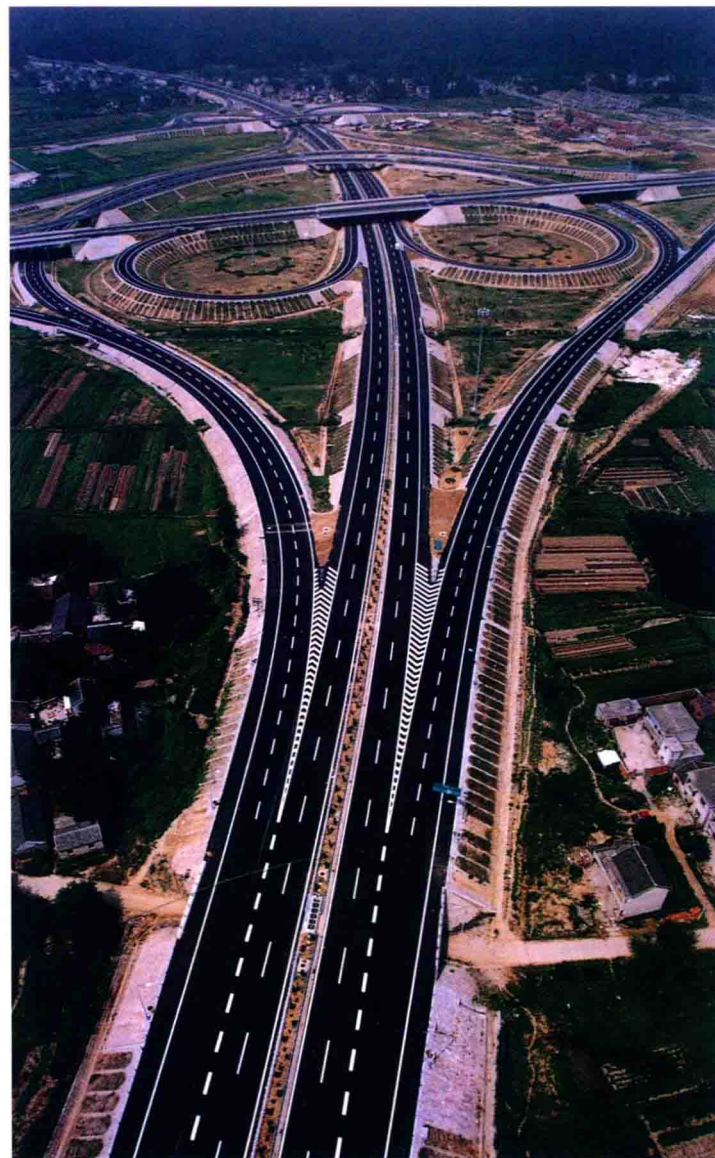
沪宁高速公路 the highway of Shanghai-Nanjing