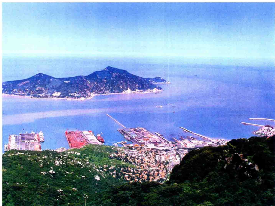
千里海疆 the coastline of Jiangsu