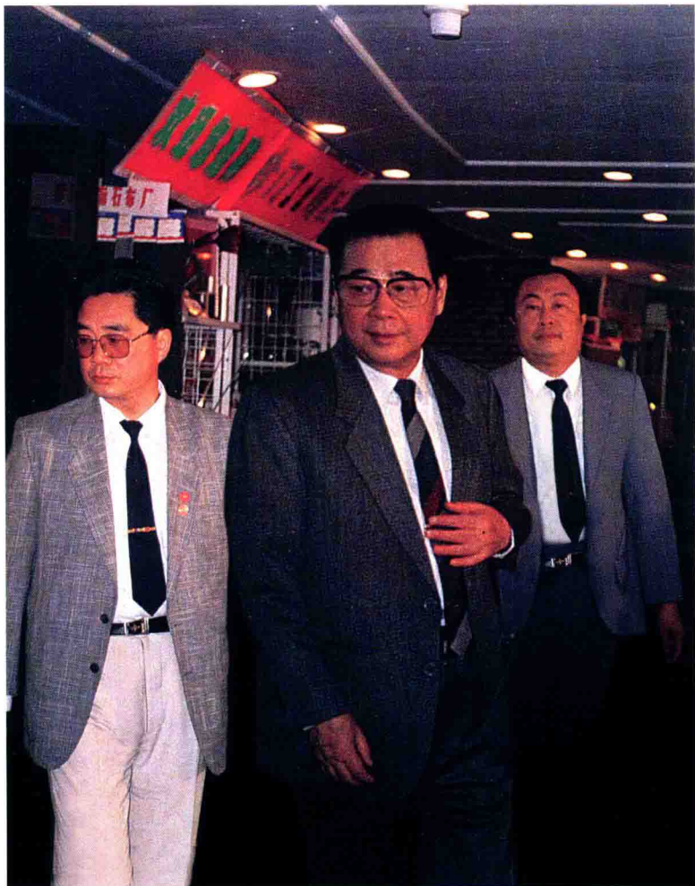
李鹏在常熟市检查社会治安 综合治理工作 Mr. Li Peng was inspecting the Synthesis Administration of Community Security in Changshu City