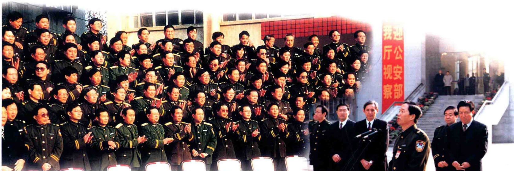
公安部部长贾春旺视察江苏省公安厅 Mr. Jia Chuanwang, the Minister of Police Ministry, was inspecting the Jiangsu Police Department.