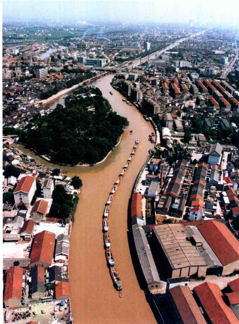
苏北平原 the plain of north Jiangsu