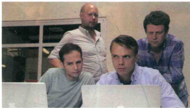
You know too much about him / her.