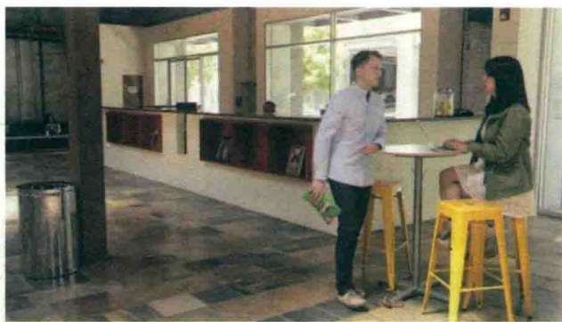
You try to share his / her interests.