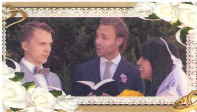
You think about being with him / her forever.

II What do you think is true love? Write down the love story that touches you most in literatures, movies or history, and share it with your partners. The following example is for your reference.