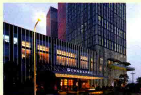
472 WANDA VISTA CHANGSHA 长沙万达文华酒店