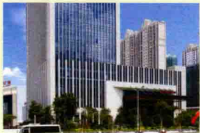
445 WANDA REALM NINGDE 宁德万达嘉华酒店