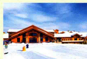
552 CHANGBAISHAN SKI FIELD 长白山滑雪场