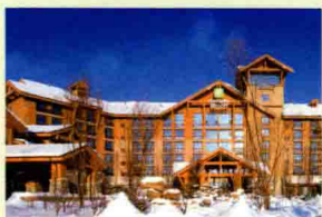
526 HOLIDAY INN RESORT CHANGBAISHAN 长白山万达假日度假酒店