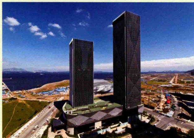
图 1 大连万达中心 康莱德酒店 希尔顿酒店 Figure 1: Dalian Wanda Center, Conrad Dalian & Hilton Dalian

Given that Wanda hotels opened cover holiday resort ones which belong to cultural tourism projects in 2012 and later, for the convenience of reading and understanding, we brief cultural tourism hotel projects and Cultural Tourism Branch of Wanda Commercial Planning & Research Institute, which will not be detailed in Wanda Commercial Planning Yearbook published in the future.