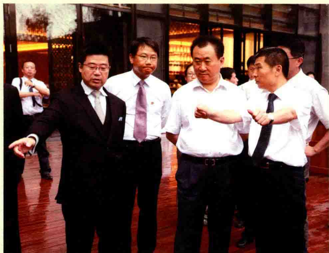
■ 万达集团董事长王健林指导研究院工作 Wang Jianlin, Chairman of Wanda Group, is instructing works of the Institute

鉴于2012年万达当年开业酒店12个，数量较多且步入了稳定发展期，加之开业酒店中有度假类型酒店，内容丰富，因此，《万达商业规划》年鉴首次将当年开业酒店独立汇编成册，以便检索成档。