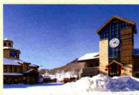
540 CHANGBAISHAN TOURIST TOWN 长白山旅游小镇