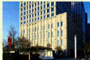
458 WANDA REALM HUAI'AN 淮安万达嘉华酒店