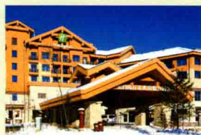
536 HOLIDAY INN CHANGBAISHAN SUITES 长白山万达套房假日酒店