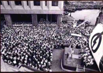
Lee Kuan Yew's Fullerton Square lunchtime rallies were the highlight of many election campaigns, when he delivered his most memorable speeches to office workers, seen here on December 20, 1976.

李光耀在浮尔顿广场的午餐时间群众大会对白领工作人员的演讲，向来是竞选期间的焦点，他的多次重要演讲就是在这个场合上发表的。这是他在1976年12月20日演讲时的盛况。