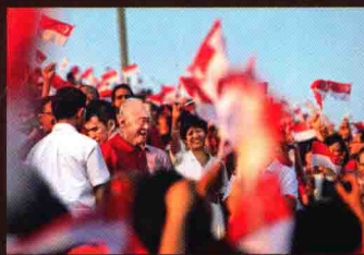
Former prime minister Lee Kuan Yew received a standing ovation from the 26,000-strong crowd at The Float@Marina Bay when he arrived at the National Day Parade on August 9, 2012.

（为新加坡挺身而出），他告诉海峡时报：“因为我经常听孙子们唱这首歌。”