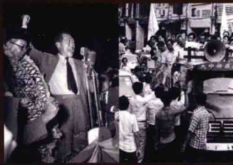
Lee (extreme left) leading a cheer for Malayan Prime Minister Tunku Abdul Rahman, who was going to London to discuss merger between Singapore and Malaya on November 16, 1961. Residents in Tanjong Pagar stretch out their

hands to congratulate Lee (left, on lorry), on his general election triumph on December 24, 1980.