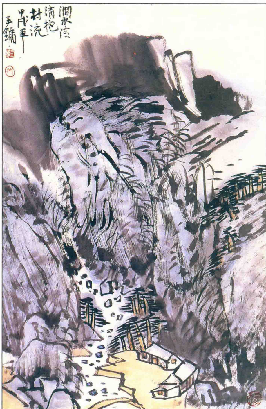
王镛 中国美术家协会会员 中国书法家协会会员