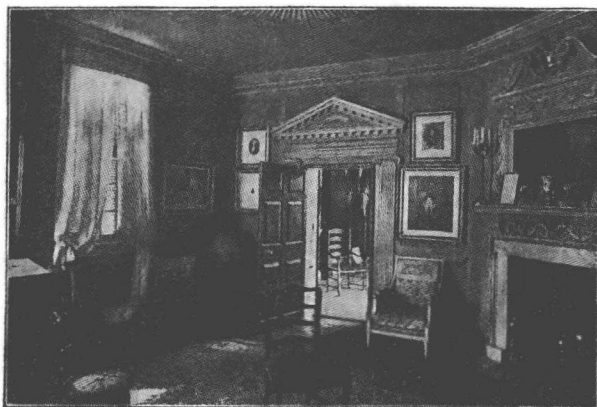
A room at Mount Vernon 弗农山上宅邸中的一室

First Tariff Act, 1789. Schouler's United States , I, 96-102.