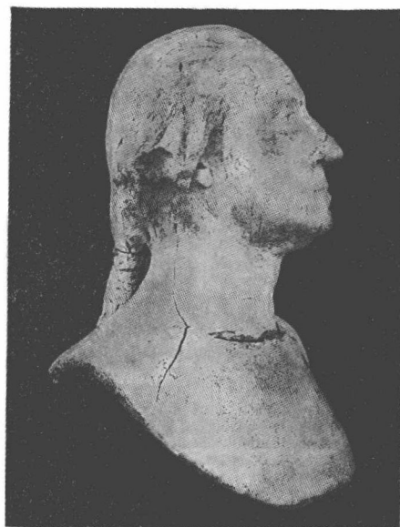
George Washington After a mask made from the living face, 1785 乔治·华盛顿 复制自1785年的一张真人面具

Colonial customs and traditions derived from English precedents were still the rule. Washington, inclined to be stiff and formal, instituted a rigid ceremoniousness in official intercourse which savored little of republicanism. During the recesses of