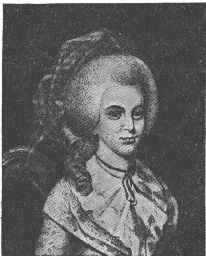
Mrs. Alexander Hamilton 亚历山大·汉密尔顿夫人