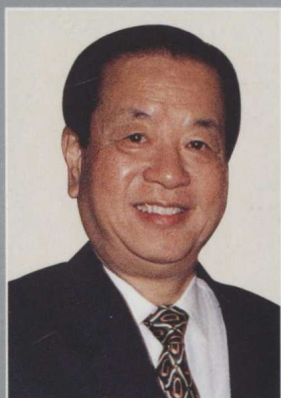
钱其琛 Qian Qichen