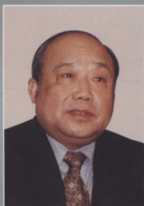
石广生 Shi Guangsheng