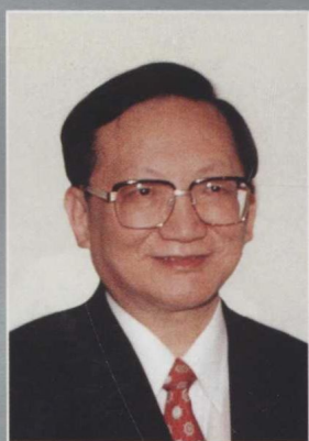
唐家璇 Tang Jiaxuan