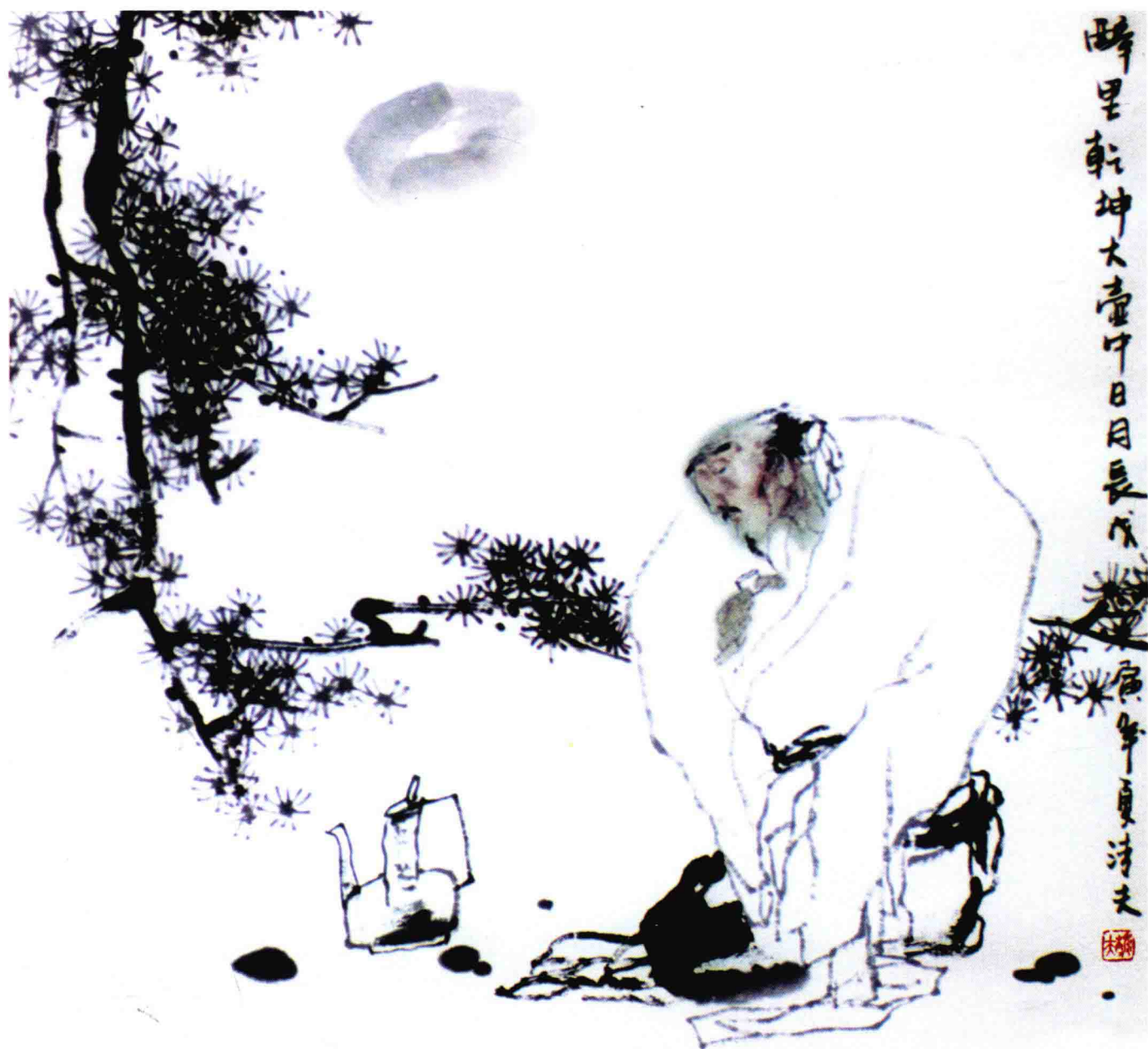
醉里乾坤大壶中日月长 Drinking Philosopher 1998