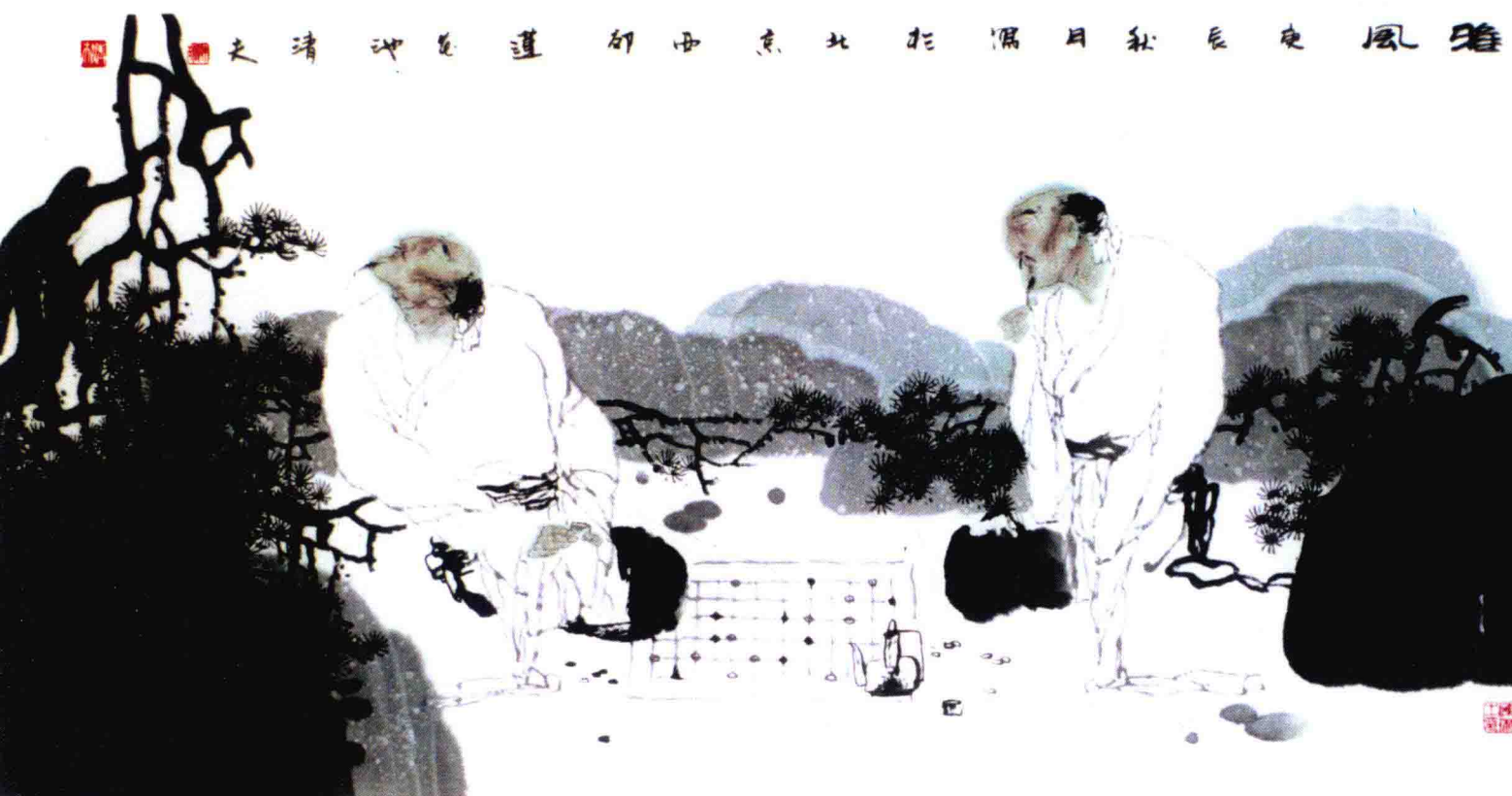
雅风 Refined Taste 2000