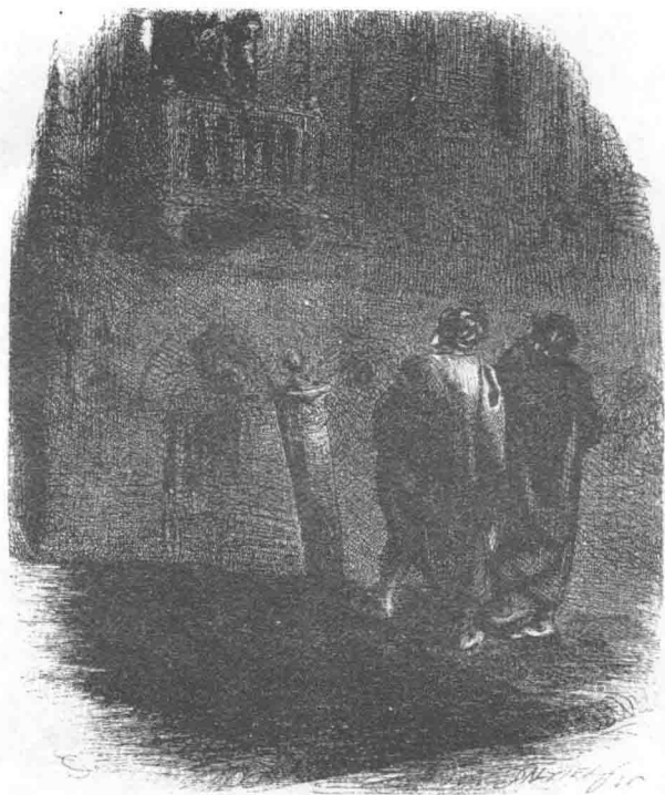
图 2 (见 4 页)