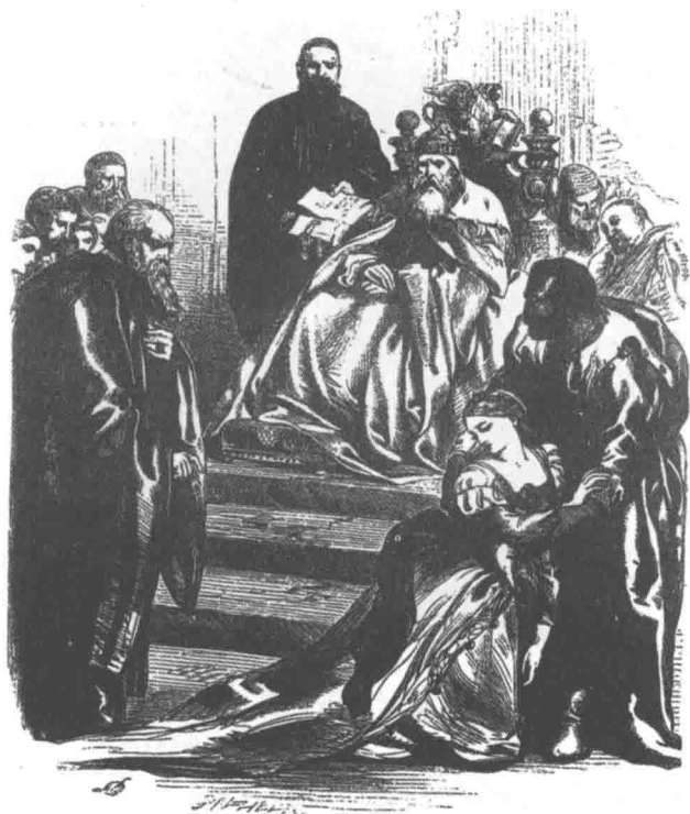
图 7 (见 40 页)

DESDEMONA My noble father, I do perceive here a divided duty: To you I am bound for life and education; My life and education both do learn me How to respect you.