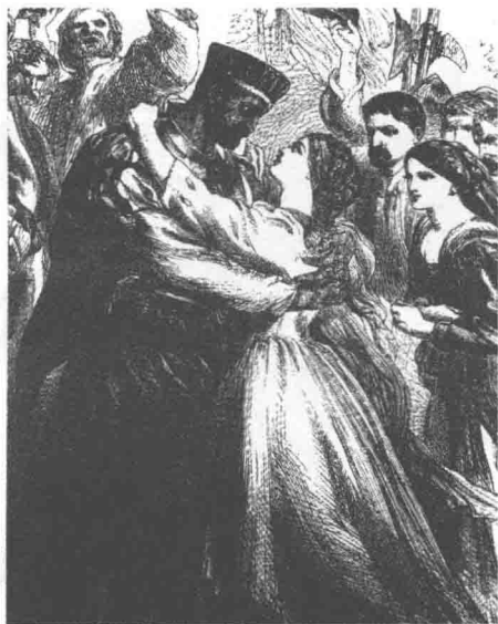
图 10 (见 70 页)