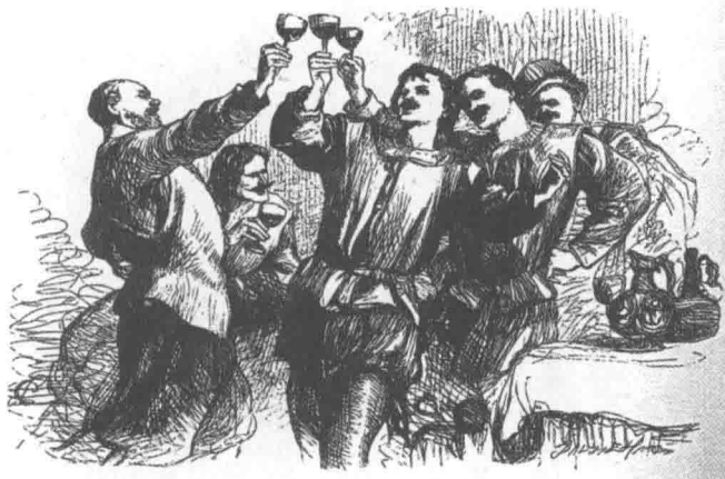
图 11 (见 80 页)

CASSIO Welcome, Iago; we must to the watch.