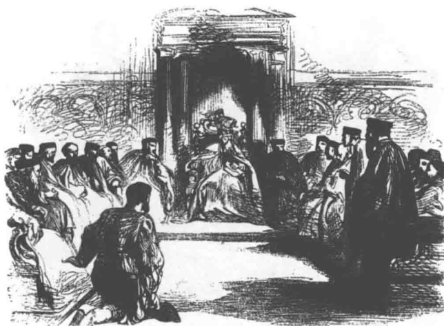
图 5 (见 32 页)