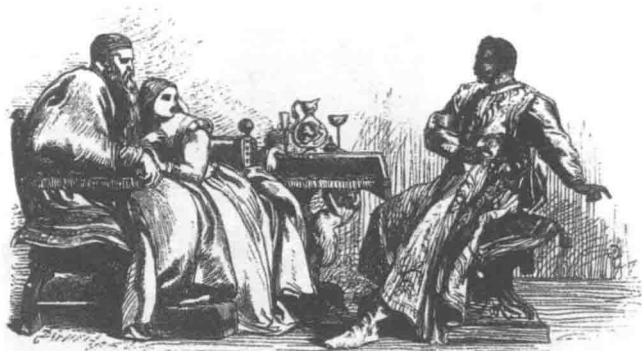
图 6 (见 36 页)