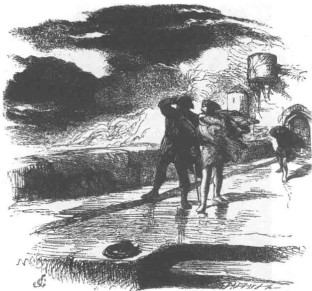
图9 (见 56 页)