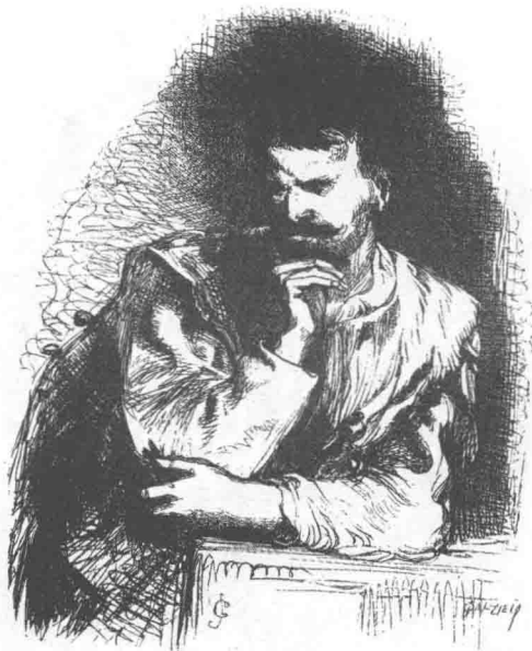
图 8 (见 54 页)