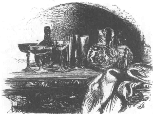
图 13 (见 104 页)