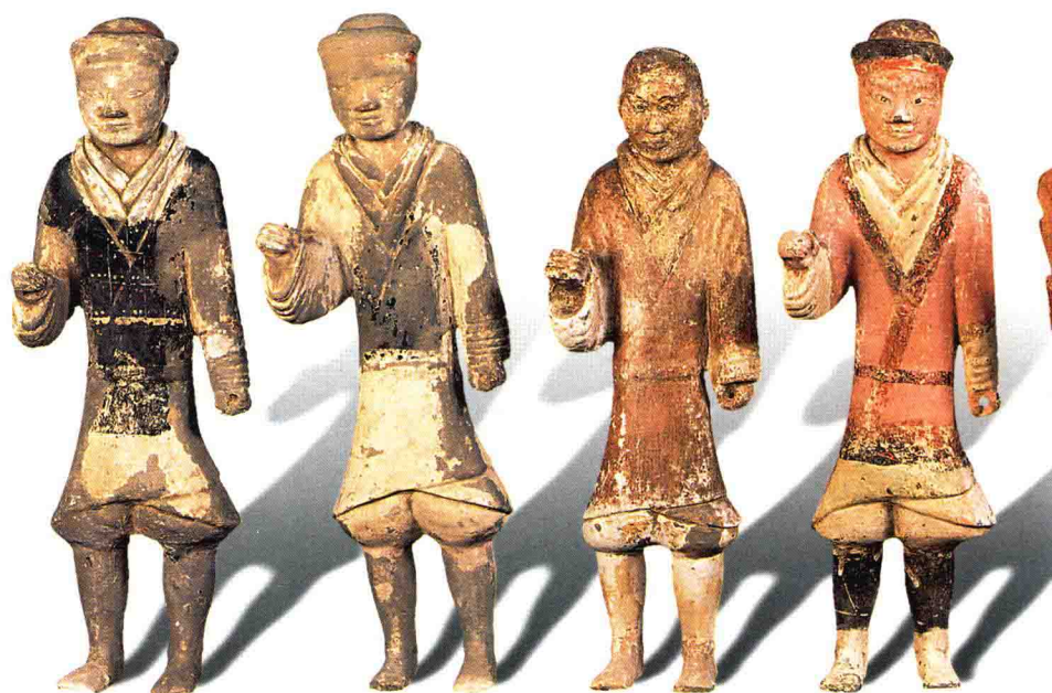
步兵俑 汉 高 48 厘米

Infantry figurine Height 48cm discovered in Han tomb of Yanjiawan of Xian Yang