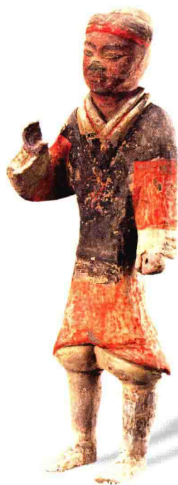
步兵俑 汉 高 49.5 厘米

Infantry figurine Height 49.5cm discovered in Han tomb of Yanjiawan of Xian Yang