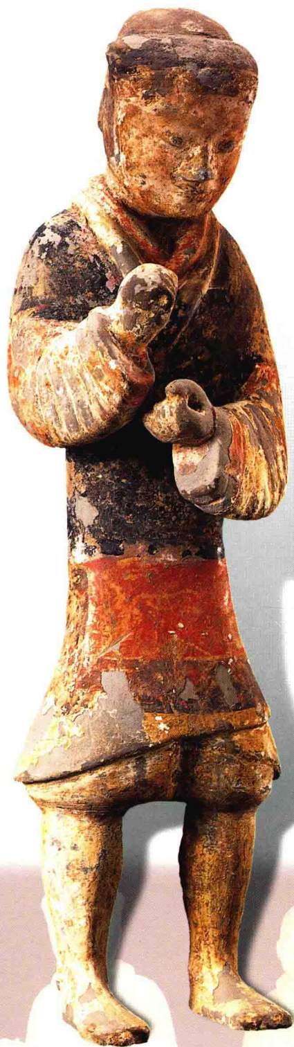
簿书俑 汉 高 48.2 厘米

Official terracotta figurine Height 48.2cm discovered in Han tomb of Yanjiawan of Xian Yang