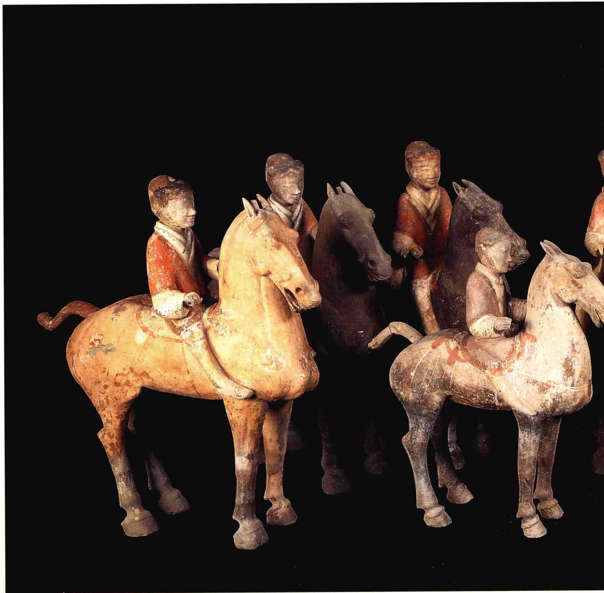
骑兵俑 汉 高 68 厘米

Cavalryman terracotta figurine Height 68cm discovered in Han tomb of Yanjiawan of Xian Yang