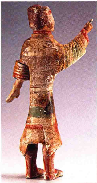
指挥俑 汉 高 56 厘米

Commander terracotta figurine Height 56cm discovered in Han tomb of Yanjiawan of Xian Yang