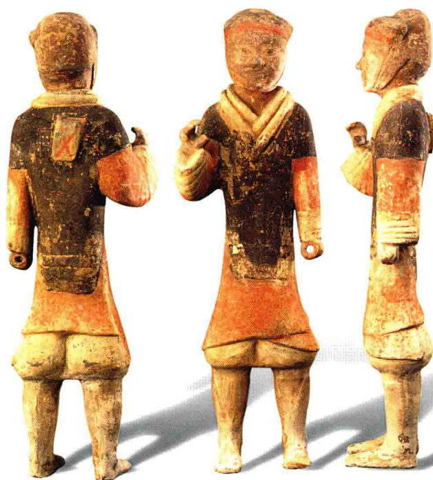
背箭囊步兵俑 汉 高 48.5 厘米

Infantry figurine carry- ing arrow sack Height 48.5cm discovered in Han tomb of Yanjiawan of Xian Yang