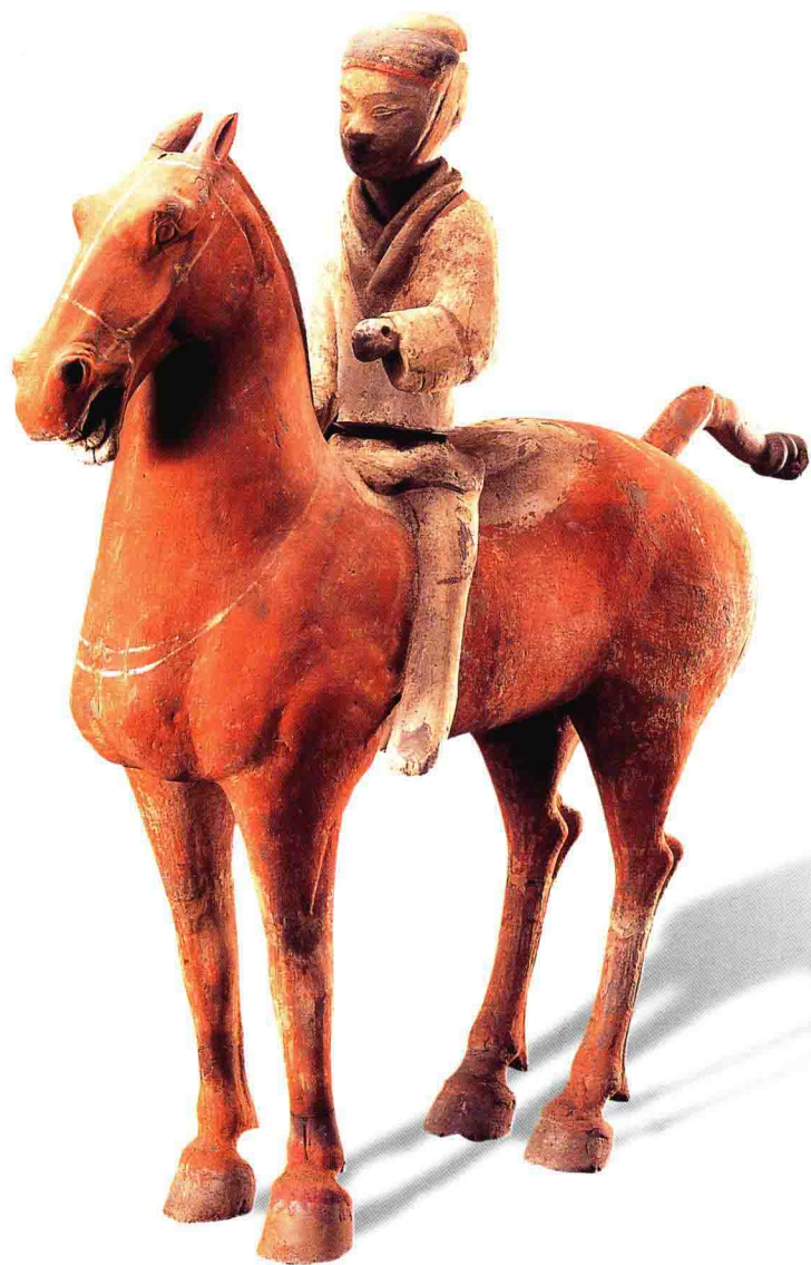
骑兵俑 汉 高 50~68 厘米

Cavalryman terracotta figurine Height 50cm discovered in Han tomb of Yanjiawan of Xian Yang