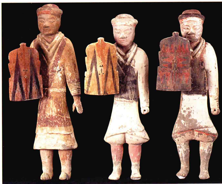
执盾俑 汉 高 48 厘米

Terracotta figurine holding shield Height 48cm discovered in Han tomb of Yanjiawan of Xian Yang