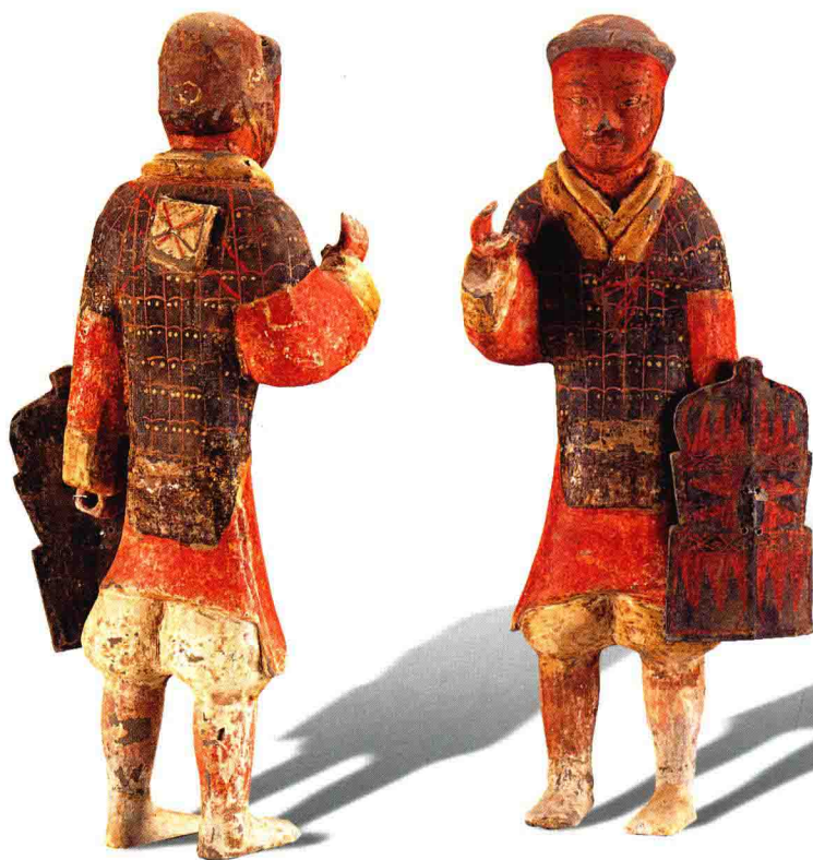
铠甲俑 汉 高 48.5 厘米

Terracotta figurine dressing in armour Height 48.5cm discovered in Han tomb of Yanjiawan of Xian Yang