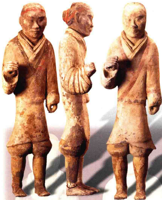
战袍俑 汉 高 48~53 厘米

Terracotta figurine dressing in martial robe Height 48cm discovered in Han tomb of Yanjiawan of Xian Yang