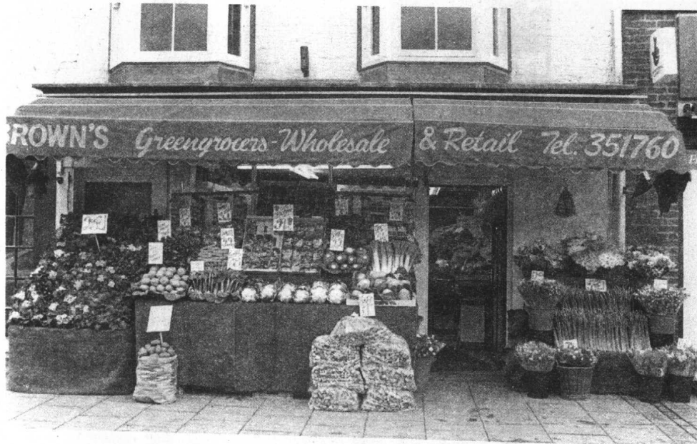
Greengrocer's and florist's shop