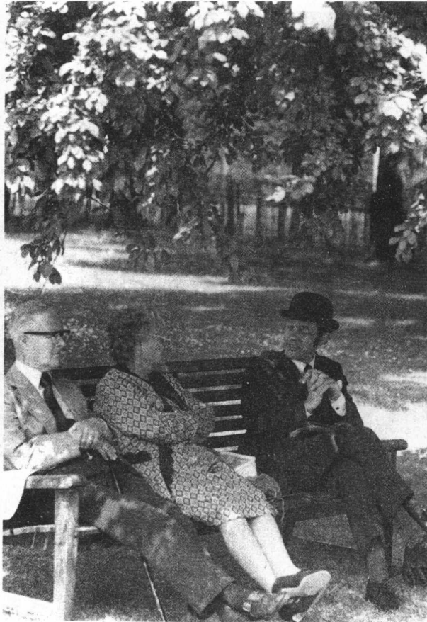
City gentleman talking with elderly people in the park