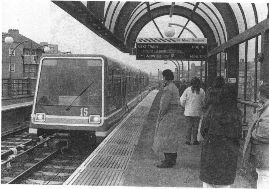
People on platform (London - Docklands Light Railway)