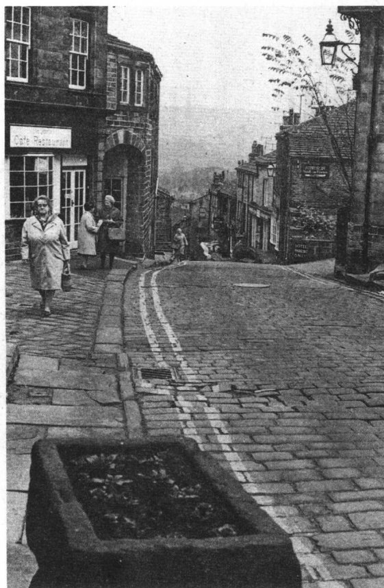
Cobble stoned street in North Yorkshire