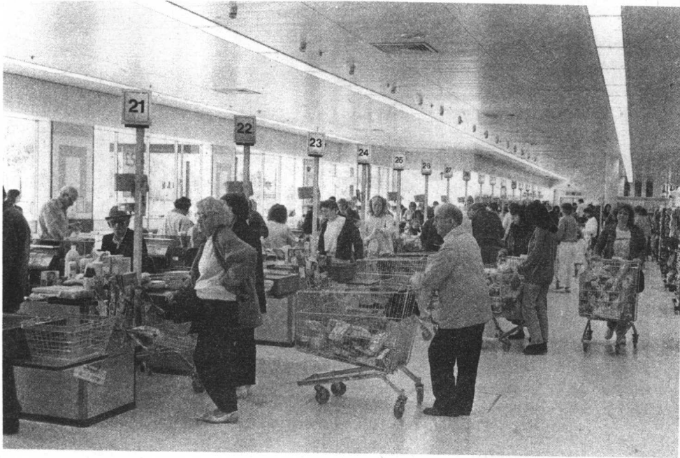
People at supermarket check-out