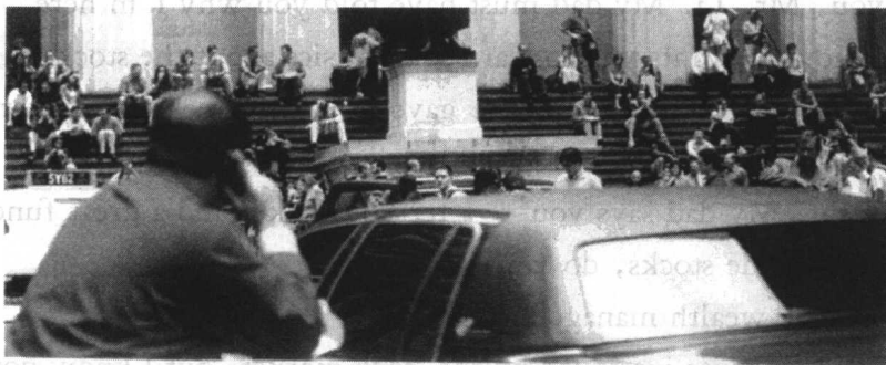
In 1961, Securities Exchange Commission (证券交易所委员会)