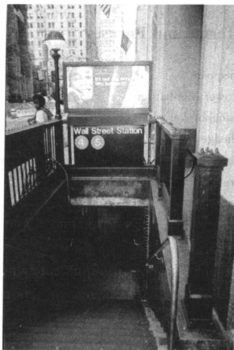
A subway stop at Wall Street (华尔街地铁站)