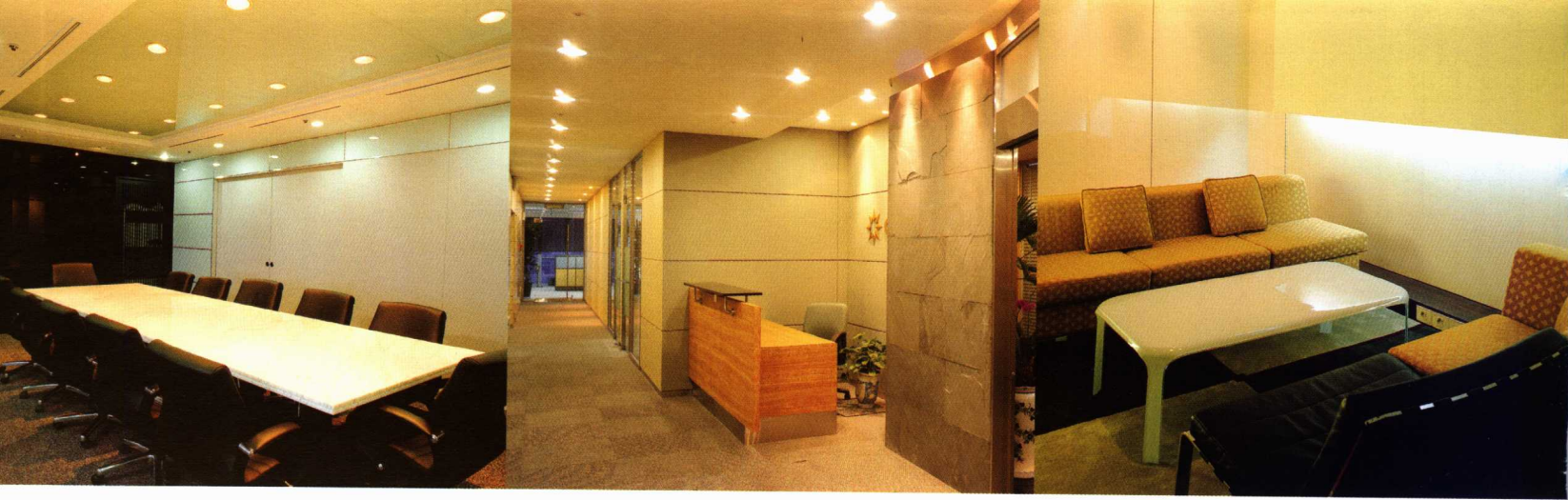
Red Herring Bearsterns C&H Capital LAJOLLA The Building of A Company Rhee Capital Advisors