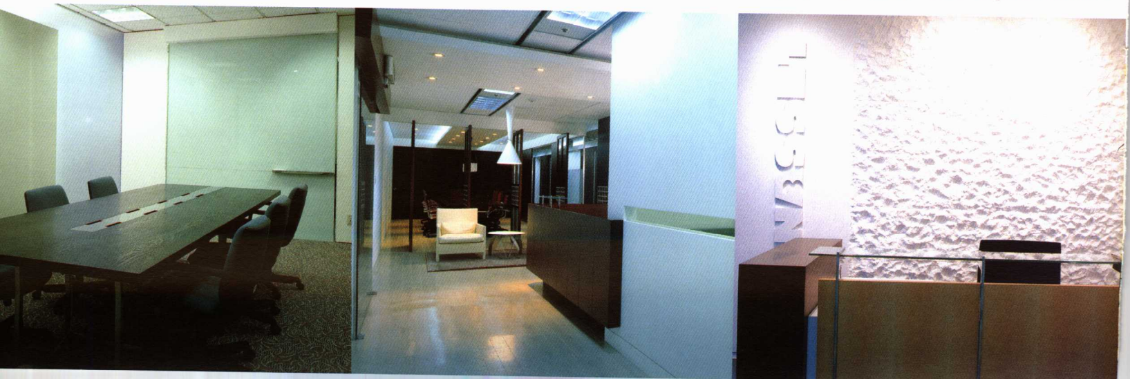
Red Herring Bearsterns C&H Capital LAJOLLA The Building of A Company Rhee Capital Advisors