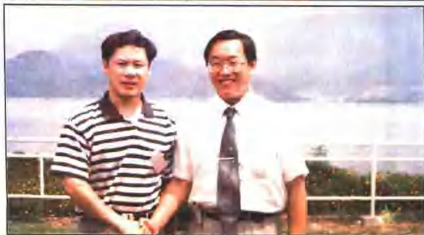
采访 大亚湾核电站 与首任 中国站长 著名核电专家 濮祖龙 留影