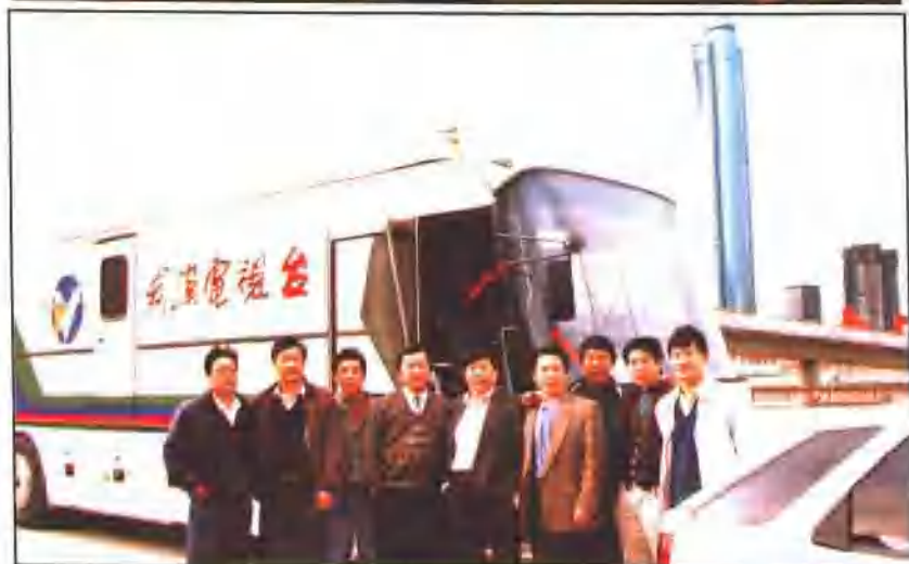
作者 与电视同仁 在深圳采访