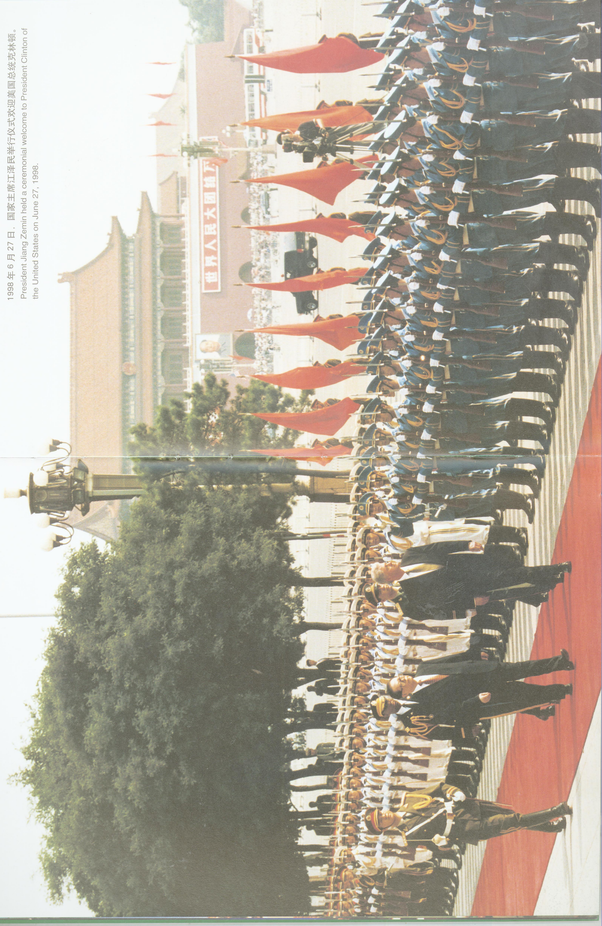
1998年6月27日，国家主席江泽民举行仪式欢迎美国总统克林顿。 President Jiang Zemin held a ceremonial welcome to President Clinton of the United States on June 27, 1998.