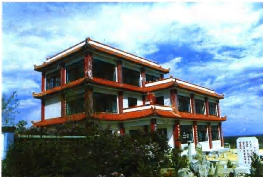
▲望海閣 Wanghai pavilion (Looking at Sea Pavilion)