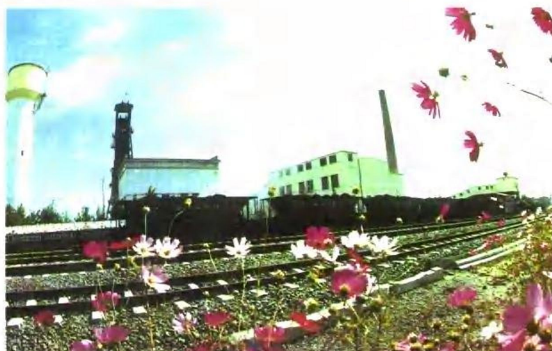
▲ 城西煤礦 Chengxi Coal Mine