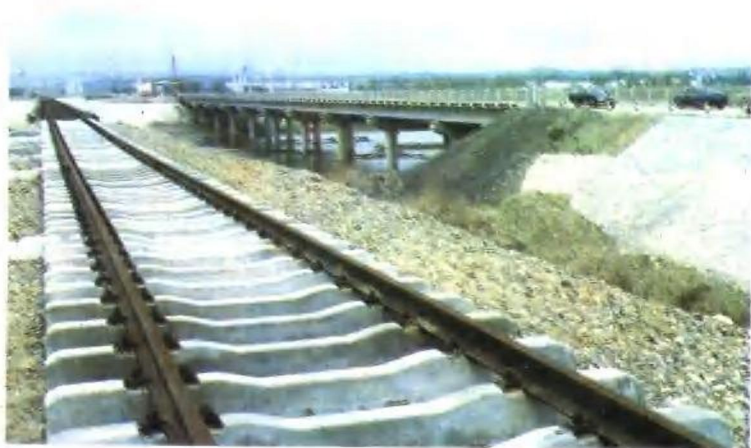
▲琿春至俄羅斯馬哈林諾鐵路 Hunchun-Makhalino (Russia) Railway