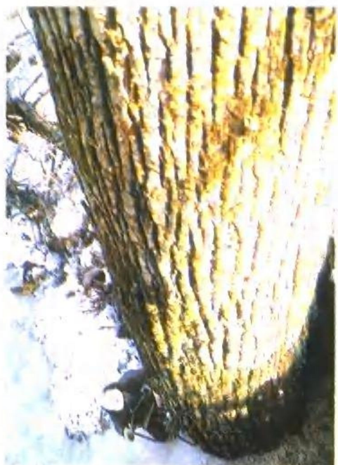
◀ 采伐 Tree felling