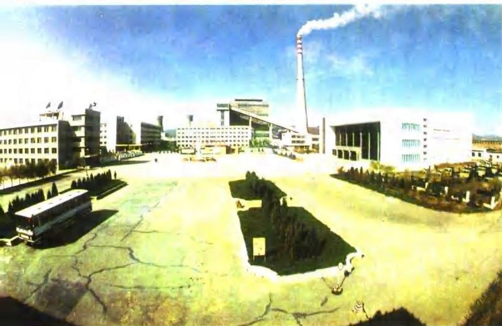
▲ 琿春發電廠 Hunchun Power plant