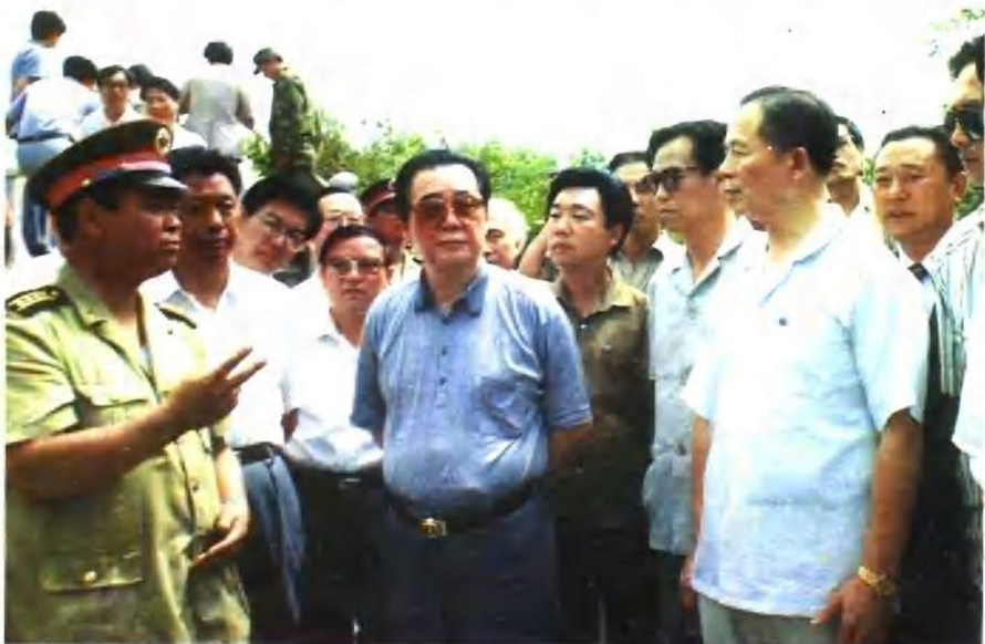
▲李鵬視察琿春 Li Peng inspects Hunchun