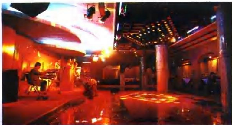
▲秀風歌舞庭 Xiufeng Dance and Sing Hall