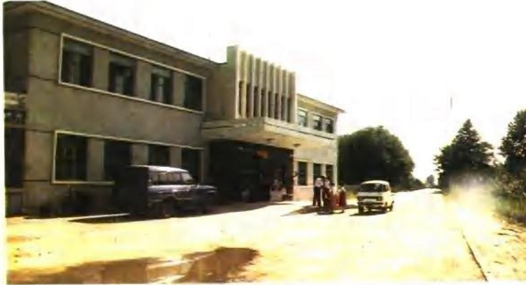
▲ 沙坨子口岸 The Shatuozi Crossing