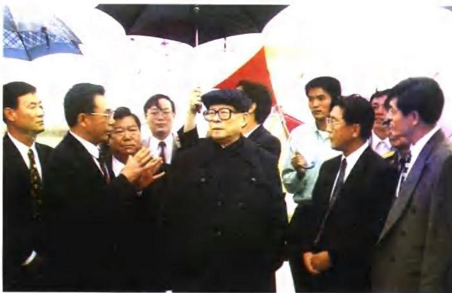
▲1995年6月23日江澤民第二次視察琿春 Jiang Zhemín inspects Hunchun on June 23, 1995 the second time