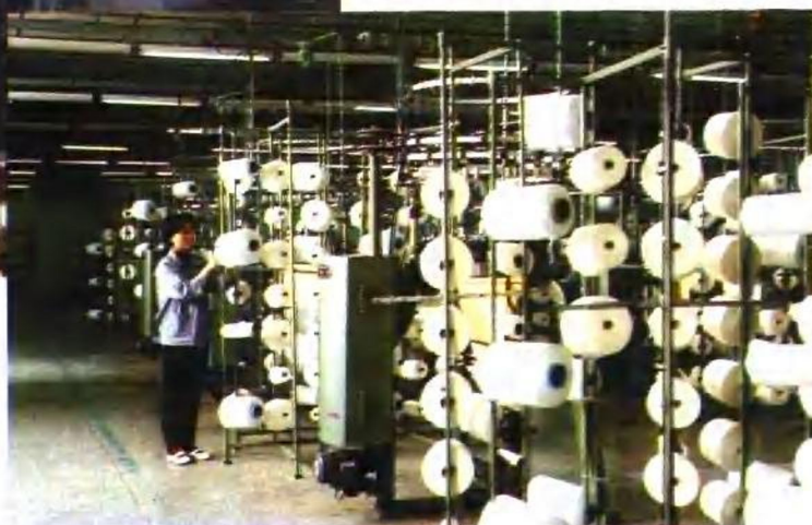
▼東一針織廠 Dongyi (Dong-li) Knitware Co., Ltd.