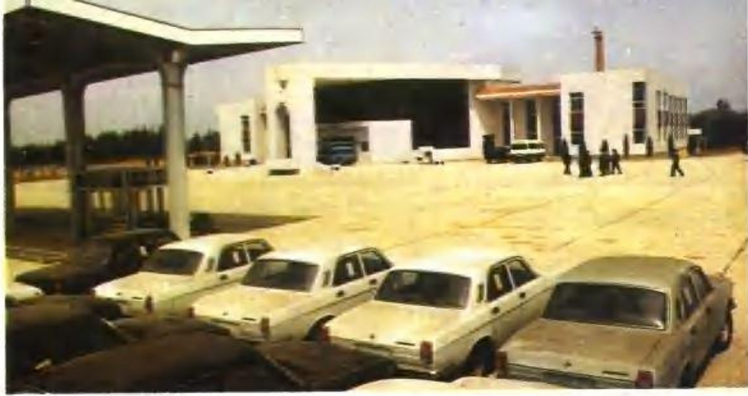
▲ 琿春口岸 The Hunchun Crossing