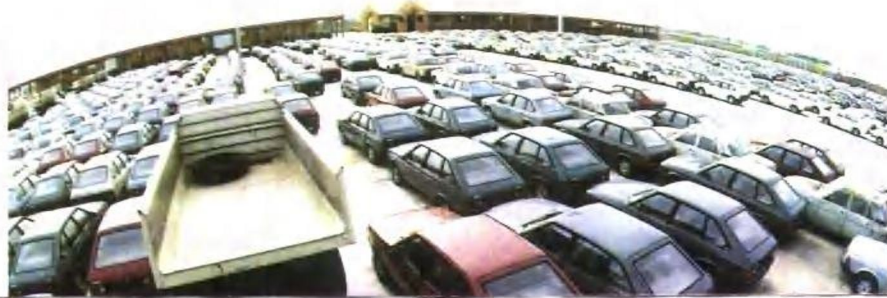
▼ 保税库 Bonded warehouses