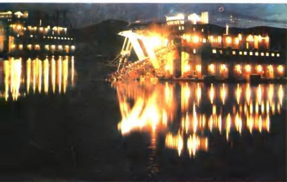
▼ 采金船 Gold dredger