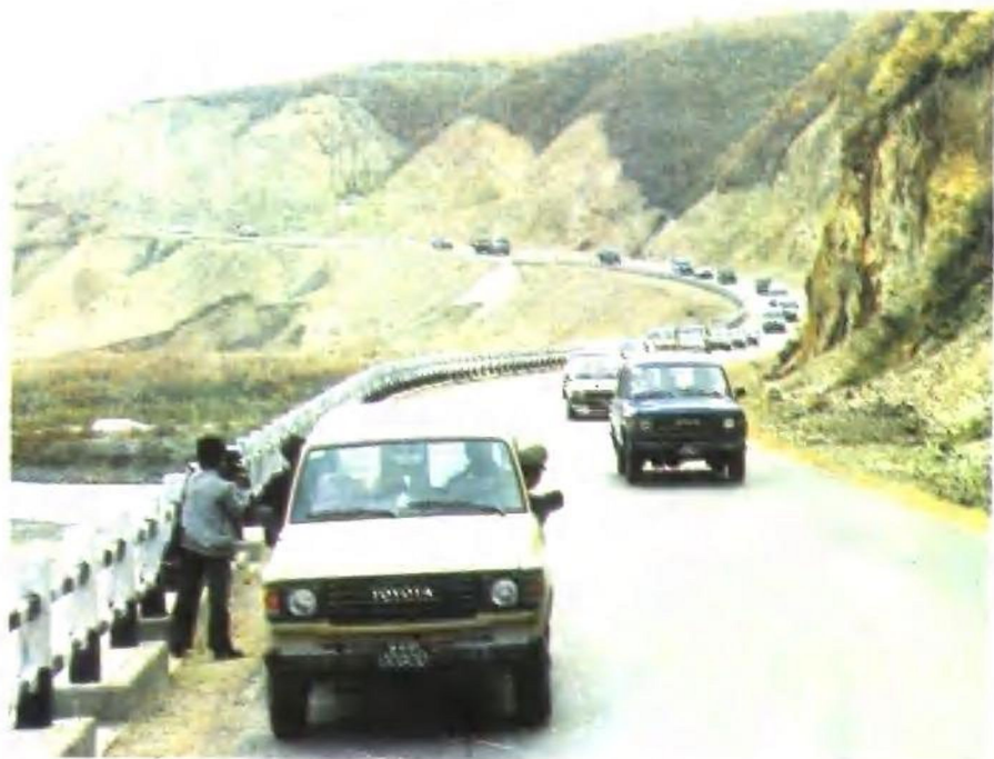
▲圖們——琿春公路 Tumen-Hunchun Highway