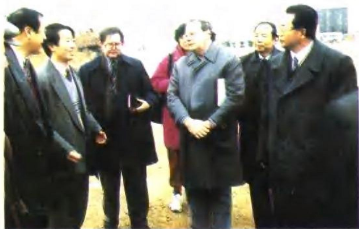
▲聯合國 UNDP 工發組織考察琿春 Officials of UNDP investigate Hunchun