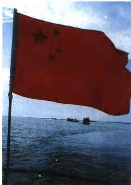
►圖們江出海口 The mouth of the Tumen. River.