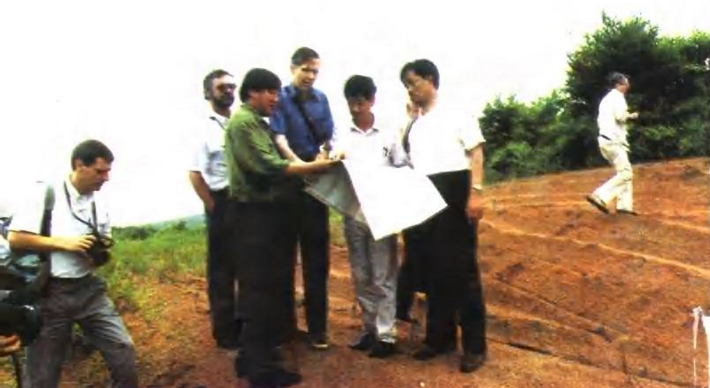
▲聯合國開發計劃署考察琿春 Officials of UNIDO investigate Hunchun