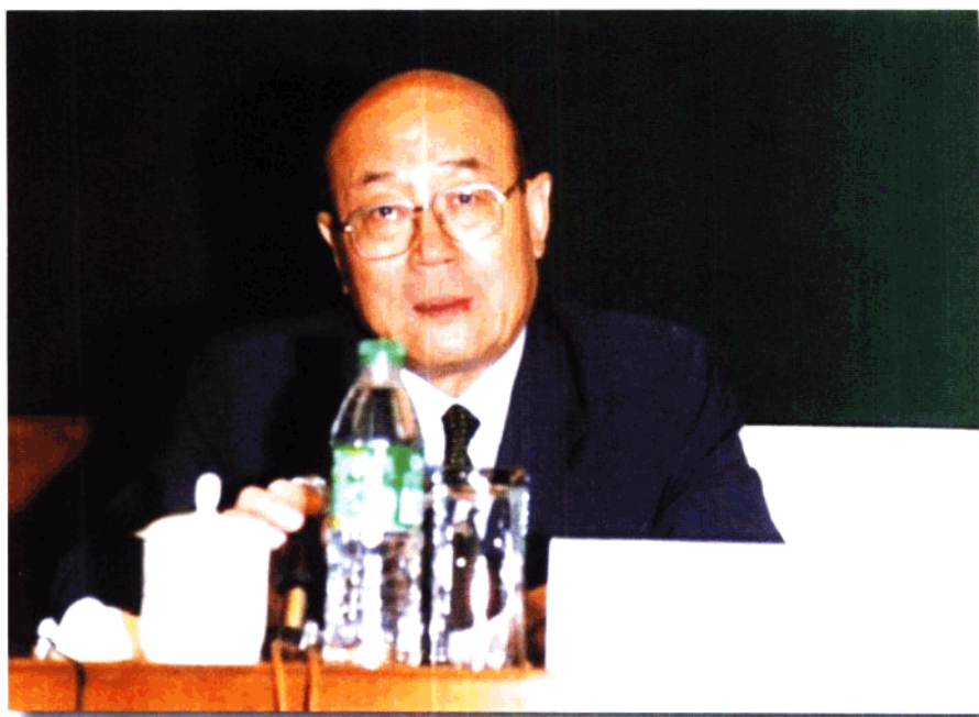
全国政协外事委员会主任、 本次论坛组委会副主席田曾佩主 持开幕会

Tian Zengpei, Chairman of the CPPCC Committee of Foreign Affairs and Vice-Chairman of the Organizing Committee of the Forum, presided over the opening ceremony.