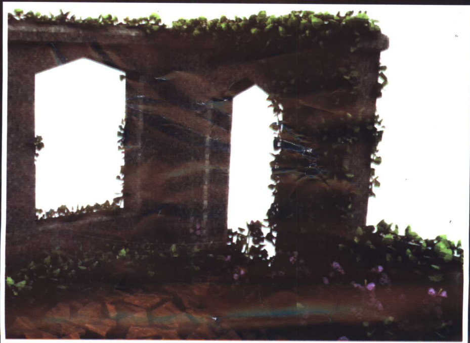
Plate C "Voxel Garden."