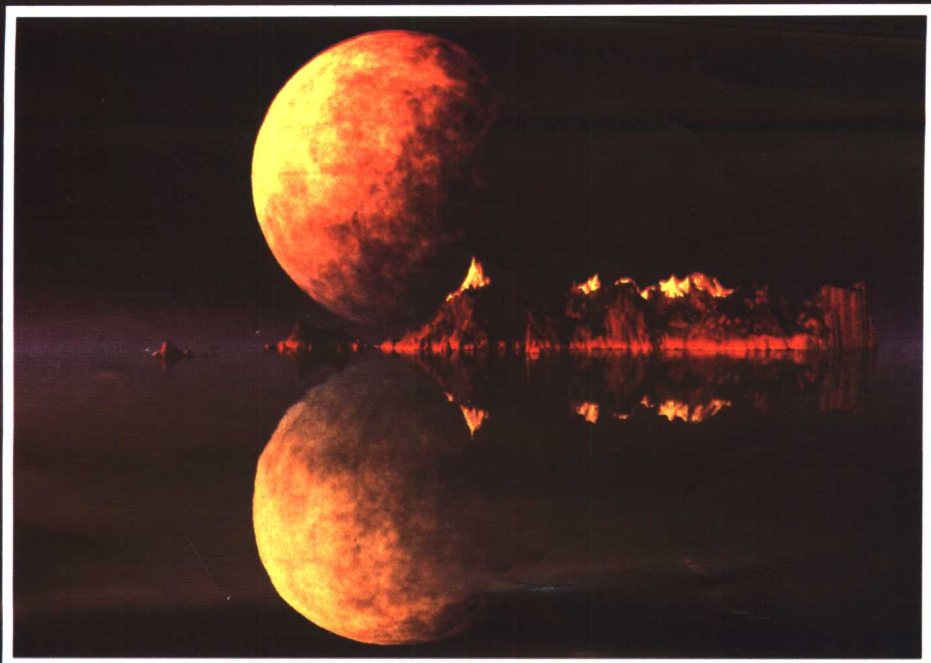
Plate B "Blessed State," by F. K. Musgrave.