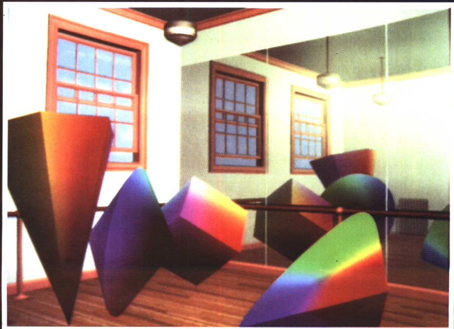
Plate H "Color Choreography." Four color spaces are shown: HSV hexcone, the Ostwald double cone, the RGB cube, and the CIE color space.