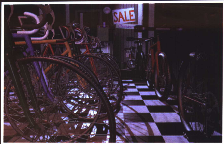
Plate F "Red's Dream," by J. Lasseter, E. Ostby, W. Reeves, and H.B. Siegel.