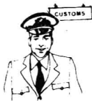
a customs officer

There's a customs officer. He's looking at the suitcases. He's opening the suitcases.