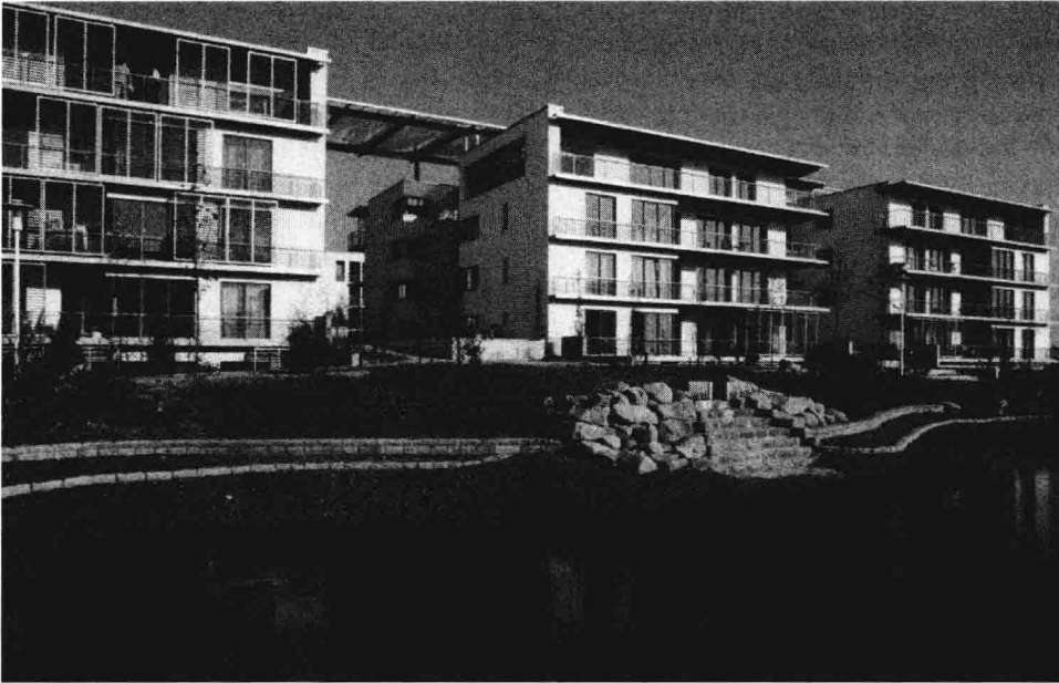
◀ At Kronsberg, a sustainable, mixed-use community in Hanover, Germany, storm water is collected in ponds. In the background, a residential building has movable sunscreens to control heat gain. Willen Associates Architekten. Photo by Karl Johaentges.

components (building walls, trusses, etc.) that can be shipped easily has traditionally been more successful than prefabrication of whole units. Manufactured homes, also known as mobile homes or trailers, have, however, become a staple of low-cost American housing. Mobile homes are built to separate codes and valued as personal property. Another type of prefabricated housing, modular housing, has seen significant market growth in the last decade. Modular homes are built in factories to the same codes as site-built housing, and they are often indistinguishable from site-built homes once completed. They consist of one or more modules narrow enough to travel along a highway and that can be expanded or combined on the site.