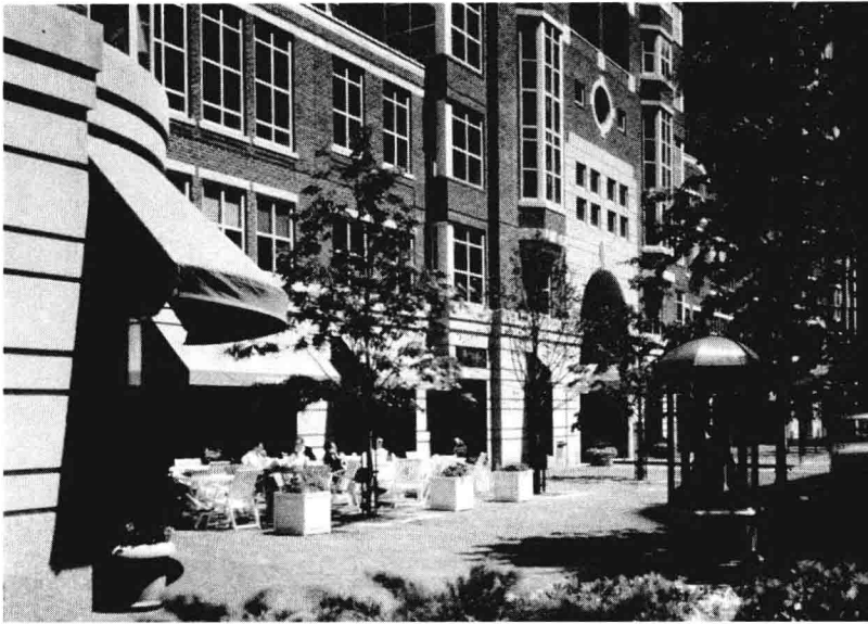
▲ Street-level commercial space at the base of mixed office and residential mid-rise housing at The Heritage , Boston, enlivens the neighborhood and serves building residents. The Architects' Collaborative .

and the way these dwellings when aggregated create whole streets, neighborhoods, and communities. We believe that balancing private and public space creates a good place to live. A large, luxurious house in a hostile environment can become a fortress and a prison for its occupants, just as the most beautiful public amenities cannot compensate for inadequate shelter. Chapter 2, "Housing and Community," discusses the elements that make a successful residential community.