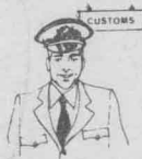
a customs officer

There's a customs officer. He's looking at the suitcases. He's opening the suitcases.