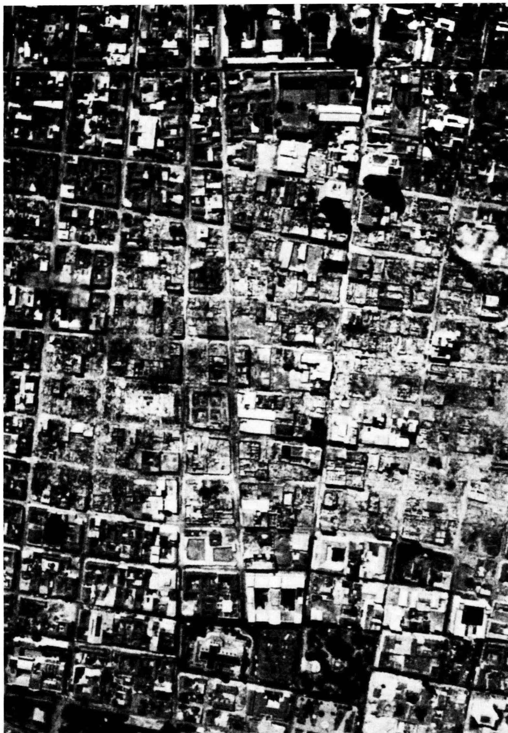
FIGURE 1. Aerial photograph of downtown Managua, Nicaragua following the December 23, 1972 earthquakes, depicting complete destruction for many city blocks and smoldering rubble in the area of heaviest damage. Approximately 75% of the city was leveled to rubble. (From Lander, J. F. and von Hake, C. A., Earthquake Inf. Bull. , 5, 9, 1973.)