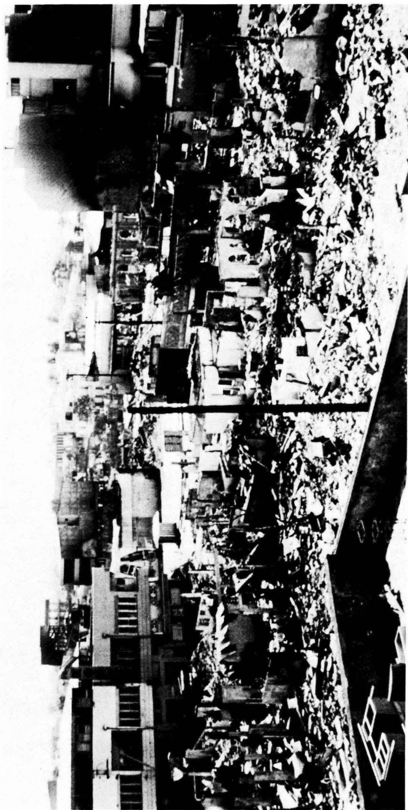
FIGURE 2. Ground view showing devastation of a downtown area of Managua, Nicaragua following the December 23, 1972 earthquake.